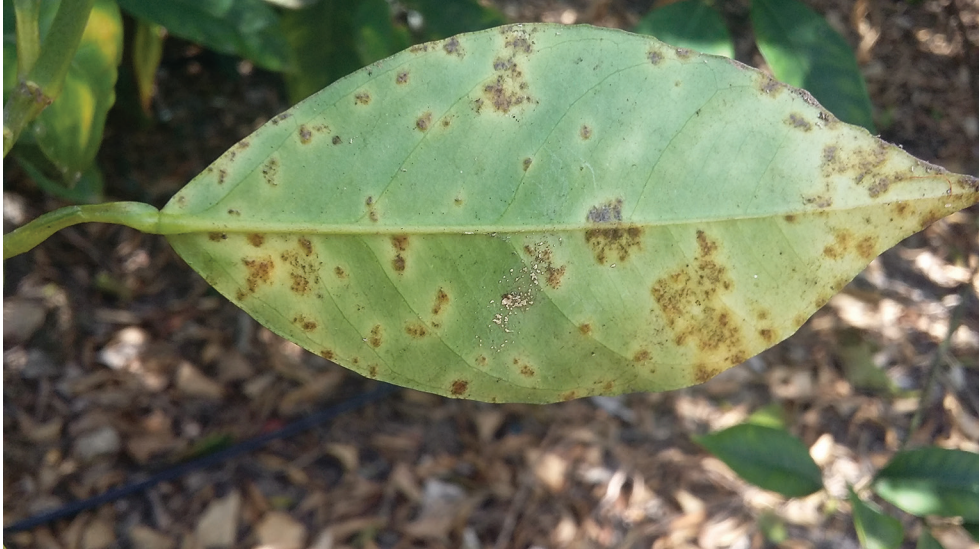
Figure 10. Symptoms of foliar greasy spot on the lower leaf surface of sweet orange.

The analysis of the fungal community using an amplicon metagenomic approach has revealed that Mycosphaerellaceae were the dominant group of fungi, in both symptomatic and asymptomatic leaves, and were represented by the genera Ramularia , Mycosphaerella and Septoria , with about 44, 2.5 and 1.7% of the total detected sequences [39]. The most abundant sequence type was associated to Ramularia brunnea , a species originally described to cause leaf spot in a plant of the family Asteraceae. Surprisingly, none of the detected sequences clustered with reference species currently reported as possible causal agents of greasy spot. Results are not conclusive and the aetiology of this emerging disease is still unresolved.