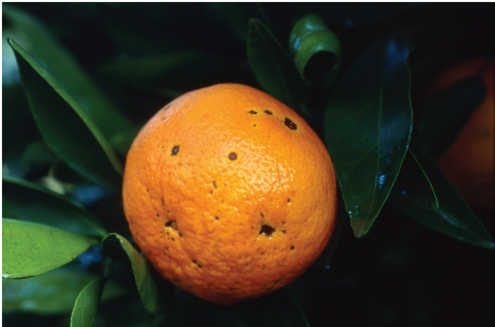
Figure 7. Alternaria brown spot on 'Nova' tangelo hybrid.