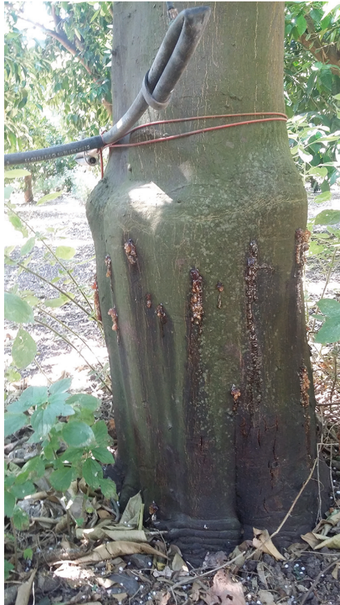
Figure 13. Trunk gummosis caused by Phytophthora citrophthora on a citrus tree.

parts of the tree, including roots, stem, branches, twigs, leaves and fruits. There are several forms ( facies ) of Phytophthora diseases including root rot, foot rot ( Figure 13 ) (also known as Phytophthora gummosis, trunk gummosis or collar rot), fruit brown rot ( Figure 14 ), twig and leaf dieback (often indicated collectively as canopy blight) and rot of seedlings (better known as damping off of seedlings). Trunk gummosis and root rot are the most serious facies of this group of diseases, and after the pandemic outbreak of the nineteenth century and the consequent widespread use of resistant rootstocks, they are regarded as endemic diseases in all citrus-growing areas of the world.