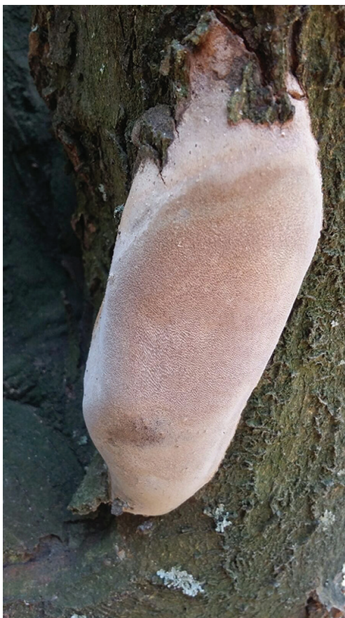
Figure 12. Basidiocarp of Fomitiporia mediterranea.

genotypes. This and the high frequency of basidiomata in old commercial orchards confirm the outcrossing nature of reproduction in F. mediterranea and the primary role of basidiospores in the dissemination of inoculum. Prevention is the only way to manage wood rots. Trees should be kept healthy and vigorous. Large pruning cuts, or other wood-exposing injuries, should be avoided, especially during wet periods. Proper management guidelines include sanitation of pruning cuts with mastics to prevent the penetration of the pathogen.