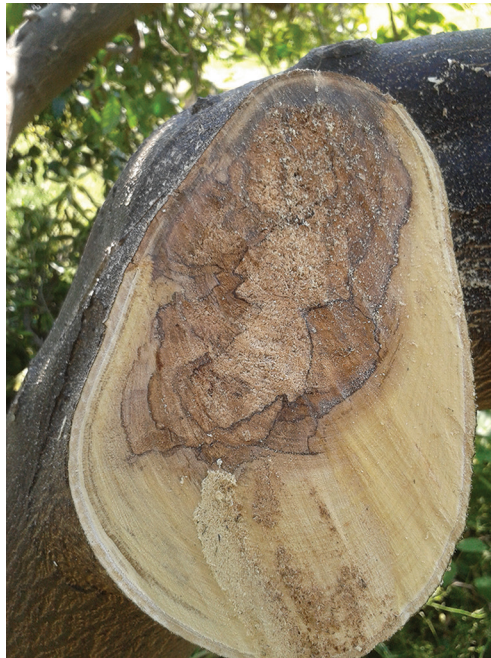
Figure 11. Symptoms of wood rot caused by Fomitiporia mediterranea on Citrus sp..

F. mediterranea is a ubiquitous and polyphagous species, commonly found also on other fruit, ornamental and forest tree species, such as hazelnut, olive, kiwi, locust tree and privet. On grape, it is associated to 'Esca' disease. It is assumed that most infections in citrus orchards originate from airborne basidiospores germinating on large pruning wounds of trunk and main branches. Basidiospores produced by basidiomata germinate with relative humidity over 90% and are dispersed by wind. Usually, basidiomata ( Figure 11 ) emerge from the bark after the wood of trunk or branches has been extensively colonized by the fungus ( Figure 12 ). In Southern Italy, the analysis of F. mediterranea internal transcribed spacer (ITS) sequences revealed a high level of genetic variability, with both homozygous and heterozygous