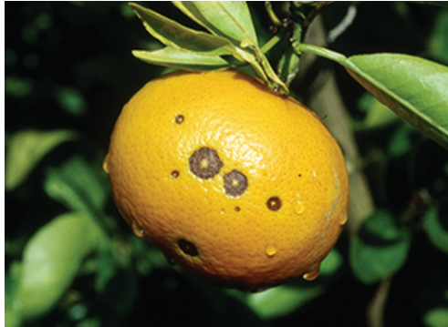
Figure 6. Typical symptoms of Alternaria brown spot on 'Fortune' mandarin.

areas and semi-arid regions provided a susceptible citrus variety is present. Fruits can get infected in all development stages but are more susceptible during the first four months following petal fall. Spring infections on young fruits may lead to premature fruit drop. Early fruit drop is common, especially if infection has occurred shortly after petal fall. Symptoms on fruits are necrotic brown circular lesions that may vary in size ( Figures 6 and 7 ). Mature