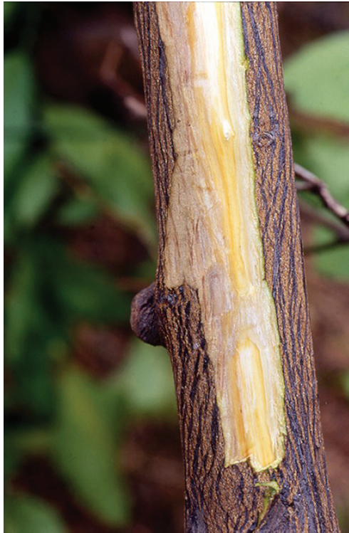
Figure 2. Pink-salmon discoloration of the wood associated to mal secco disease.