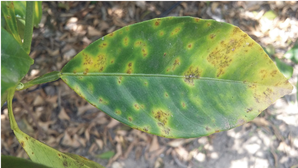
Figure 9. Symptoms of foliar greasy spot on the upper leaf surface of sweet orange.

During the last years, an epidemic outbreak of a foliar disease closely resembling greasy spot has been observed in some citrus-growing areas of western Sicily (Italy). Symptoms appear on mature leaves and range from those typical of greasy spot ( Figures 9 and 10 ) to black dots. Premature leaf drop occurs and causes heavy defoliation of the tree.