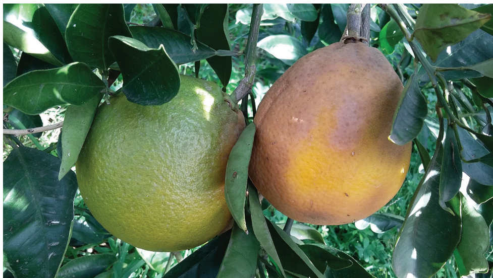
Figure 14. Sweet orange fruit with symptoms of brown rot caused by Phytophthora citrophthora.

gummosis. Other species found occasionally include Phytophthora citricola , Phytophthora cactorum , Phytophthora hibernalis and Phytophthora syringae . The last two species are found during winter months solely because of their low-temperature requirements.