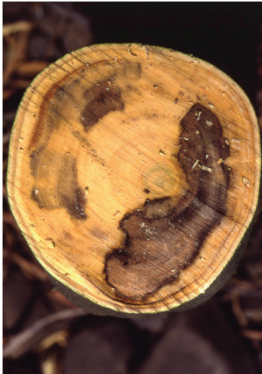
Figure 4. The ‘mal nero’ facies of mal secco disease.