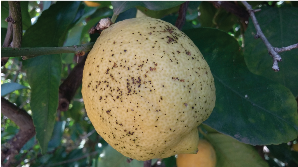
Figure 8. Typical symptoms of Septoria spot on a lemon fruit.

cool, frosty or cold windy weather. The susceptibility of fruits is related to the maturity of the rind at the time of infection. Management practices to prevent or reduce the disease incidence and severity include tree skirting and canopy pruning to improve air circulation, early fruit harvesting and the removal of withered twigs from the tree canopy and fallen leaves from the soil under the tree canopy to reduce the amount of inoculum. Copper sprays in late fall or early winter to control fruit brown rot caused by Phytophthora citrophthora are also effective against Septoria spot.