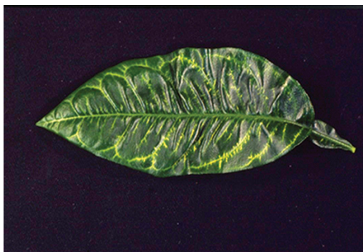
Figure 3. Clearing and chlorosis of a sour orange leaf affected by Plenodomus tracheiphilus.