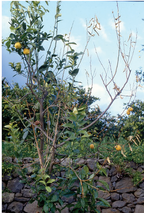
Figure 1. Wilting, leaf shedding and defoliation on a young lemon tree affected by mal secco.

The mal secco, an Italian name meaning “dry disease”, is a vascular wilt disease ( Figure 1 ) caused by the mitosporic fungus Plenodomus tracheiphilus ( P. tracheiphilus ), formerly Phoma tracheiphila . Symptoms include strands of salmon-pink to orange-red discoloration visible in stem xylem ( Figure 2 ) as well as veinal chlorosis ( Figure 3 ), wilt and shedding of leaves, dieback of twigs and branches. The disease is particularly destructive on lemon ( Citrus limon ) in Mediterranean countries and the Black Sea region. So far, however, it has not been reported in Spain, Portugal and Morocco, as well as other major citrus-growing regions of the world, even though there is no obvious climatic or cultural factor limiting its establishment in uninfested areas.