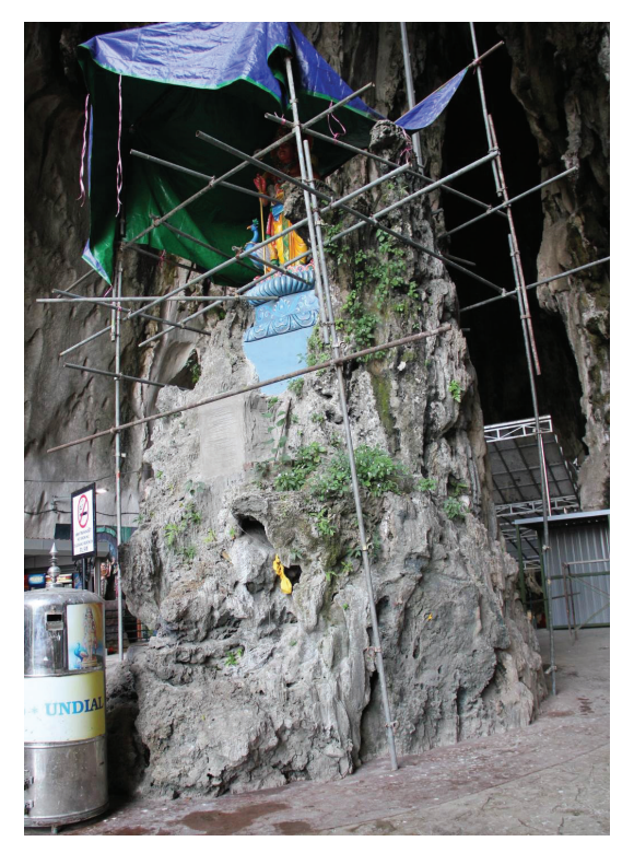
Figure 6. The type locality of Impatiens ridleyi (Balsaminaceae) in danger.