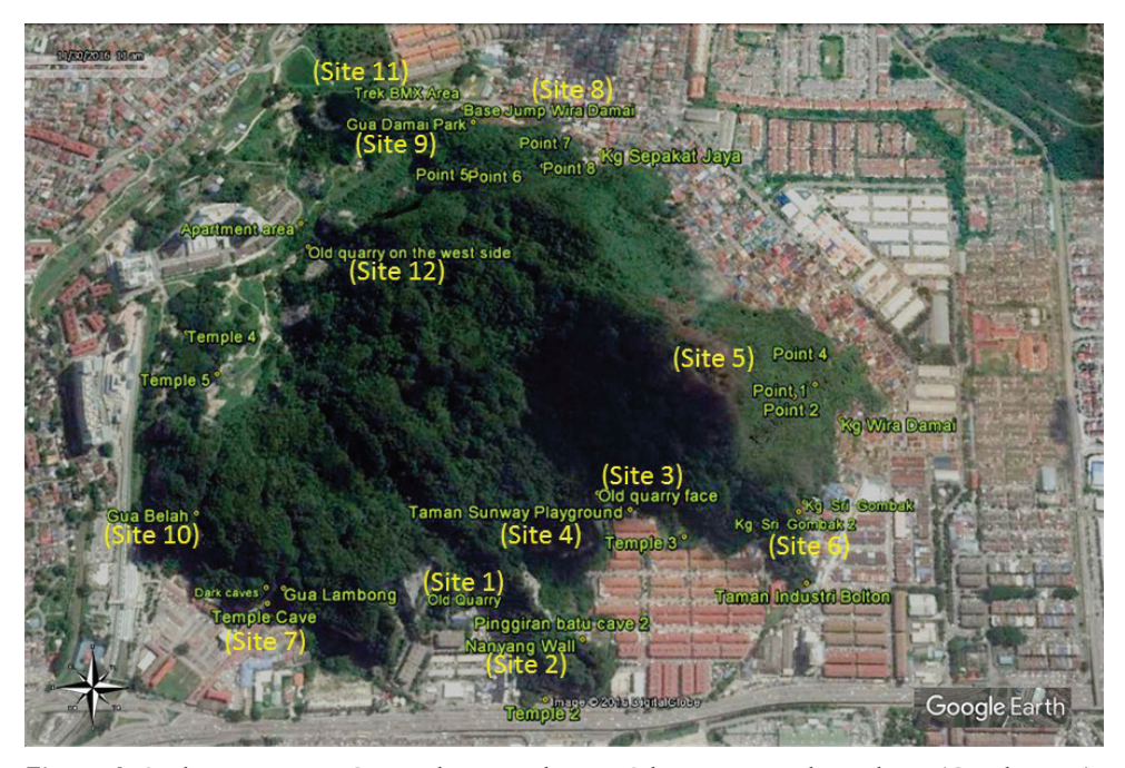
Figure 1. Study sites on Batu Caves, a limestone karst in Selangor, Peninsular Malaysia.

to Kuala Lumpur, over the following 120 years, it has been studied by many scientists with different specialities, making Batu Caves the best studied limestone karst in Malaysia and SE Asia (Kiew 2014; Kiew et al. in press). Batu Caves is home to at least 366 plant species (6 lycophytes, 40 ferns, 2 gymnosperms and 318 flowering plant species) representing 30% of Peninsular Malaysia's limestone flora (Kiew et al. in press).