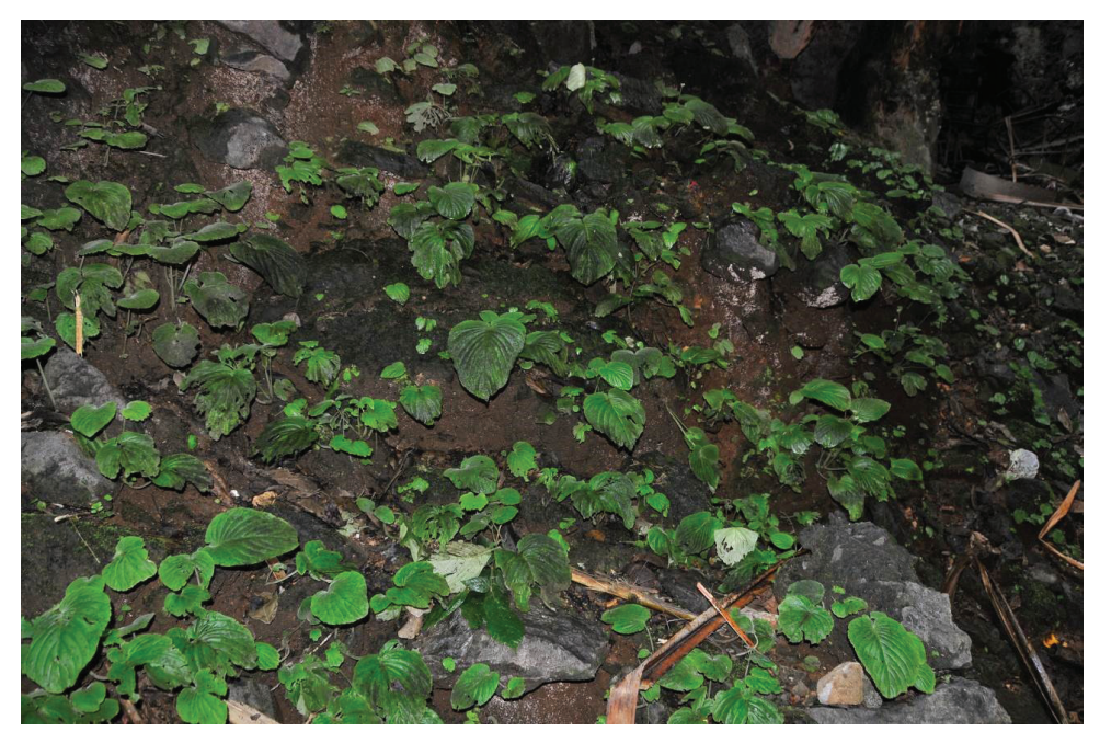
Figure 5. Epithema parvibracteatum (Gesneriaceae), endemic to Batu Caves.