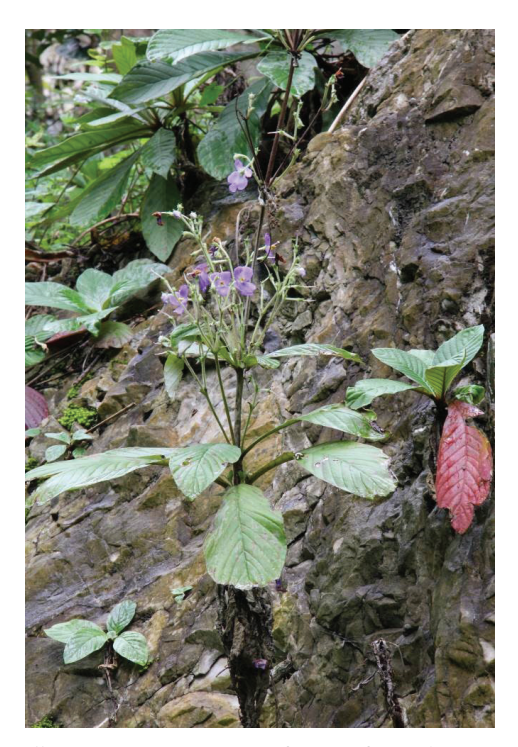
Figure 7. Paraboea verticillata (Gesneriaceae), one of a very few indigenous species that can colonise quarried rock faces.

few species have managed to survive. Sites with a CIS of more than 180 include microhabitats that still retain their diversity and species of conservation importance. However, the deleterious effect of disturbance can be seen by comparing Site 7 (CIS 329) and Site 10 (CIS 723) that are both cave sites with similar microhabitats. Site 7, that houses the Temple Cave, has been heavily disturbed by infrastructure provided to accommodate many visitors compared with Site 10 Gua Belah, which, apart from clearing the limestone forest from the base and lower slopes, is still relatively undisturbed. The only biodiverse microhabitats to survive are the permanently wet vertical walls and stalagmites and the greatly degraded scree, but even so, small populations of the threatened Begonia phoeniogramma , Epithema parvibracteatum and Impatiens ridleyi are greatly reduced and constantly face extermination by new 'beautification' projects.