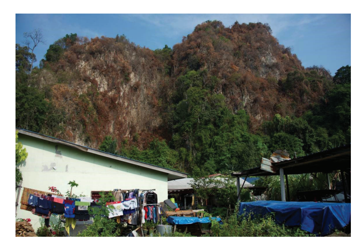
Figure 2. Aftermath of extensive accidental burning on Batu Caves.