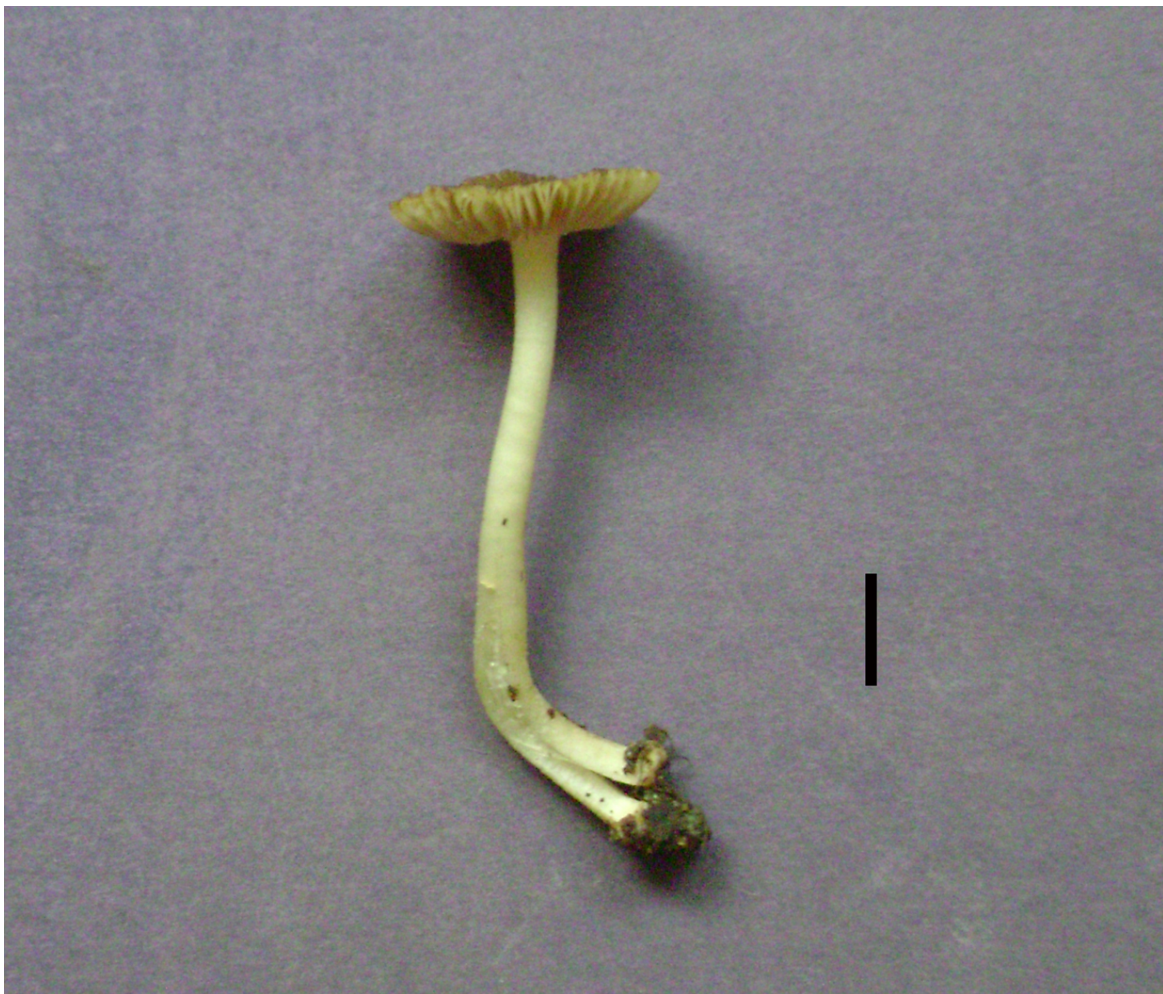
Fig. 1 – Inocybe cavalcantiae (JPB, holotype). Basidiome. Scale Bar = 10 mm.

Pileus ca 22 mm, plane, plane-subconcave shallowly umbonate with a shallow papilla; surface brownish (paler than “Snuff brown 17”) to dark yellowish brown around papilla (darker than “Buff 17”); surface radially fibrillose-rimose, mostly near margin; margin with a more or less plicate/srimose appearance; context thin, up to 2 mm at center, translucent, flesh beige, unchanging. Lamellae adnexed, close, buff (slightly darker than “Buff 52”, but paler than “Snuff brown 17”), 3.5 mm broad, lamella edge entire, concolorous, with lamellulae of diverse lengths. Stipe ca 35 \times 4 mm (without bulb), central, subequal, slightly tapering upward; surface pale cream (4D), distinctly pruinose throughout; base marginate bulbous, 7 mm wide 6 mm high; context fibrous, dull white. Odour and taste not performed.