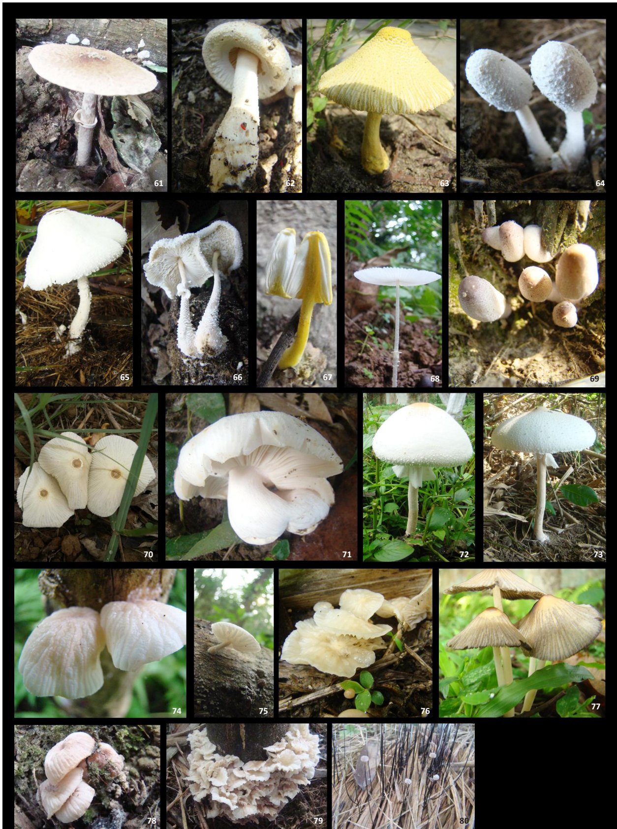
Image 61–80. Gilled mushrooms of Hollongapar Gibbon WS. Names of species are given in the Table 1 according to the serial numbers 61–80