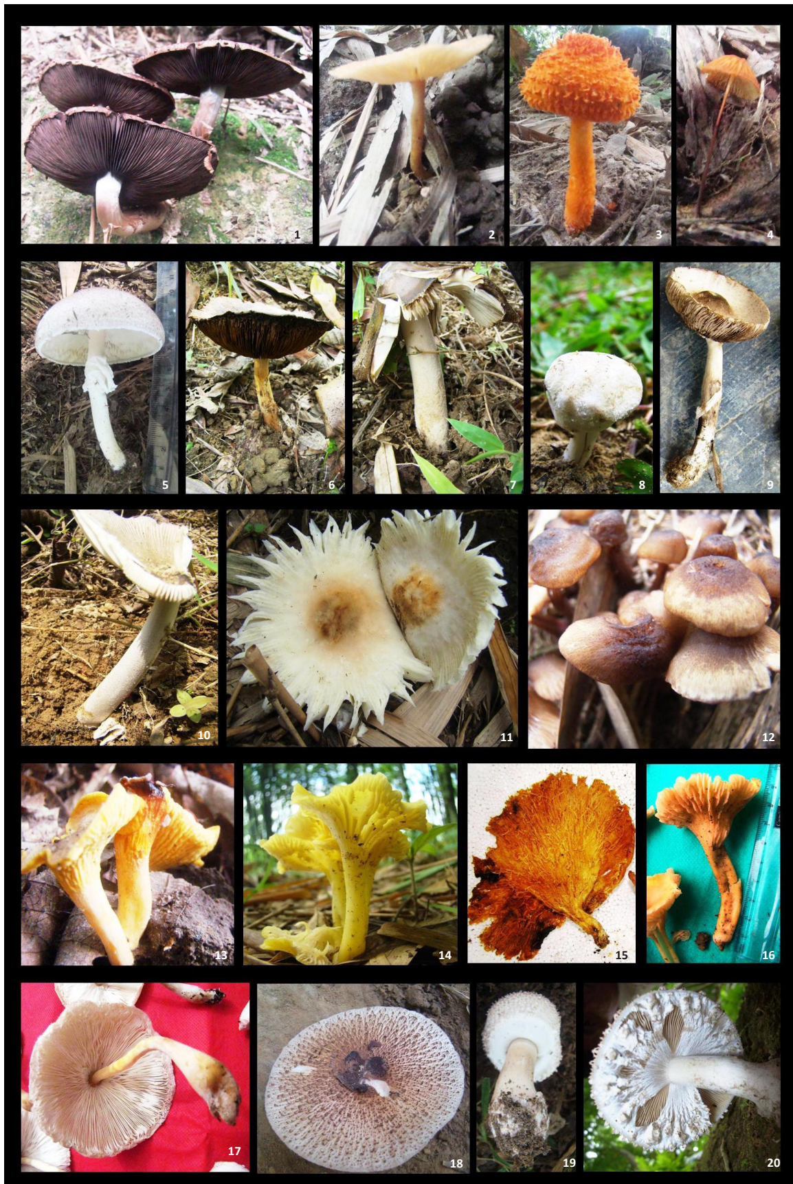
Image 1-20. Gilled mushrooms of Hollongapar Gibbon WS. Names of species are given in the Table 1 according to the serial numbers 1-20