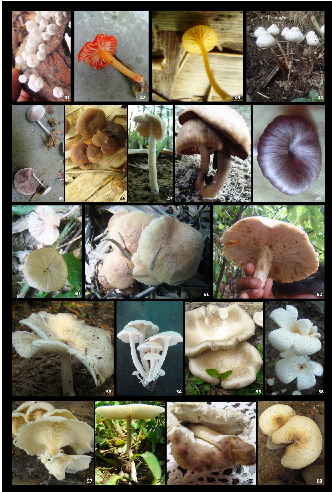
Image 41–60. Gilled mushrooms of Hollongapar Gibbon WS. Names of species are given in the Table 1 according to the serial numbers 41–60