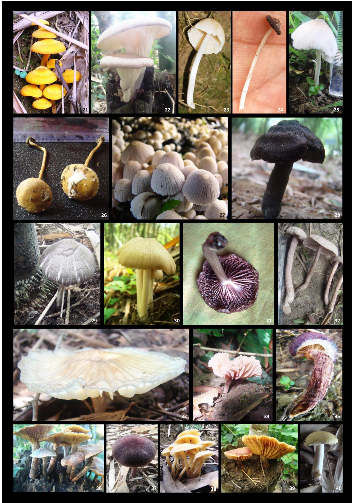
Image 21-40. Gilled mushrooms of Hollongapar Gibbon WS. Names of species are given in the Table 1 according to the serial numbers 21-40