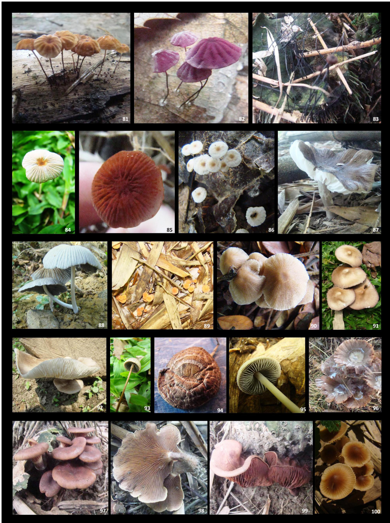
Image 81–100. Gilled mushrooms of Hollongapar Gibbon WS. Names of species are given in the Table 1 according to the serial numbers 81–100