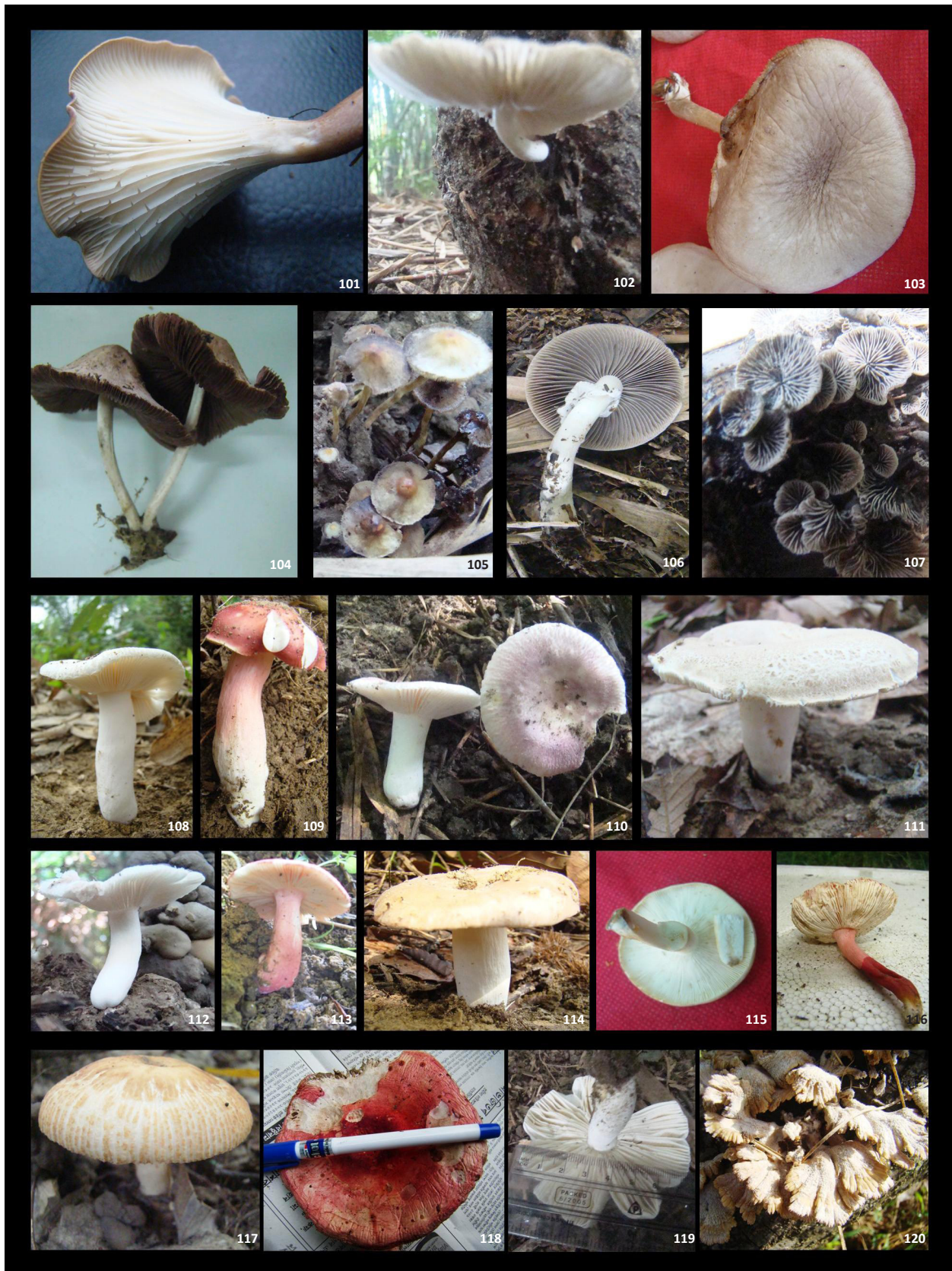
Image 101–120. Gilled mushrooms of Hollongapar Gibbon WS. Names of species are given in the Table 1 according to the serial numbers 101–120