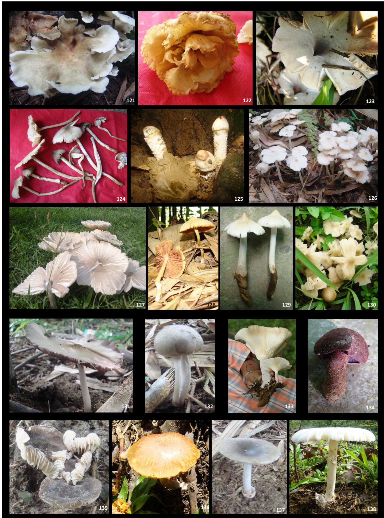
Image 121–138. Gilled mushrooms of Hollongapar Gibbon WS. Names of species are given in the Table 1 according to the serial numbers 121–138