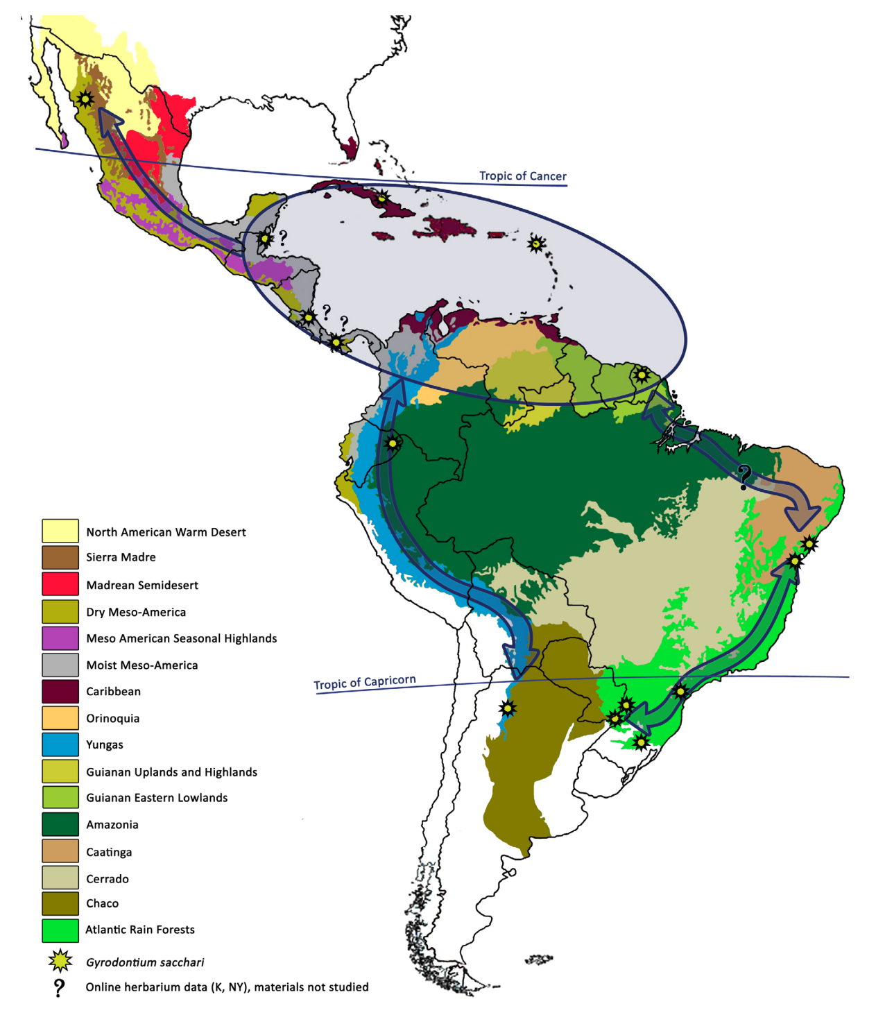
FIGURE 4. Distribution map of Gyrodontium sacchari based on records from Table 1. Main Eco-regions of America are shown. Shaded area indicates the main distribution in Central America. Arrows indicate potential distribution routes, see discussion in the text.