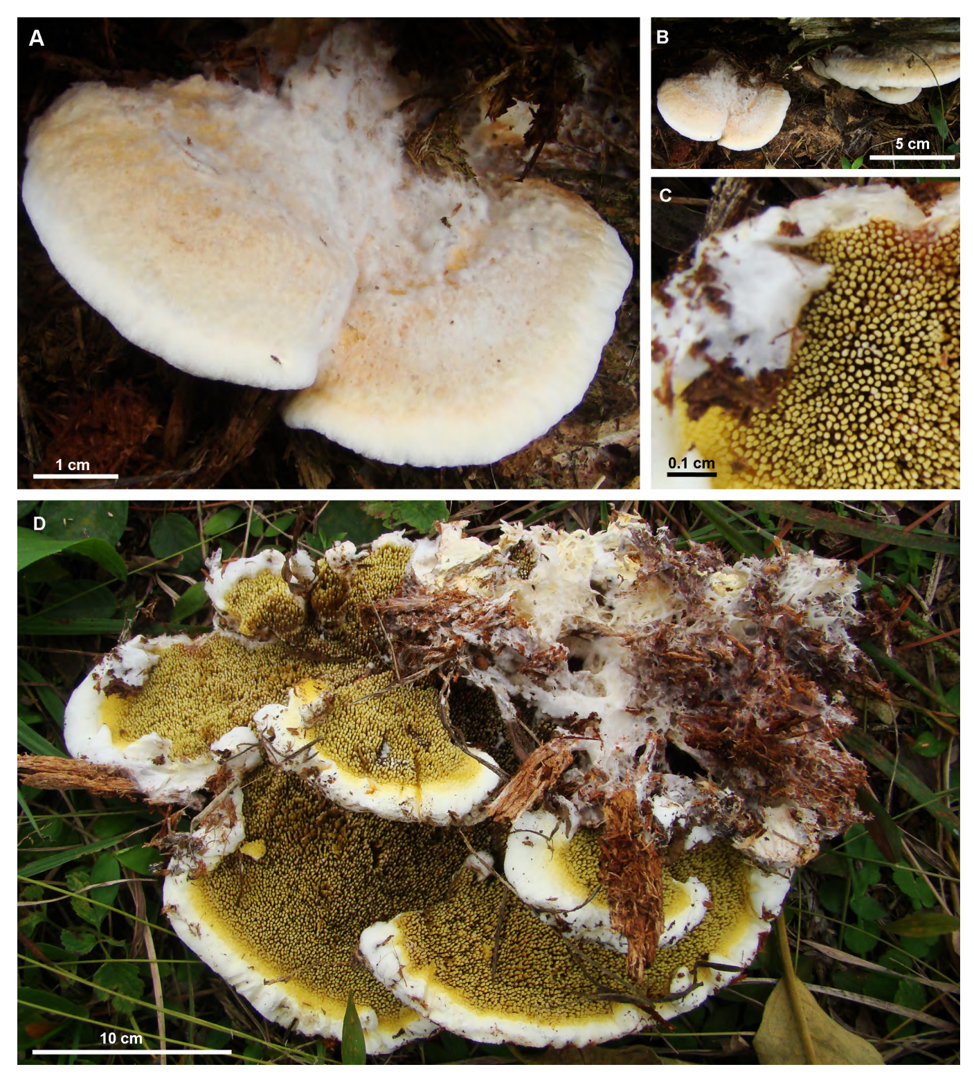
FIGURE 1. A–D. Macroscopical features of Gyrodontium sacchari (EM Giorgio 20 CORD). A) Detail of the pilear surface. B) General view in situ . C) Detail of the hymenial surface. D) General view of hymenial surface.

connecting with the central distribution area, either along the coast or through the islands and remnants of Atlantic forest occurring in the Caatinga (blue arrow with "?" in Figure 4), but records are needed to confirm this hypothesis. The new record in the Argentine Yungas is not surprising considering the presence of the species in Ecuador. Yungas forests are characterized by the presence of particular floristic elements of different origins and constitute an Andean corridor for several fungal species [see Robledo and Rajchenberg (2007) for a discussion]. Gyrodontium sacchari could follow this corridor, as previously shown for other species (Robledo et