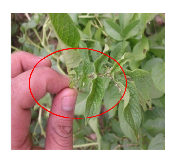
Aphid (Macrosiphum euphorbiae Thomas)