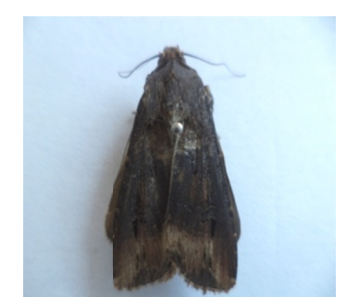
Black Cutworm (Agrotis ipsilon Hufnagel)