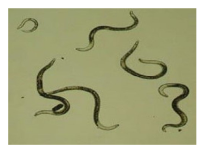
Root lesion nematode (Pratylenchus spp.)