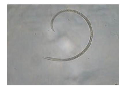
Dagger nematode (Xiphinema spp.)