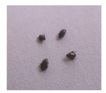
Flea beetle (Chaetocnema spp. Stephans)