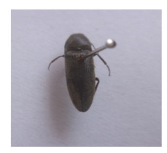
Wireworm (Melanotus horticornis Blyth)