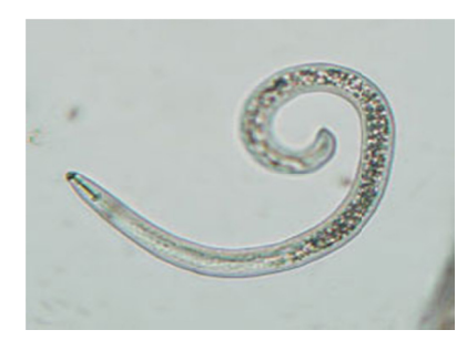
Spiral nematode (Helicotylenchus spp.)