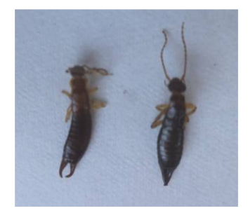
Earwig (Euborellia annulipes Lucas)