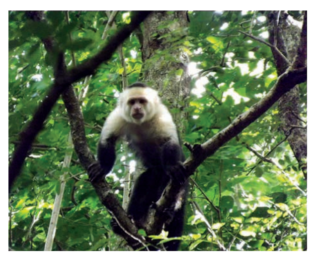
Figure 2. Photograph of an adult male (AM) in the transect El Ojochal.

The presence of the capuchin monkey ( Cebus imitator ) was registered in the Pacific slope of Honduras through several encounters in three of the four transects used within the study area (El Ojochal, El Tamarindo and Los Mogotes). During these encounters, pictures and videos of different individuals were taken for identification purposes, as well as to provide evidence for the presence of the species in the zone (Fig. 2).