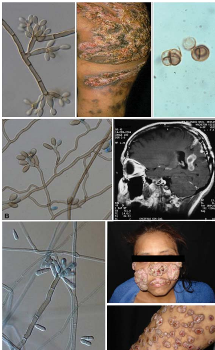
Figure 3. Chaetothyrialean agents of deep infections. Upper row: Fonsecaea pedrosoi causing chromoblastomycosis with muriform cells; middle row: Ramichloridium mackenziei , agent of cerebral phaeomycosis (case shown caused by Cladophialophora bantiana ); bottom row: disseminated infection caused by Veronea botryosa .

grow very slowly with olivaceous black colonies and produce thin-walled, sickle-shaped conidia with one or several transverse septa. Conidia are produced in packages from phialide openings on spherical conidiogenous cells or directly from hyphae.