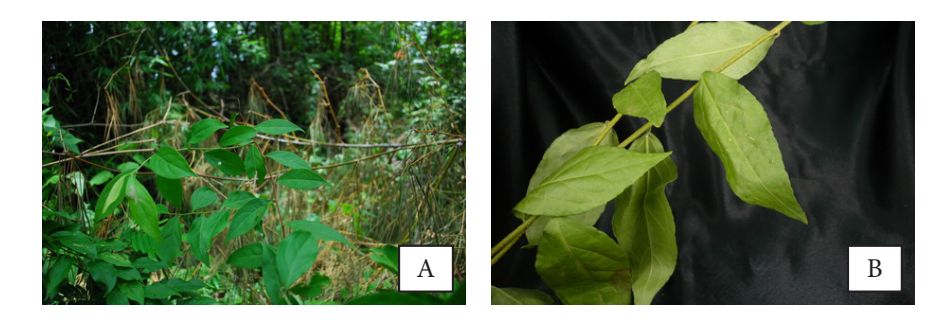
Figure 5. Celastrus sp. stem (A) and leaves (B).