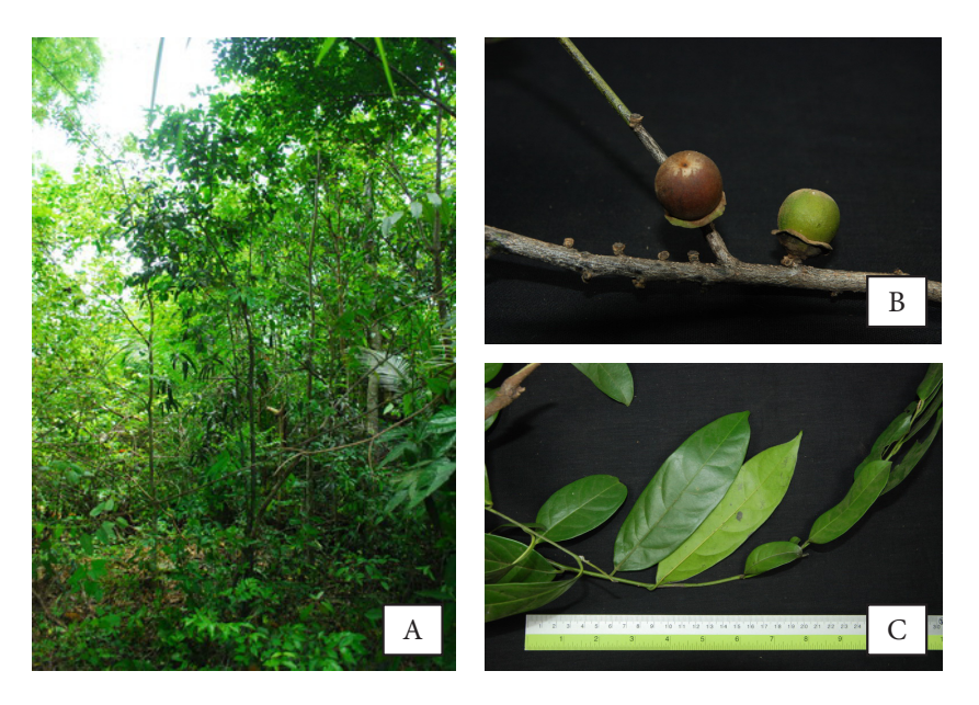
Figure 4. Diospyros undulata whole plant (A), fruits (B), and leaves (C).