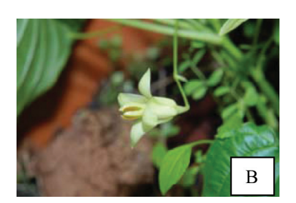
Figure 2. Stemona collinsiae whole plant (A) and flower (B).