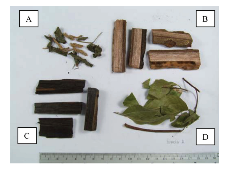
Figure 1. Crude drugs of the selected formula: non tai yak (A), krajai (B), phaya fai (C), and mak teak (D).

component herb were extracted by boiling with water for 15 minutes. After filtering, the filtrates were then dried by lyophilization. The dried extracts were examined to determine antiproliferative activity and phytochemical components.