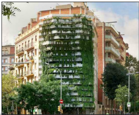
Capella Garcia Green Wall, Barcelona

In the most densely populated county in Florida, walls and roofs could provide practical spaces to bring back the plants and animals that roads and buildings have displaced. These green roofs and walls would have enormous ecological, economic, and aesthetic benefits. Environmental educator Claudia Lewis will showcase examples of green roofs and walls from cities around the world. Consider planting green roofs and walls for insulation, shade, reduced noise, wildlife habitat, and creating an original and beautiful look in our “built” environment.