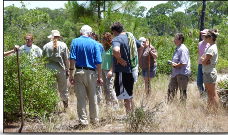
Volunteers gather at Boyd Hill Nature Preserve for the 2015 replanting effort of Nuttall’s Rayless Goldenrod, Bigelovia nuttallii .

The Florida Native Plant Society also awarded a grant for the Sand Scrub Conservation Project to “evaluate the current health and diversity of the Scrub Habitat through a species inventory, analysis of the inventory, and recommendations for future management to preserve this imperiled plant community” ( FNPS Conservation Grants ).