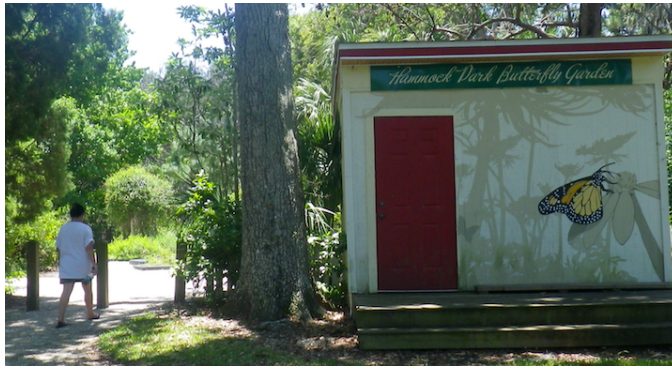
The Butterfly Garden at The Hammock is well-cared for and worth a visit. Here, Theresa Polgar arrives for weekend maintenance.

Also in Dunedin, two-acre Curlew Creek Park is on the south side of Curlew in the middle of housing and condominium developments. This site has towering oaks covered with ferns and air plants, a stately longleaf pine, coral bean, St. Andrew's Cross, spice bush, and wetlands along a creek with a small spring. This site is worth a 30-minute walk to experience a remnant sandy upland and running stream.