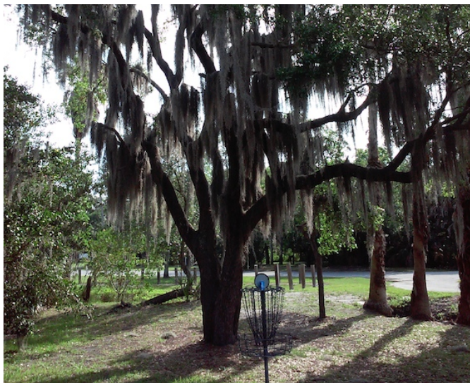
The Hammock is an urban nature-park with disc golf, trails, and boardwalks in addition to natural habitat. Photo by E. Raabe