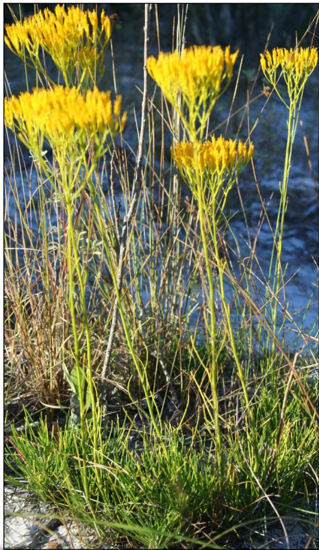
Critically Imperiled in Florida, Nuttall's Rayless Goldenrod, Bigelovia nuttallii , grows naturally at Boyd Hill Nature Preserve

It's an odd little plant. For much of the year it appears no more than a wispy tuft of green threads a few inches in size, with older plants spreading into fairy rings. Mushrooms aren't the only ones that form rosettes or clonal colonies called genets; bacteria, corals, and plants form them too. Genets are genetically identical individuals called ramets that originate vegetatively, not sexually. Several other Florida natives form genets: Sweetgum, Pawpaw, Blueberry, and Sumac species are a few examples.