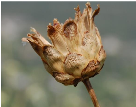
Figure 2. Centaurea ruthenica Lam. – involucre, 27.07.2021