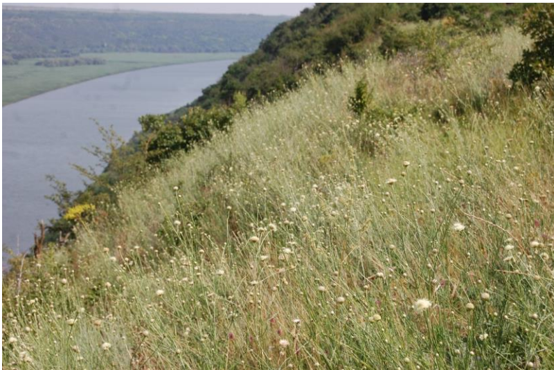
Figure 5. The habitat of Centaurea ruthenica Lam. in the upper part of the cliff

The upper layer, 80-120 (145) cm high, consists of: Agropyron cristatum (L.) Gaertn., Artemisia campestris L., Asparagus officinalis L., Asparagus verticillatus L., Bromus inermis Leys., Bupleurum falcatum L., Campanula rapunculoides L., Centaurea orientalis L., Centaurea ruthenica Lam., Elymus repens (L.) Nevski, Erysimum cuspidatum (M. Bieb.) DC., Hieracium virosum Pall., Isatis tinctoria L., Jurinea ledebourii Bunge, Melica transsilvanica Schur, Melilotus officinalis (L.) Pall., Scabiosa ochroleuca L., Serratula radiata (Waldst. & Kit.) M. Bieb., Sisymbrium loeselii L., Stipa capillata L., Tanacetum corymbosum (L.) Sch.