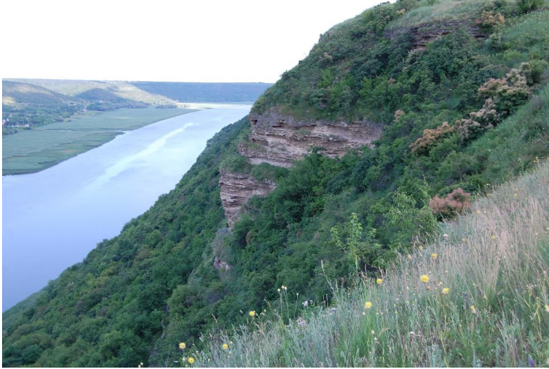
Figure 4. Centaurea ruthenica Lam. growing on a slope of the Dniester valley, village of Țipova, Rezina district, 27.06.2021