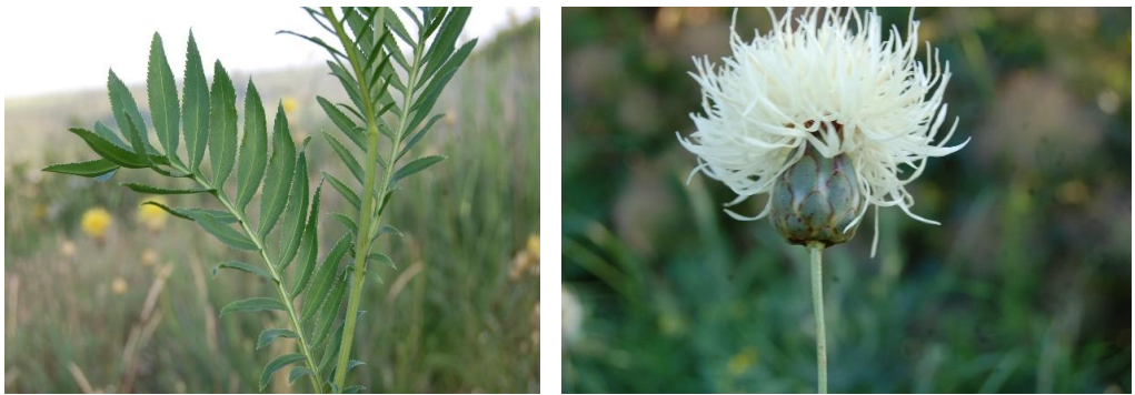
Figure 1. Centaurea ruthenica Lam., village of Țipova, Rezina district, 27.06.2021