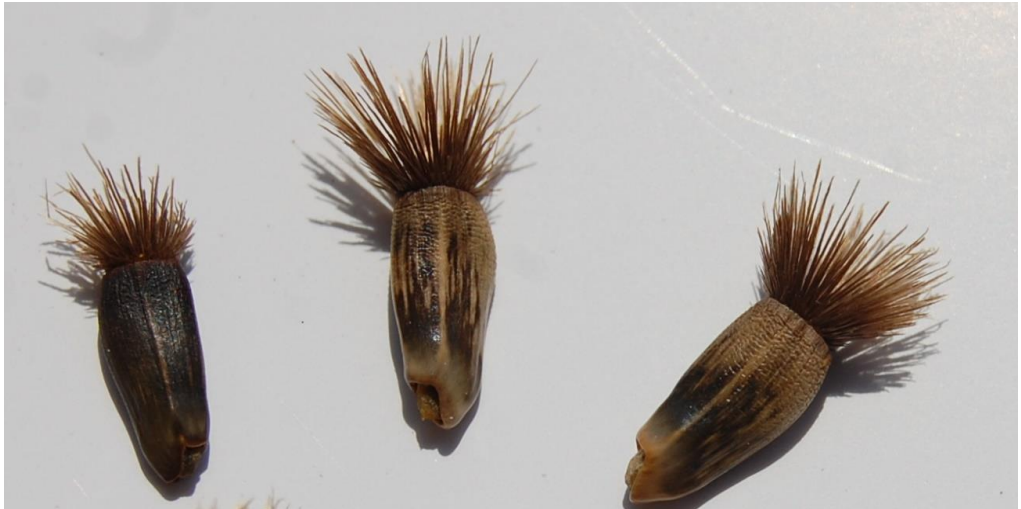
Figure 3. Achenes of Centaurea ruthenica Lam., 27.07.2021