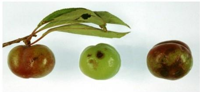
leaf spots on cherry fruit.

On stems, cankers can form in spring, usually on the tips of overwintering twigs. These may enlarge, causing dieback. In summer, other cankers may develop as dark water-soaked lesions around infected lenticels. As these cankers increase in size, they may become darker and sunken. Cankers on plum and apricot twigs are perennial and continue developing in 2- to 3-year-old twigs. The infection will penetrate the inner bark, resulting in deep-seated cankers which girdle the stems and cause dieback.