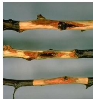
Peeling back the bark may reveal a red discoloration below these cankers.