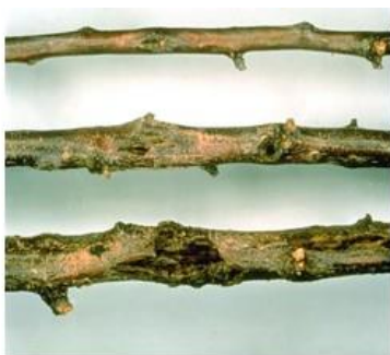
Canker on plum twigs.

On stems, cankers can form in spring, usually on the tips of overwintering twigs. These may enlarge, causing dieback. In summer, other cankers may develop as dark water-soaked lesions around infected lenticels. As these cankers increase in size, they may become darker and sunken. Cankers on plum and apricot twigs are perennial and continue developing in 2- to 3-year-old twigs. The infection will penetrate the inner bark, resulting in deep-seated cankers which girdle the stems and cause dieback.