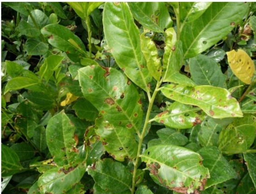
Bacterial leaf spot and shot holing symptoms on Prunus laurocerasus (cherry laurel) caused by Xanthomonas arboricola pv. pruni