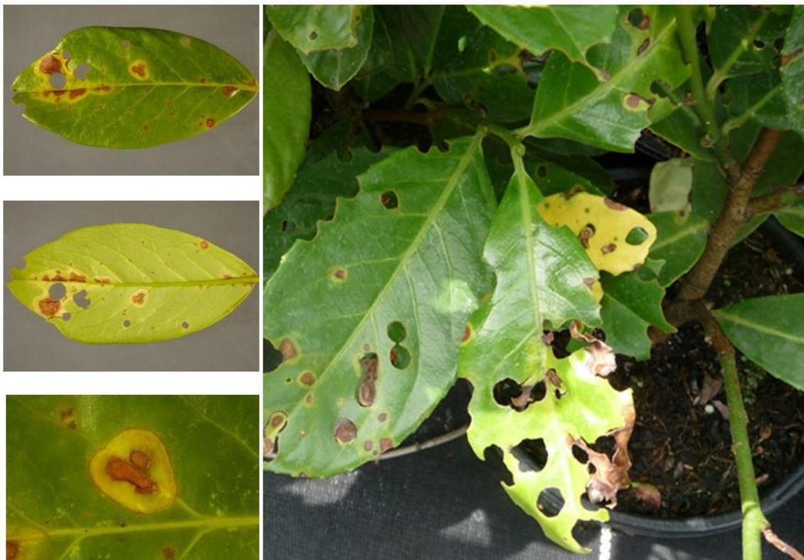
Leaf symptoms of bacterial spot and shot-holing on cherry laurel