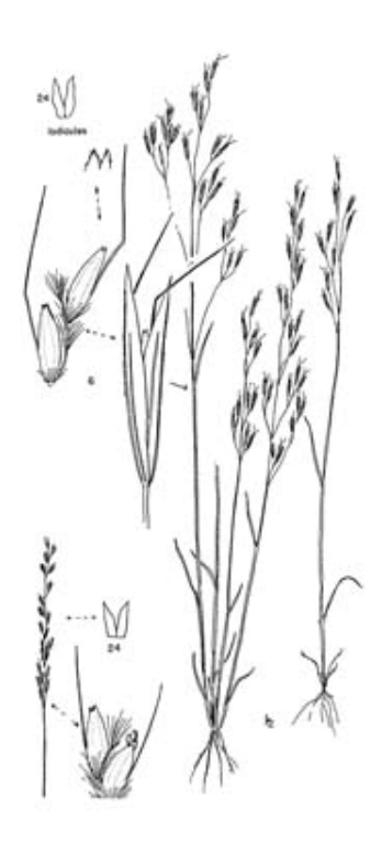
Line drawing reprinted with permission, University of Washington Press

clay soils and silt loams above a shallow, impervious layer. However, it also grows on coarse textured substrates that stay moist through seed development. Annual hairgrass apparently tolerates some salinity and prefers full sun. Fall germinants actively grow all winter, tolerating several days to several weeks of continual submergence.