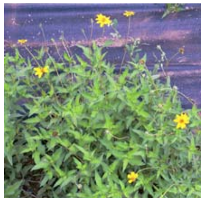
Shelly D. Maher, USDA NRCS Kika de la Garza PMC

The flower stems are terminal and solitary or occasionally in a cyme of three. The flower heads are about 3 cm across. The ray flowers are broad, conspicuous, 7-15 in number, with the corollas being yellow or orange. Both the disk and ray flowers produce achenes. The plants bloom and produce seed from March to December.