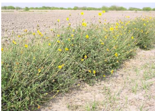
Shelly D. Maher, USDA NRCS Kika de la Garza PMC

Orange zexmenia requires little management other than occasional weeding. It can survive in both droughty and moist conditions. For seed production purposes, occasional irrigation during extremely droughty periods may help seed fertility.