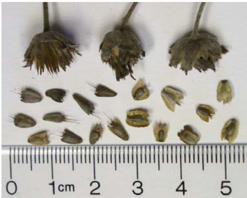
Shelly D. Maher, USDA NRCS Kika de la Garza PMC

For direct seeding, broadcast seed in the late winter or early spring into a clean, weed free seedbed. Seeds should be covered from ¼ to ½” depth to ensure good soil to seed contact. Transplants should be planted in early to mid-spring, to ensure good root establishment before the summer heat arrives.