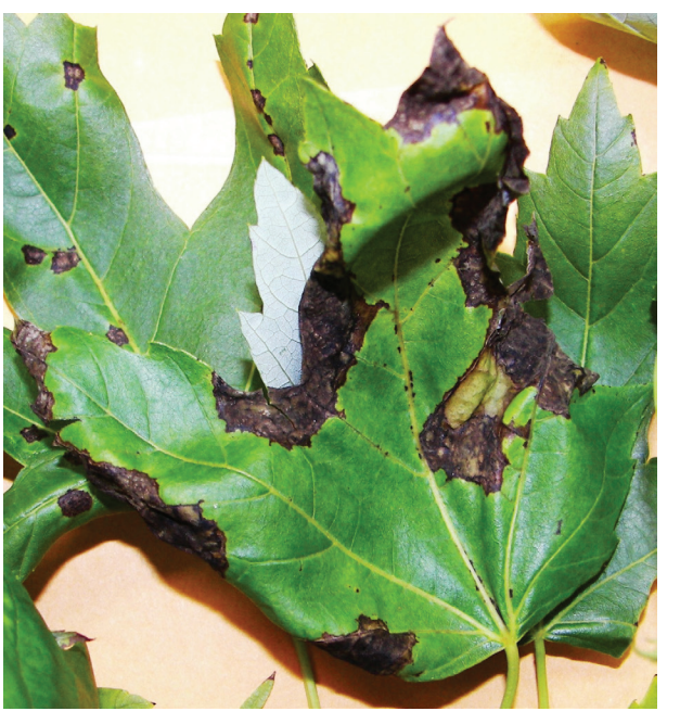
Figure 3. Silver maple leaf with dead areas on leaf caused by anthracnose disease.