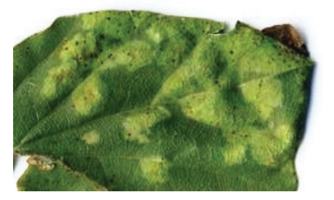
Figure 7. Leaf-blister disease on oak causes irregular raised areas on the leaves.

Figure 6. Leaf spot of redbud may result in numerous, small lesions.