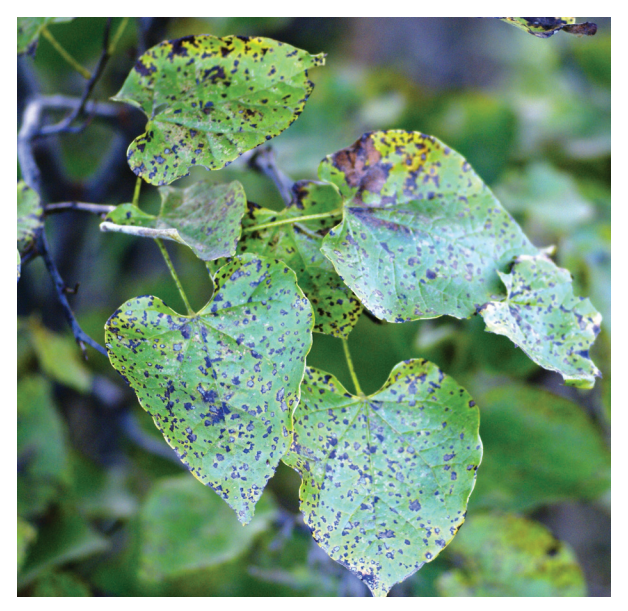
Figure 6. Leaf spot of redbud may result in numerous, small lesions.

Figure 5. Actinopelte leaf spot (also called Tubakia leaf spot) is common on pin oak trees that are planted in soils with pH greater than 7.0.