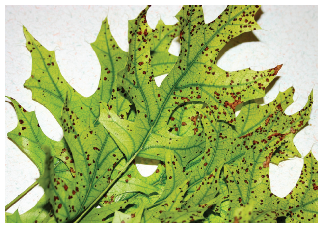
Figure 5. Actinopelte leaf spot (also called Tubakia leaf spot) is common on pin oak trees that are planted in soils with pH greater than 7.0.