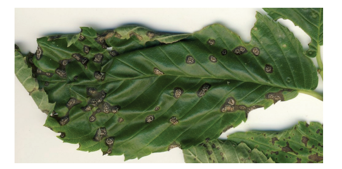
Figure 4. Black spot disease of elm.