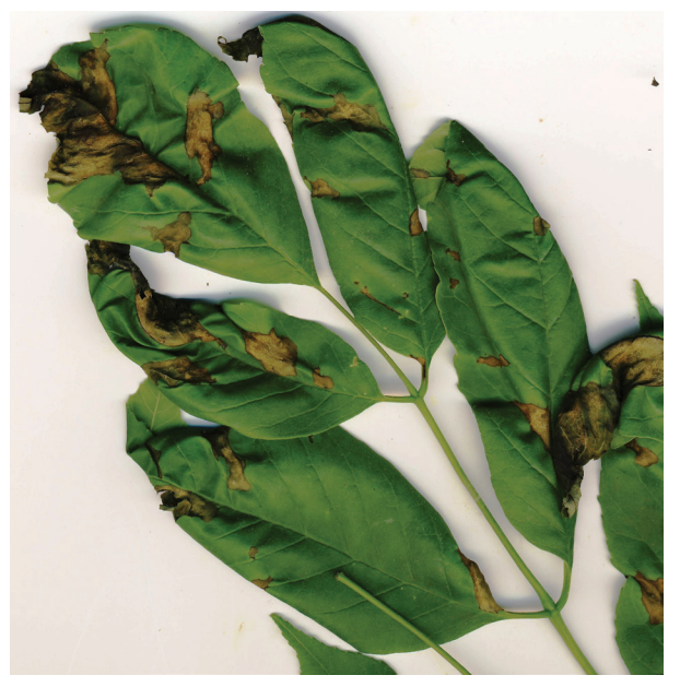
Figure 2. Anthracnose disease of ash causes irregular brown lesions that often follow veins.

Catalpa (Catalpa spp.)-Brown leaf spots are caused by three species of fungi (Alternaria catalpae, Cercospora catalpae, and Phyllosticta catalpae).