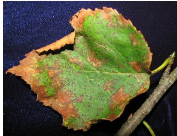
Figure 4. Septoria leaf spot of birch.