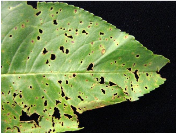
Figure 8. Bacterial ( Xanthomonas ) leaf spot of peach.