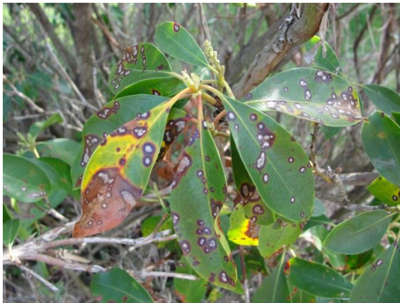
Figure 2. Cercospora leaf spot of mountain laurel.

Heavily infected leaves turn yellow and brown, shrivel, and drop prematurely. Partial to complete premature defoliation of a tree or shrub may occur under some circumstances. For example, crabapples heavily infected with scab are often defoliated by mid-July.