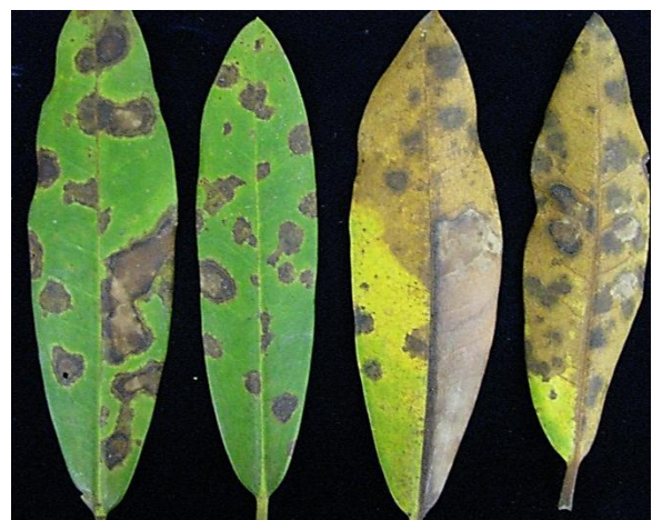
Figure 6. Cercospora leaf spot of rhododendron.