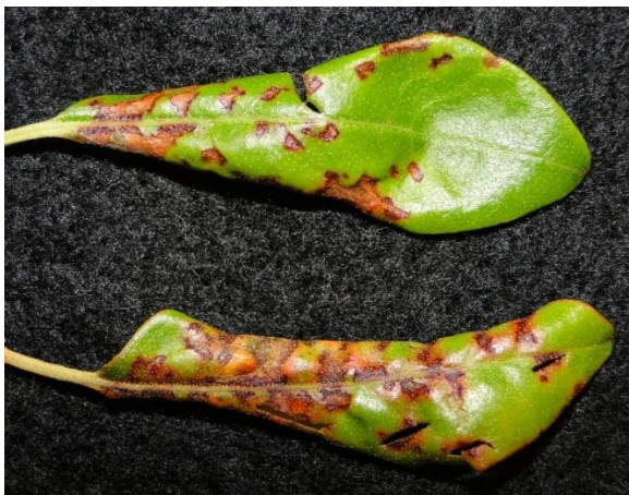
Figure 9. Bacterial leaf spot of PJM rhododendron. Note that the spots are irregular in shape.