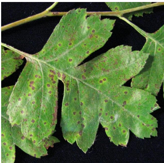
Figure 3. Entomosporium leaf spot of hawthorn.