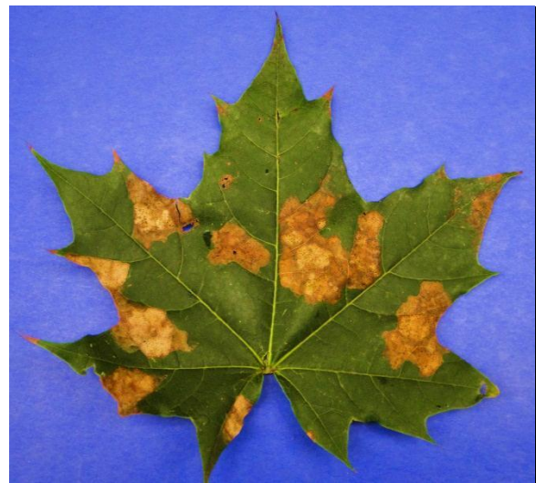
Figure 1. Didymosporina leaf spot of Norway maple.

Leaf spot symptoms vary with the plant host and the causal agent. However, typical leaf spots usually have fairly defined margins and brown, black, tan, or reddish centers (Figures 1-9). Spots vary from pin-head to several centimeters in diameter and can coalesce to encompass entire leaves. Some spots are circular and others are irregular in shape, some are raised, some spots drop out and give the leaf a shot-holed appearance (Figures 7 and 8), and some spots have distinct yellow haloes (Figure 8).