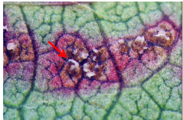
Figure 11. Oozing tendrils of spores (arrow) of Blumeriella leaf spot of cherry.