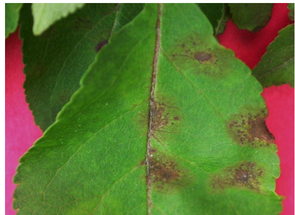
Figure 5. Scab of crabapple.