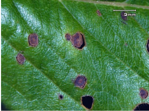
Figure 7. Shot-hole of cherry caused by the fungus Wilsonomyces .