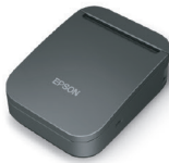
Thermal Label Printers