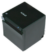
Thermal Desktop Printers