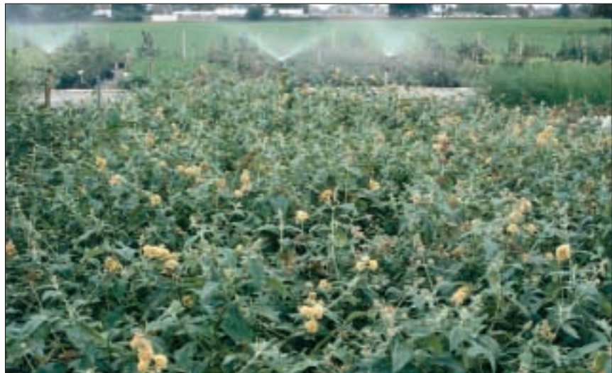
7 Susceptible crops such as buddleia are most at risk from damaging attacks of downy mildew if grown in densely-packed beds with frequent overhead irrigation