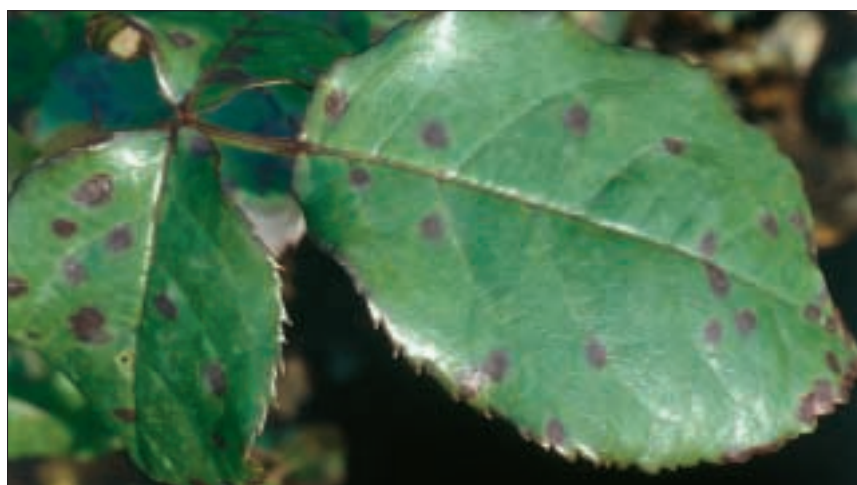
2 Rose downy mildew ( Peronospora sparsa ) results in purplish spots on the upperside of leaves that may be mistaken for black spot ( Diplocarpon rosae )

Sporulation is often sparse but a whitish-grey, downy, fungal growth is sometimes seen on the undersides of leaves. Affected leaves may become necrotic and fall prematurely. If left uncontrolled, growth of plants (both height and stem diameter) is significantly reduced and plants may fail to reach marketable grade. Young shoots can become so heavily diseased that they die back. Cuttings that are deformed by downy mildew may fail to root.