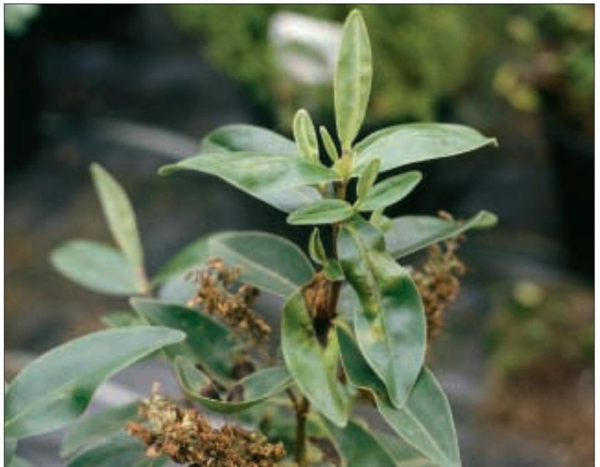
4 Hebe downy mildew ( Peronospora grisea ) is often found on young shoots where it causes leaf yellowing (top), distortion (bottom) and leaf necrosis