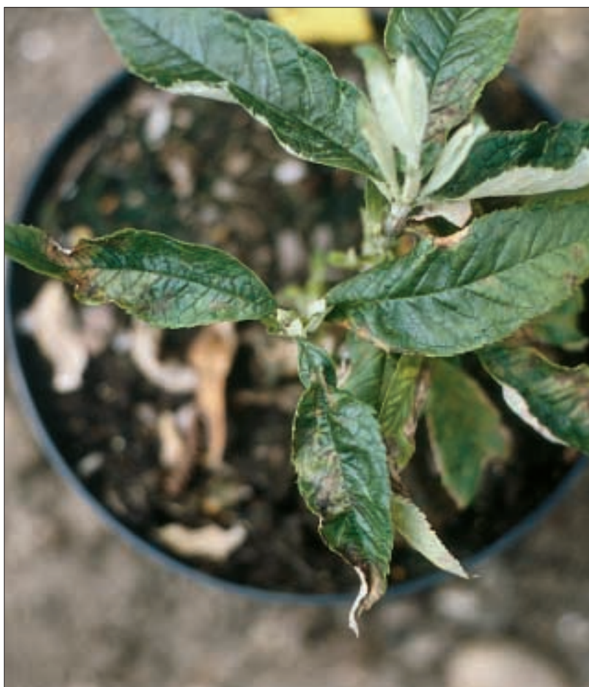
1 Buddleia downy mildew ( Peronospora hariotii ) results in angular, yellow-green spots on the upper leaf surface (left); affected areas subsequently become necrotic and the leaves distorted (right)