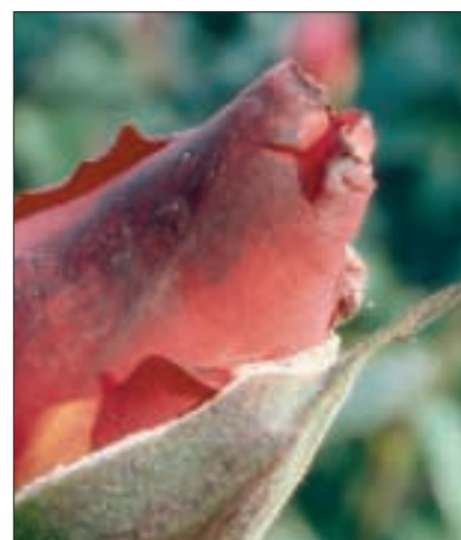
3 Peronospora sparsa may cause purplish marking on the stem, calyx and petals (above), as well as spotting on leaves