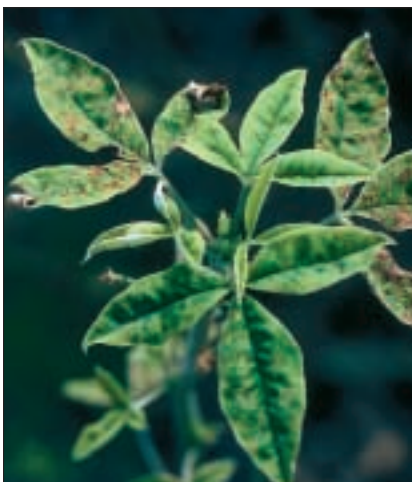
5 Laburnum downy mildew ( Peronospora cytisi ) can cause considerable leaf necrosis and distortion