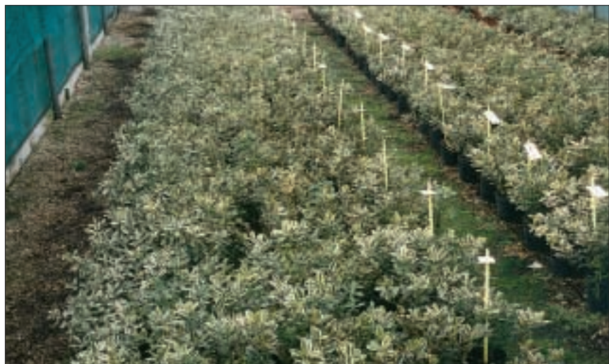
8 A trial evaluating fungicide treatments for control of hebe downy mildew on a polythene tunnel crop of x 'Franciscana Variegata'. Note that the rows of plants at the outer edge of plots (left hand side), where air movement is better, are considerably less affected than those in the centre of the tunnel

mixtures (where allowed); some example programmes are shown overleaf.