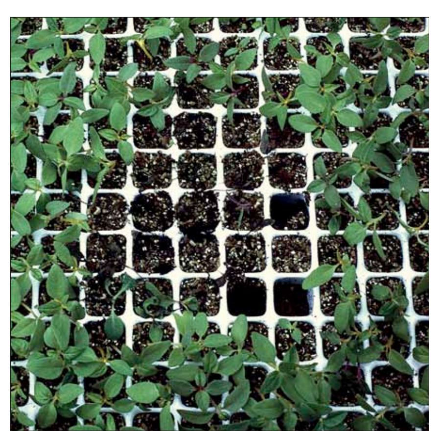
1 Botrytis stem base rot on zinnia seedlings. Botrytis cinerea was one of the fungi most commonly found on seed

Seed-borne diseases affect a wide range of ornamental crops and potentially may result in substantial and widespread crop losses, disruption to production schedules and increased use of plant protection products. The true impact of seedborne pathogens may be greater than is commonly appreciated due to the uncertain origin of many disease outbreaks and the potential for latency in specific pathogen groups. There is little information in the public domain on the prevalence of plant pathogens on seeds of ornamental species. HDC project PC 252 was undertaken to provide a comprehensive listing of seed-borne diseases of protected ornamental crops commonly grown in the UK, to determine the current prevalence of fungi and bacteria on some commercial seed lots and to investigate a range of potential treatment options.