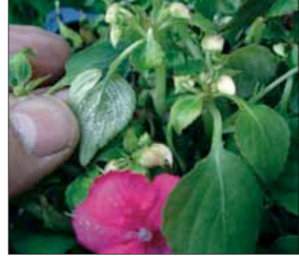
9a, 9b Downy mildew on brassica (left) and impatiens (right)