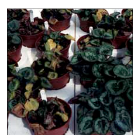
8a, 8b Fusarium wilt in stock (left) and cyclamen (right)