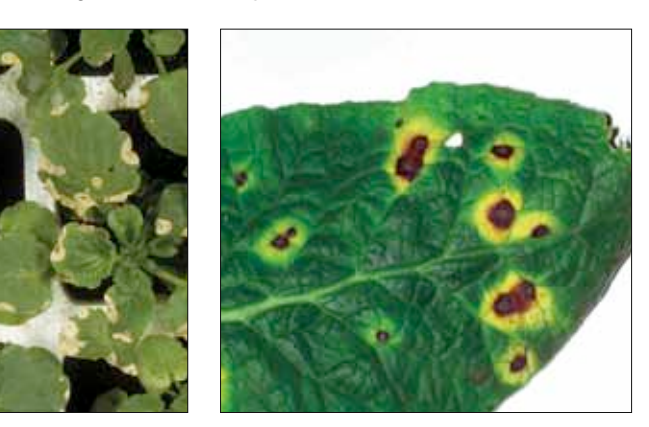
5a, 5b Ramularia leaf spots on pansy (left) and primula (right)