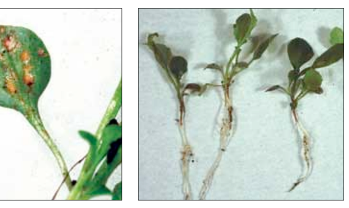
4a, 4b Leaf spot and stem browning of lobelia caused by Alternaria alternata