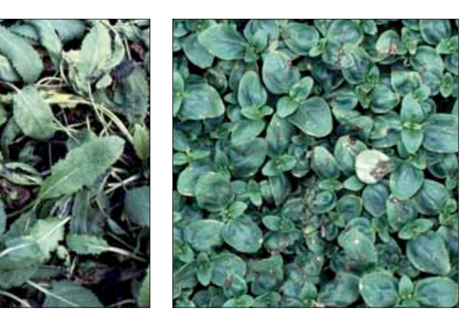
11a, 11b Bacterial leaf spots on salvia (left) and antirrhinum (right)

control of soil-borne infection by other oomycetes such as Pythium and Phytophthora spp. A wide range of fungicides are available for management of various fungal diseases in the early stages of crop growth. See the section on further information.