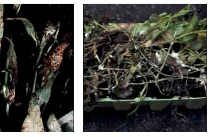
Antirrhinum rust (left) and Sclerotinia sclerotiorum on lobelia (right)

A SOLA application for the use of the fungicide Apron XL (containing metalaxyI-M) as a seed treatment for floriculture crops is being submitted by HDC. This treatment has potential to reduce seed-borne diseases caused by oomycetes, including downy mildew. It may also have benefits in the early