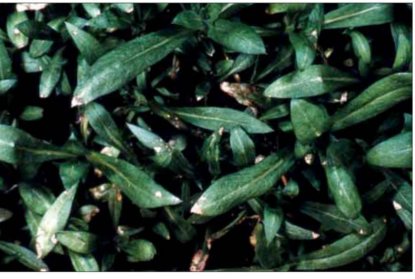
6 Septoria leaf spot on phlox