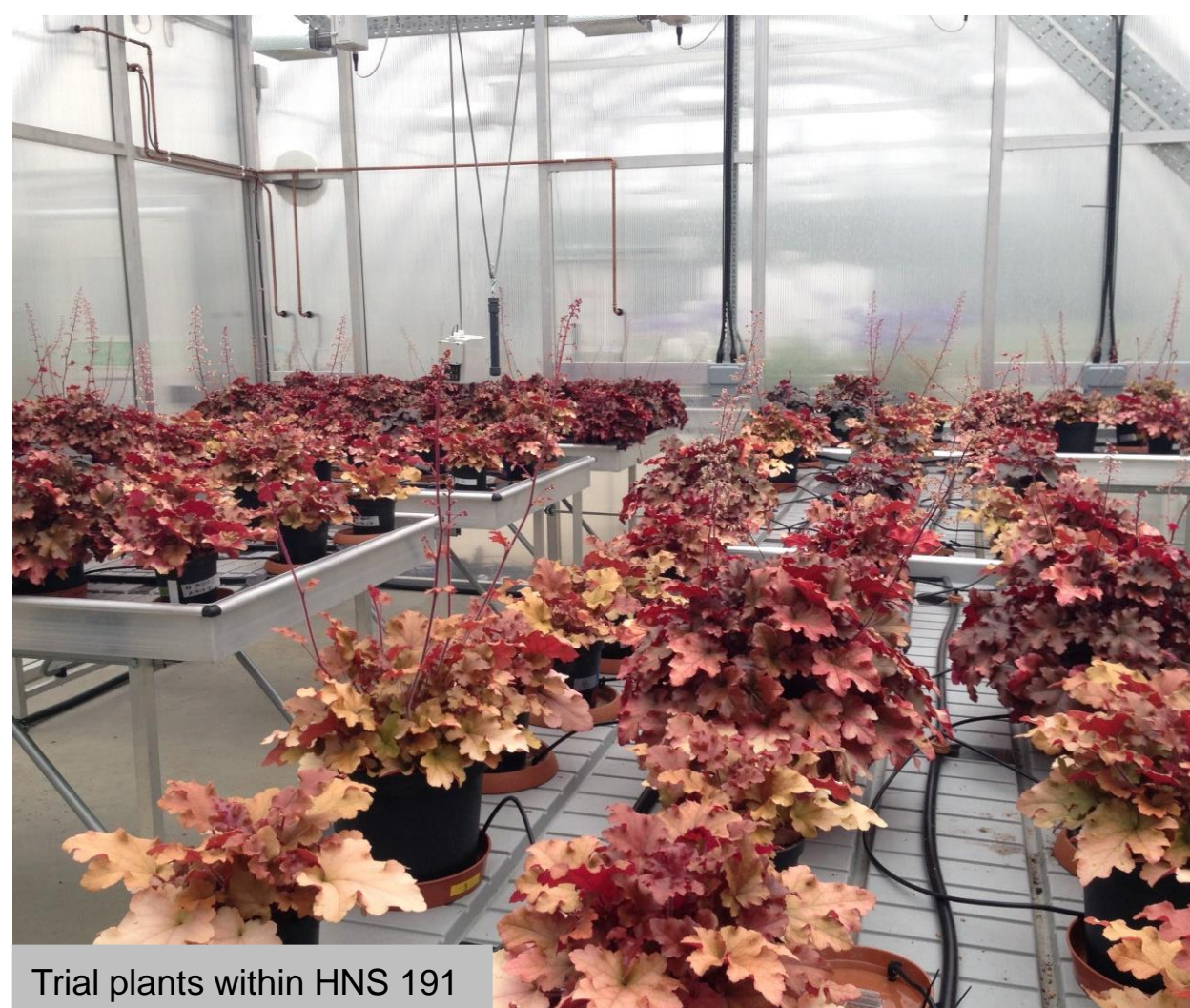
Trial plants within HNS 191