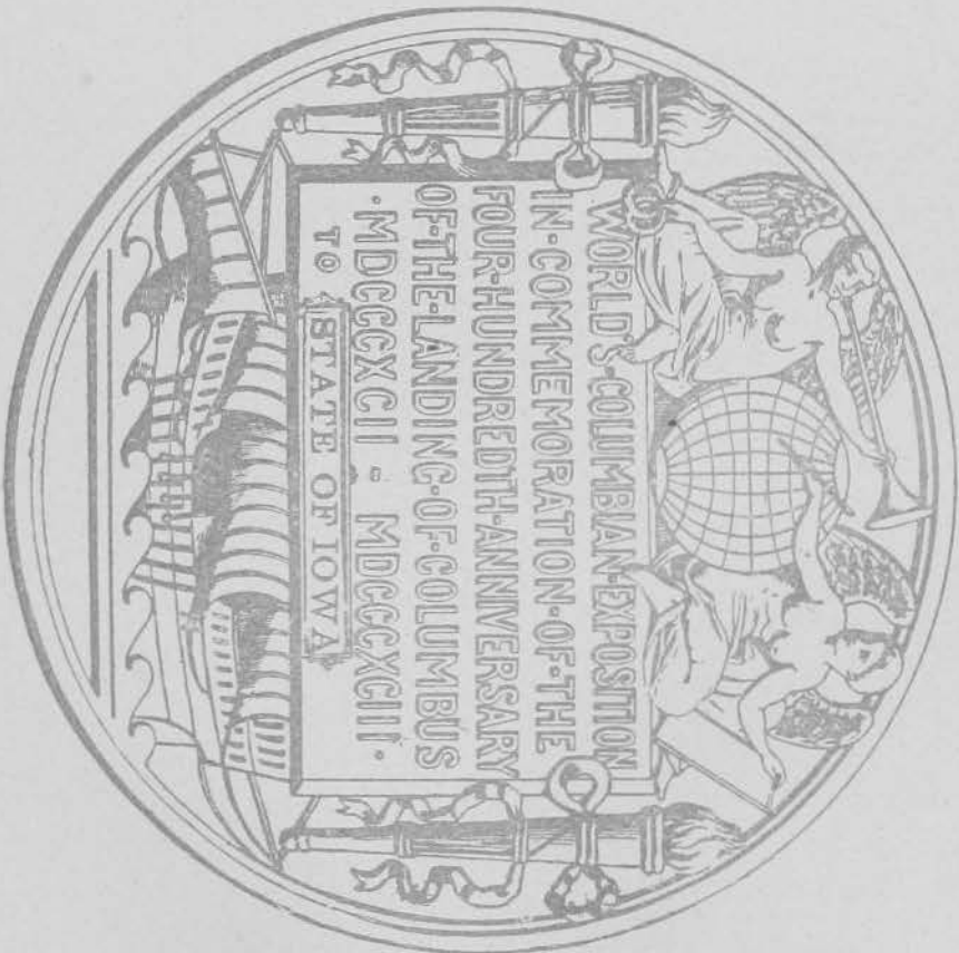
MEDALS WON BY THE STATE OF IOWA AT COLUMBIAN EXPOSITION, 1893.