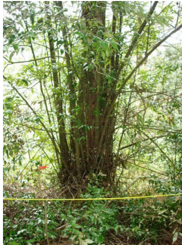
FIGURE 2. Castanopsis acuminatissima tree