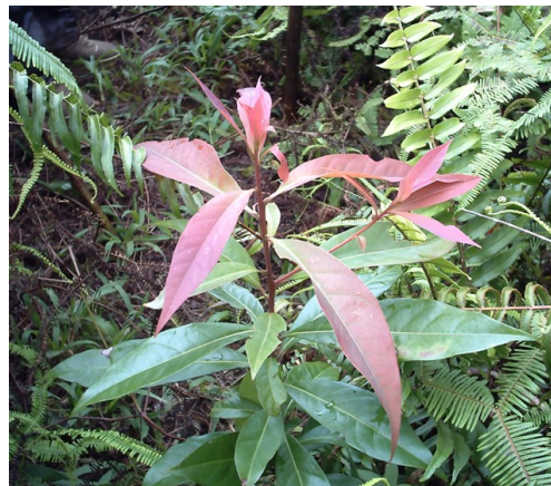
FIGURE 3. Schima wallichii seedling