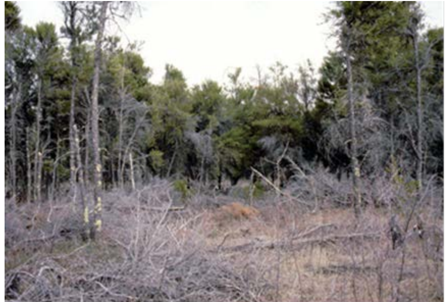
Dwarf mistletoe mortality centre

During epidemics, widespread tree mortality often has a major impact on commercial forests in terms of timber volume loss and site conversion to less desirable tree species or to grass or shrubs. In addition to the impact on commercial forestry, the destruction of millions of hectares of forest can impact the ecological balance.