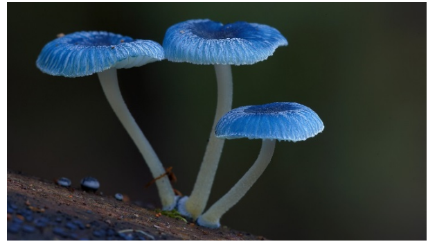
Mycena interrupta.