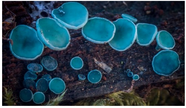
Chlorociboria aeruginascens.

Chlorociboria aeruginascens , the bluish-green elf caps, a newly discovered Leratiomyces sp. both pictured below.