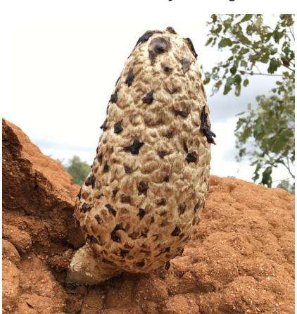
Podaxis beringamensis

disappointed, until finally as we neared Herberton, two weeks into the trip, we found a fresh specimen growing on a large rounded mound, close to the road. This fungus, which appears to be a stalked puffball, is