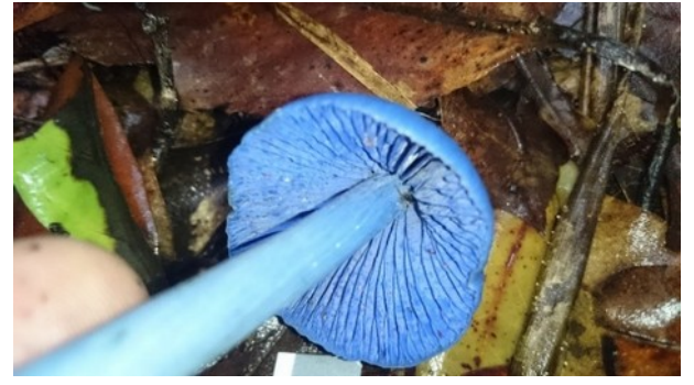
Entoloma hochstetteri. 13 March 2016, © Wayne Boatwright. Permit: TWB/01A/2015 WITK15524915 SCC Document 2016/840262

The following specimen was photographed and collected on the 13<sup>th</sup> of March, 2016. It was located on the Linda Garrett Circuit Track of Mapleton National Park.