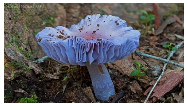
Cortinarius sp. "Lady Blue".

Chlorociboria aeruginascens , the bluish-green elf caps, a newly discovered Leratiomyces sp. both pictured below.