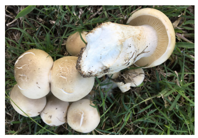
Macrocybe crassa

The last of this interesting and varied bunch of fungi was a very unexpected stinkhorn, growing in the sand just 30 metres from the seashore at Clairview in central Queensland. It was Itajahya galericulata , an unusual stinkhorn only once previously collected in Qld. The other specimen of I. galericulata came from near Cunnamulla, many hundreds of kilometres away. It stands alone