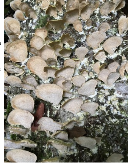
Trichaptum biforme en masse.