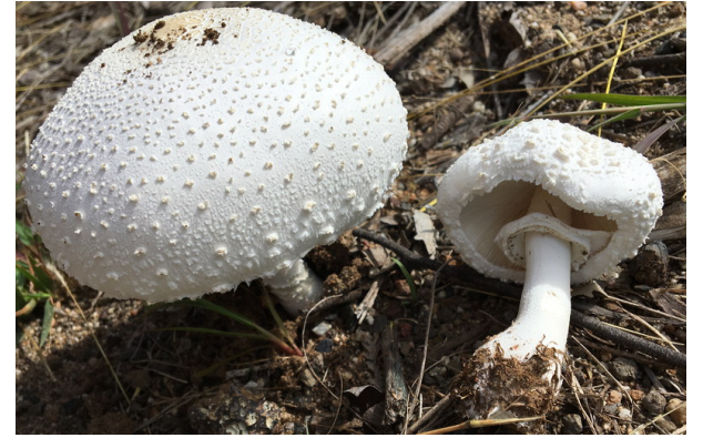
Macrolepiota dolichaula © Frances Guard

We found a group of white fungi growing by the roadside between Monto and Biloela in the Coominglah State Forest. It was a stony, rather dry ridge, but the fungi were in very good condition. They turned out to be Macrolepiota dolichaula . This is a common fungus in S-E Qld, growing in lawns and pastures, where it has a long stem, usually twice the length of the mature cap width. (Aberdeen uses that feature in his Key<sup>1</sup>). These had much shorter and stouter stems, and one can surmise that growing without the competition of grass, and in a drier environment, the fungus would not waste energy just to fit the description that humans have given it!