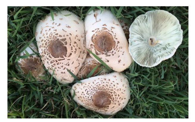
Chlorophyllum molybdites

Our next interesting find, and also in one of the lepiotoid genera, was Chlorophyllum molybdites . Once again, this fungus commonly occurs in pastures and watered lawns. (I do not find it in rainforest.) The places where we found it were in all cases irrigated lawns in Charters Towers parks, Lake Dalrymple Campground (by Burdekin Falls