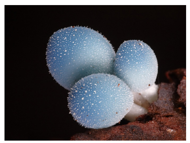
Leratiomyces sp. – early in fruiting.

Then there is the occurrence of a blue fungus in the South-East Queensland region which has an interesting story behind its naming and, as mentioned earlier, it is this fungus that I would like to focus on.