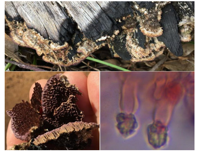
Trichaptum byssogenum. Top: brackets on a burnt log, as seen from above. Bottom left: Tubes and underside. Bottom right: cystidia.

Interestingly, Bailey's collection is currently on display in the Public Foyer of the Queensland Herbarium (BRI) along with a family photo, early copies of his field books and other memorabilia. Sadly, as the specimen is 138 years old, it has lost its purplish colour and is now dark brown.