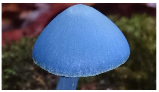
Entoloma hochstetteri 13th March 2016

Habitat: rainforest and wet sclerophyll forest but also in heath or sclerophyll / heath ecotones ^{\mbox{[NF]}}