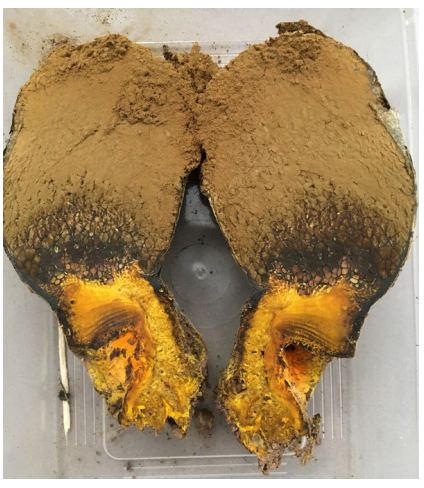
Pisolithus marmoratus

and at times pushing up through the bitumen. Pisolithus marmoratus is now accepted as being the most common of the Australian Pisolithus, although many field guides still use old names, such as P. arhizus. I was surprised on this trip to not find it at all until we were almost to