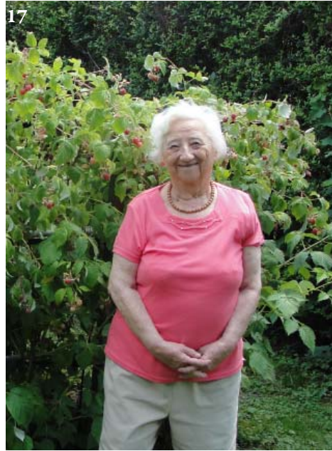
Figs 16–17. Details of Klára Verseghy's garden in Keszthely, 2013.