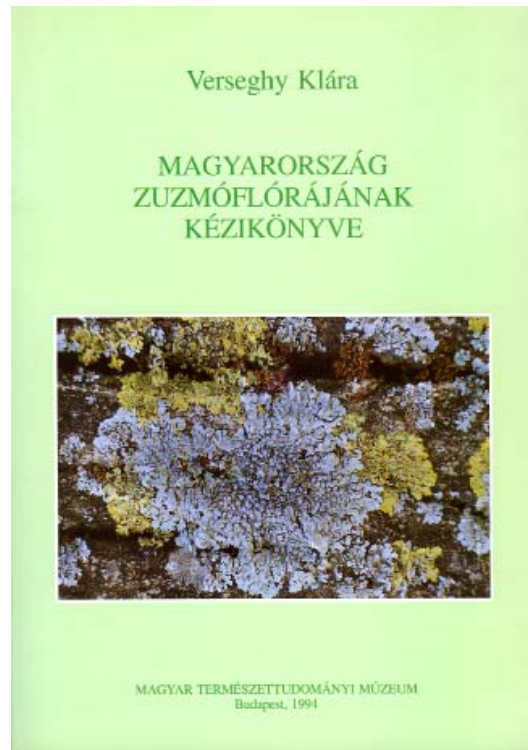
Fig. 22. Klára Verseghy’s main work from 1994.