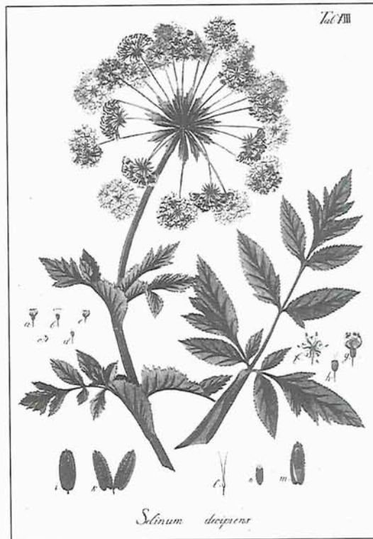
Fig. 3. A reproduction of the illustration of Selinum decipiens Schrad. & J. C. Wendl. designated here as the lectotype of Melanoselinum decipiens (Schrad. & J. C. Wendl.) Hoffm.