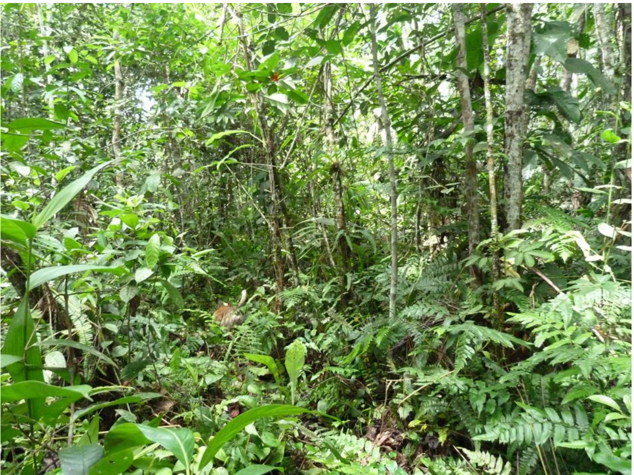
Figure 3. The two sampled swamp forests in Posic. Above: semi-dense to mixed swamp forest (SD); below: mixed swamp forest (MA).