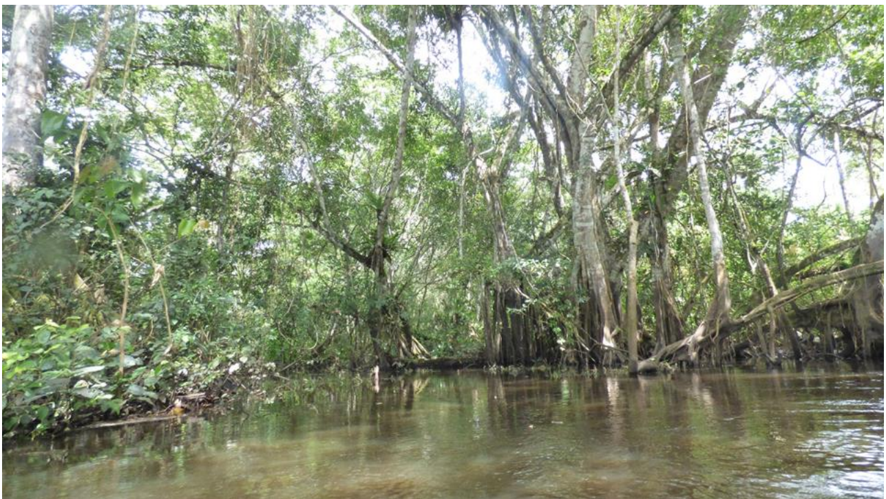
Figure 2. The two sampled swamp forests in ADECARAM, Tingana. Above: semi-dense swamp forest (SA); below: flood-prone area of mixed swamp forest (MI).