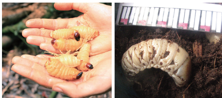
Fig 2. left: Bakiyo, also known as Mposo (hand for scale); right: Makokolo, (scale: 1 white bar = 5 mm)

The data presented here are based on information gathered and recorded from a combination of informal and semi-structured interviews and first-hand observations from two periods. The first was a study conducted by BM (Bibiche Mato) for a dissertation within the framework of the “Project Cuvette Centrale” between August and September 2007, focusing on plants used either as vegetables or as resources of caterpillars used for food (Fruth, 2011). The second was a side-project conducted by CP (Charlotte Payne) during the course of an internship with the “LuiKotale Bonobo Project” between October 2012 and February 2013, which focused on bonobo habituation efforts. CP contacted knowledgeable people from villages adjacent to the study site (Fig. 1) for information, and asked for samples from both the forest and the fields. Local names are in Lonkundo language. The insects were identified using photographic evidence in Latham (2003). Original photos taken during the study period were then cross-checked independently by two experts (Fig. 2). Feeding plants were identified using the LuiKotale botanical database (Fruth, 2011). All interviewees were Nkundo, and from the following villages: Lompole (N = 4), Ipope (N = 1), Iyoko (N = 2) and Ilombe (N = 1). Interviews were conducted in Lingala or French.