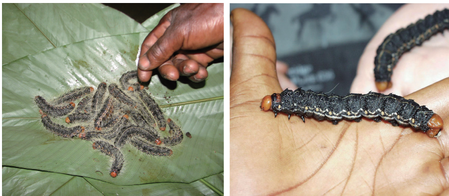
Fig 5. Yilo (left) at a young life stage, and (right) at a later life stage to show change in appearance (hand for scale)