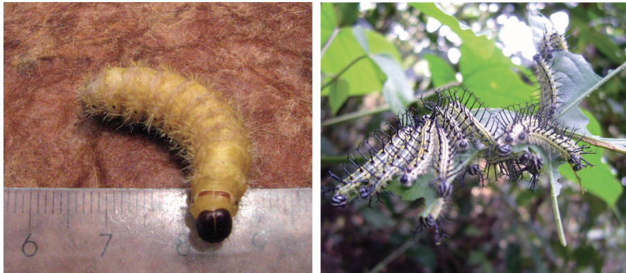
Fig 4. left: Ndualonga (scale: numbers represent cm); right: Besaake