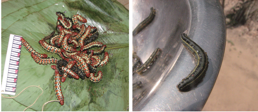
Fig 3. left: Bapakala (scale: 1 white bar = 5 mm) © LKBP/C. Payne; right: Benkiyete © LKBP/C. Payne