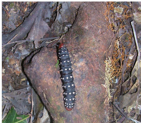
Fig. 6. Bankonzo