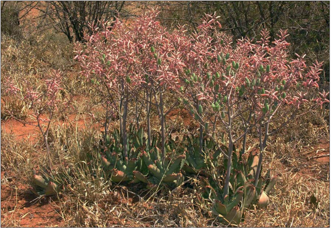
Figure 2. A. ammophila forms large dense colonies.