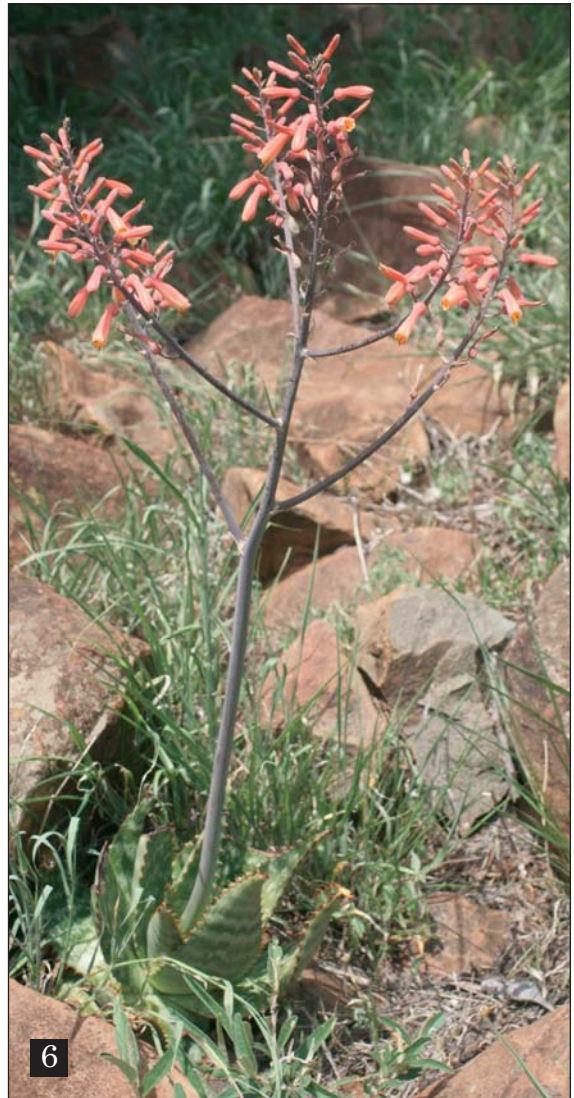
Figure 5. A. transvaalensis has dull milky green leaves with obscurely spotted lower surfaces and flesh-pink flowers. Figure 6. A. braamvanwykii in habitat near Wolmaransstad, North-West Province, South Africa.