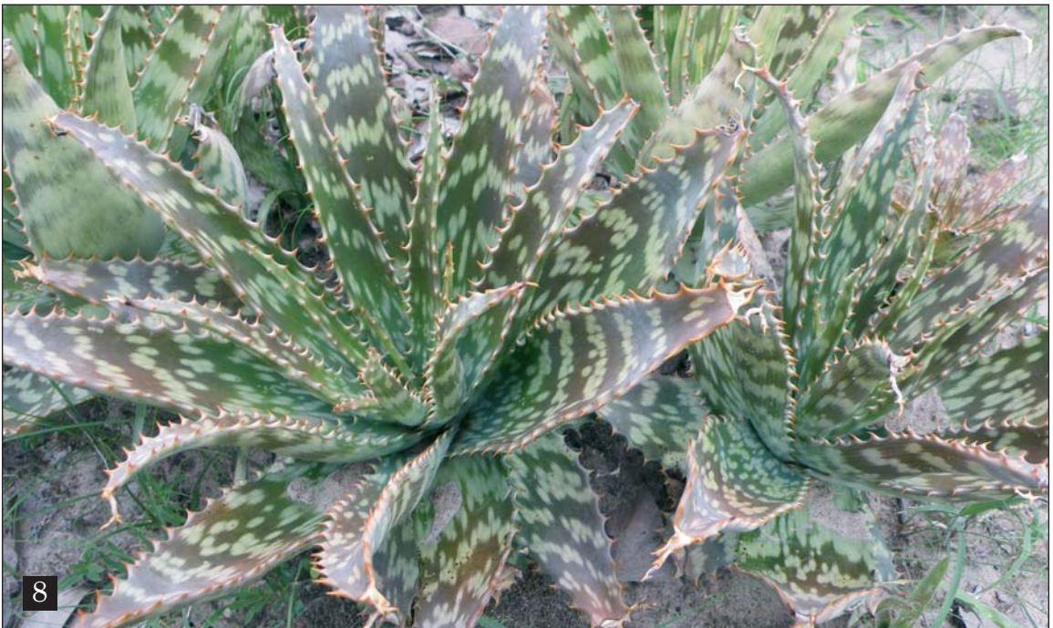
Figure 7. A. vandermerwei has very long, narrow, curved and almost snake-like leaves. Figure 8. Rosettes of A. zebrina showing the distinctly marked upper and lower surfaces.