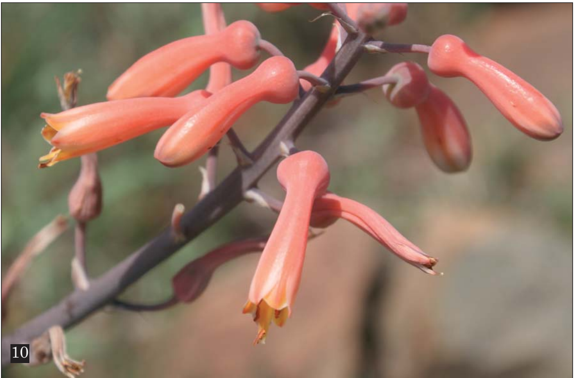
Figure 9. Close-up of a rosette of A. braamvanwykii . Figure 10. Close-up of the bright red flowers of A. braamvanwykii .