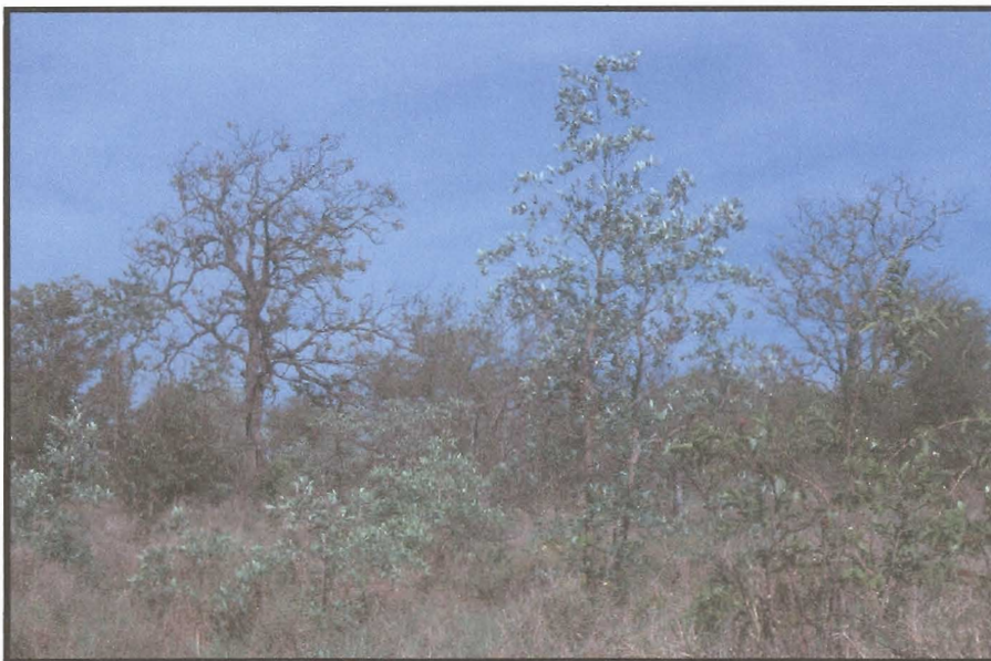
Figure 20 The Terminalia sericea - Colophospermum mopane major plant community in the Kruger National Park. The silver leaves of T. sericea interrupt the C. mopane dominated vegetation (a). Individuals of T. sericea and C. mopane (b).