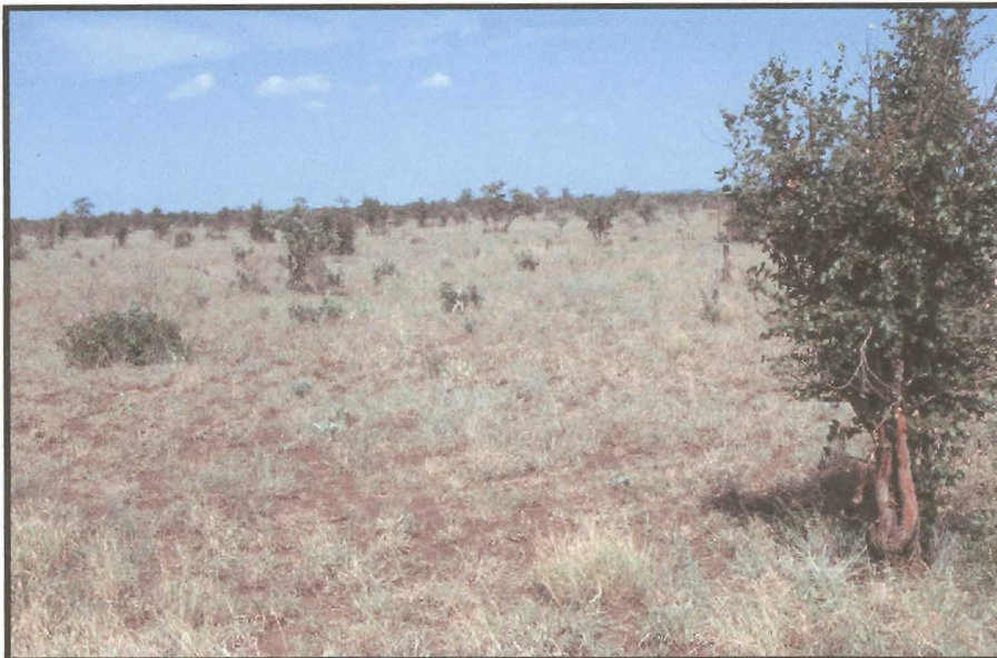
Figure 21 The Acacia nigrescens - Colophospermum mopane major plant community, the well-known shrubmopaneveld (a) of the South African Lowveld. Sclerocarya birrea often occurs in stunted individuals in this major plant community (b).