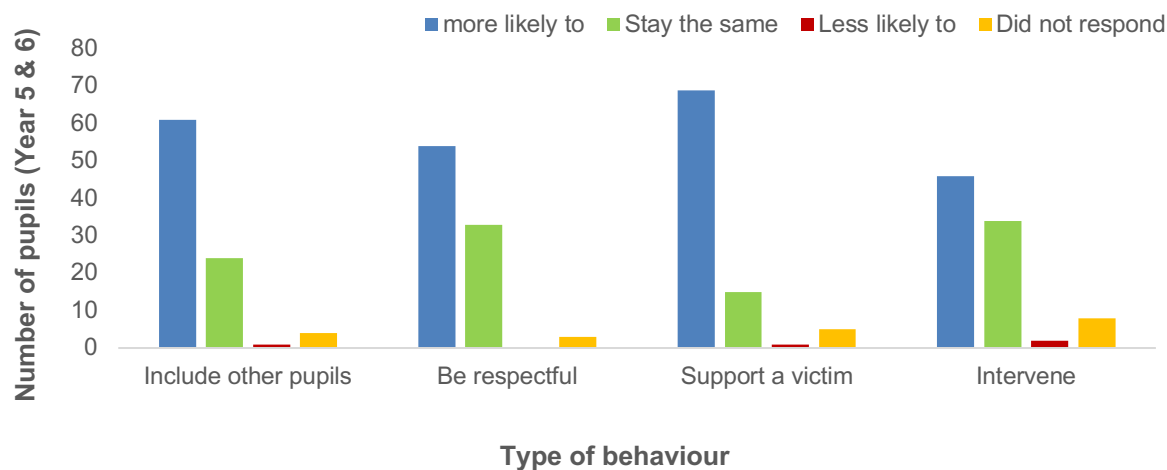
Figure 5.3. Pupils self-reported on their perceived behaviour changes.

Pupils in year 5 and 6 ( n=90 ) reported on their perceived behaviour changes with the majority stating that they would be more likely to include others, be respectful, support the victim, and intervene.