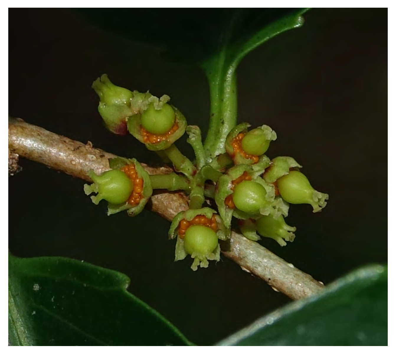
Figure 2. Xylosma craynii, female inflorescence showing articulated pedicels, tepals, orange lobed disk, ovaries, branched styles and lobed stigmas, (Cooper 2752 & Jensen CNS).

a champion of mountain top plants in the Wet Tropics bioregion so it seems appropriate that this high-altitude species will carry his name.