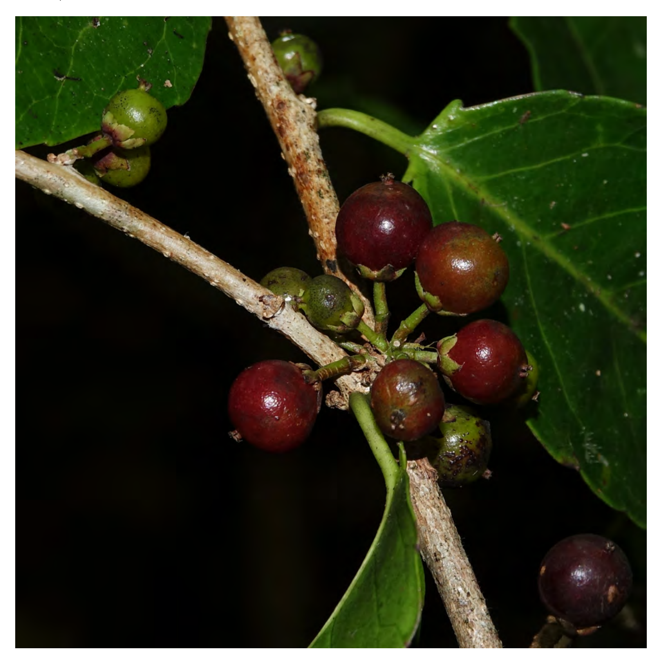
Figure 3. Xylosma craynii, infructescence showing articulated pedicels, persistent tepals and ripe fruit (Cooper 2606 Jensen & Hawkes CNS).