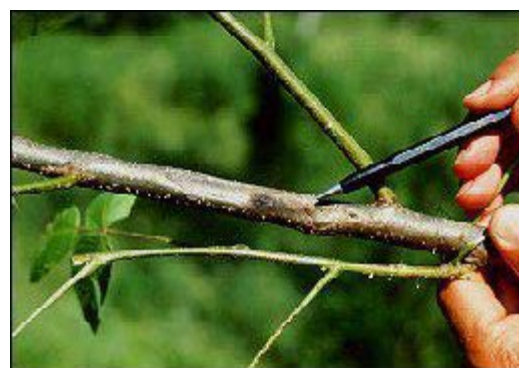
Figure 3. (right) Young canker with sunken bark and inky-black exudate.

Young, annual cankers are elongated, sunken areas commonly originating at leaf scars and buds (fig. 3), often with an inky black center and whitish margin (fig. 4). Under the bark, the fungus forms pegs that break through the outer bark surface, exposing the spores (fig. 5). Peeling the bark away reveals the brown to black elliptical areas of killed cambium (figs. 6&7). Older, perennial branch and stem cankers are often found in bark fissures (fig. 8), or covered by bark and bordered by successive callus layers (fig. 9). Cankers develop throughout a tree, but commonly occur on the main stem, at the base of trees and on exposed roots. Butternut is the only natural host known to be killed by the fungus. The fungus can survive on dead trees for at least 2 years. It is spread by rainsplashed spores, possibly by insects and birds, and perhaps by seeds.