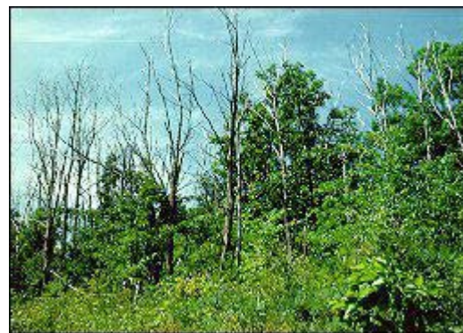
Figure 2 (right). Butternut killed by butternut canker.

Butternut is being killed throughout its range by Sirococcus clavignenti-juglandacearum , a fungus most likely introduced from outside of North America (fig. 2). The fungus initially infects trees through buds, leaf scars, and possibly insect wounds and other openings in the bark, rapidly killing small branches. Spores produced on branches are carried down the stem by rain, resulting in multiple, perennial stem cankers that eventually girdle and kill infected trees. Butternut canker was first reported from southwestern Wisconsin in 1967; however, it has probably been present much longer than that based on detailed examinations of killed trees in North and South Carolina. The disease has contributed to as much as an 80 percent decrease in living butternut in some States.