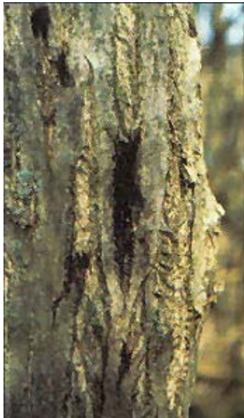
Black sooty appearance of cankers on the trunk during the summer.