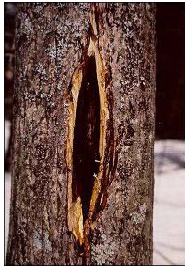
Figure 6 and 7. Typical cankers with bark removed, revealing the elliptical areas of killed cambium.