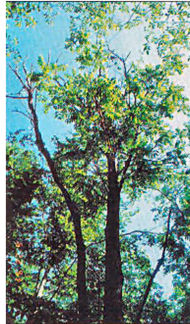
Crown dieback due to infection by the fungus.