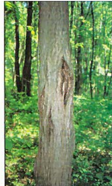
Older cankers on the trunk.