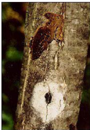
Figure 5. Above canker with outer bark removed to expose fungus pegs.