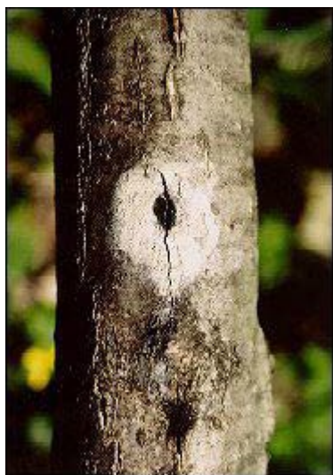
Figure 4. Stem canker with black center and white margin.