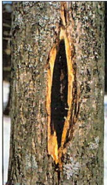
Stained wood beneath the bark.