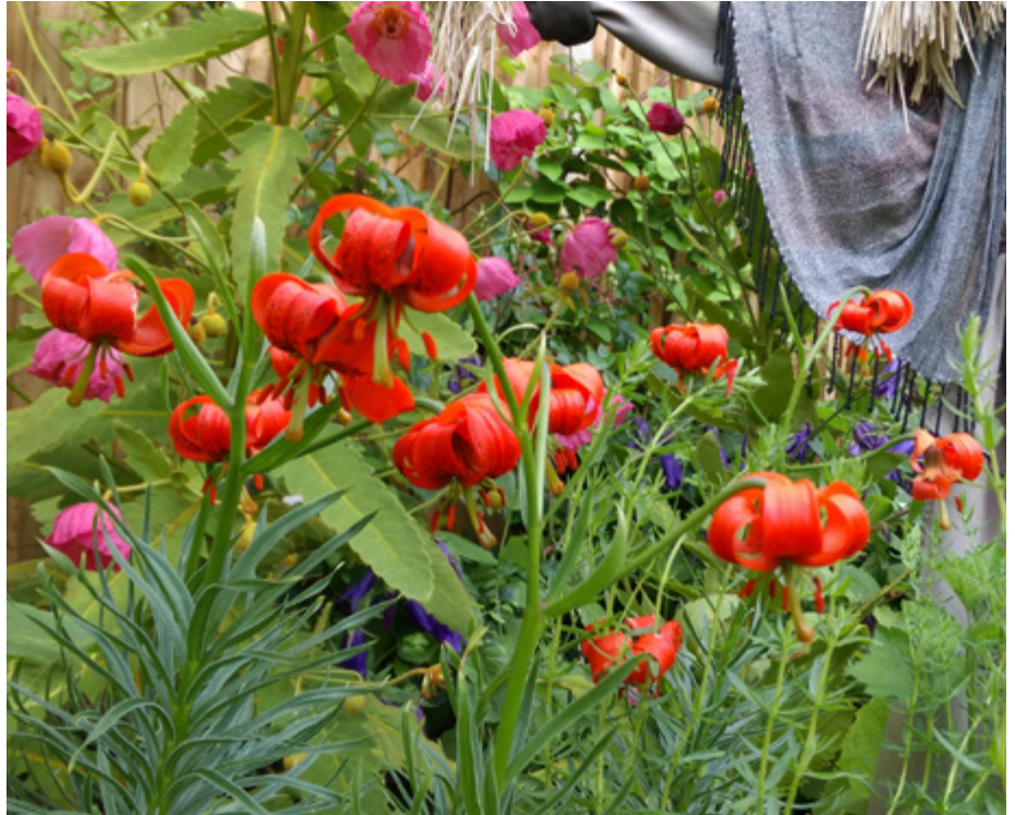
North Lily 'Theseus'

I hope Susan will write one day a dedicated article on her method of growing species lilies from seed for Lilies and Related Plants , but for now we are happy with the knowledge she shared with us and that you should not be afraid to experiment and challenge what experts tell you.