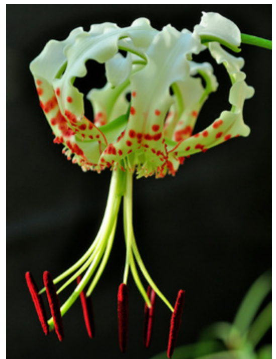
Lilium speciosum var. gloriosoides