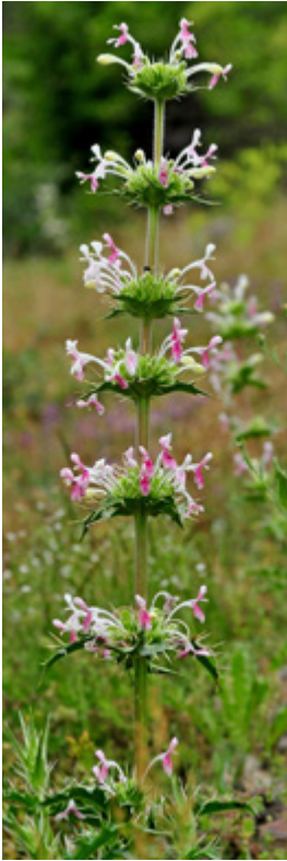
Morina persica with its spiky leaves topped by fragrant flowers

travelling up the Altinere valley to the famous Sumela Monastery. On the way up to and at the monastery we found Campanula betulifolia growing in small crevices in the rock. The plants had the characteristic birch-like foliage and were white flowered.