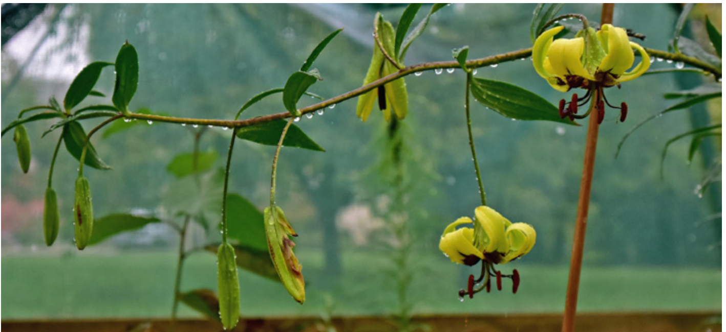
Lilium primulinum burmanicum