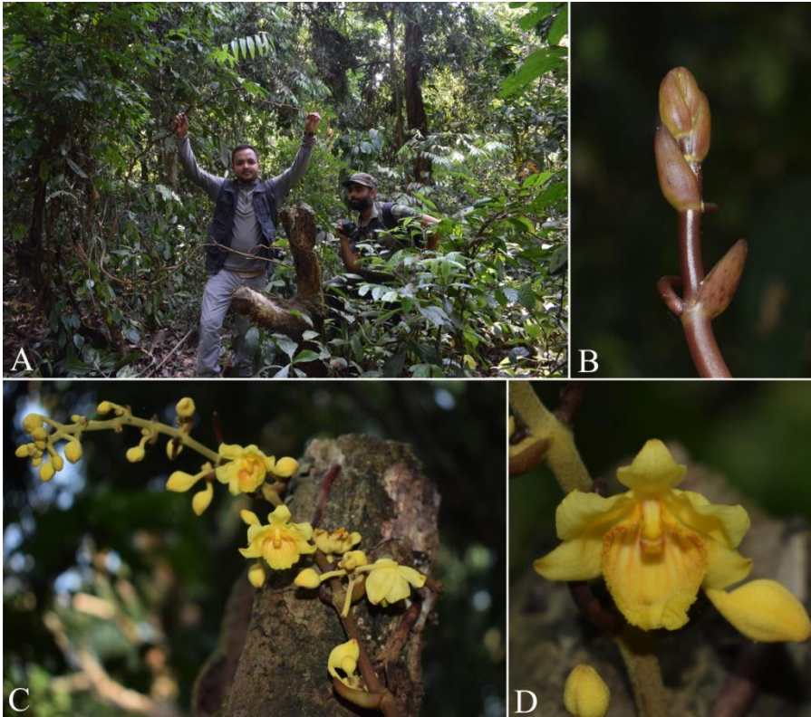
Plate 2: Galeola nudifolia

With the new taxon included here, the total number of orchid species present in the state of Assam is raised to 401. So far Behali Reserve Forest (Biswanath district of Assam) acts as the only refuge to the orchids and other native plant species. Illegal logging, extension of agriculture and human settlements, lack of forest personals for effective regulation and firewood collection have led to serious decline in the natural habitats and endanger many species.