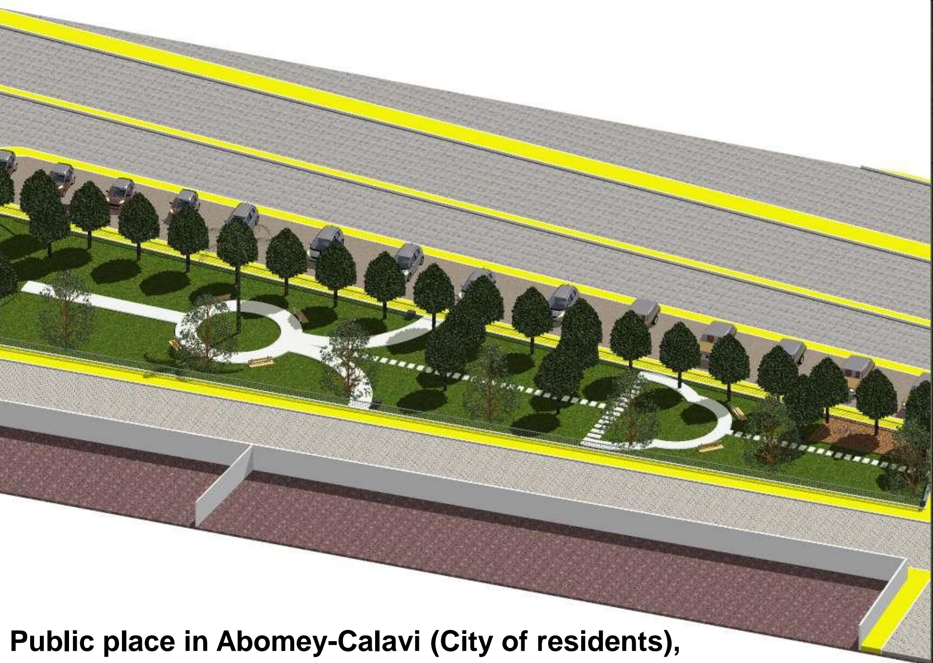
Public place in Abomey-Calavi (City of residents), designed and proposed by the team of Rufford to host native tree