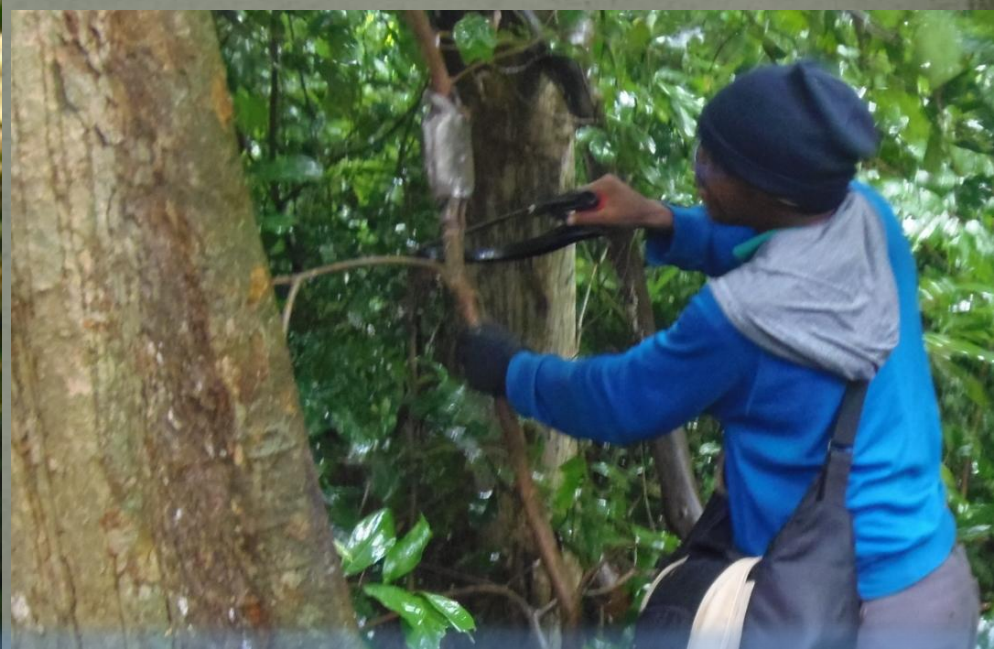
New native tree rapidly propagated in the Ewe-Adakplame Relict Forest (Team of Rufford on field)