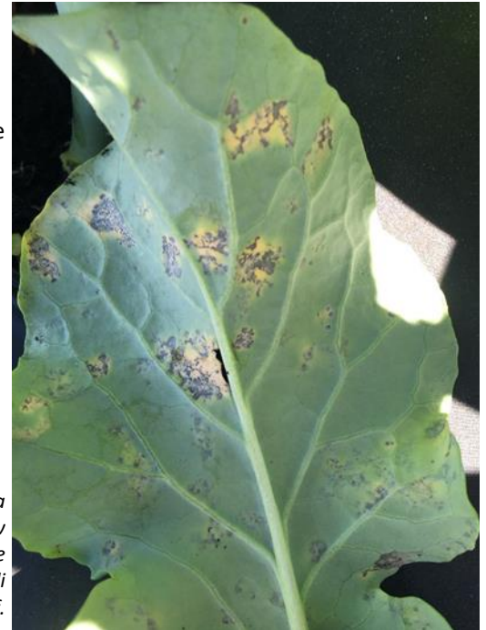
Figure 3: Brassica downy mildew symptoms on the underside of a broccoli leaf.

For organic growers, avoidance is crucial. Increase plant spacing to improve air circulation and minimize leaf-to-leaf disease transmission. Make sure to rotate fields out of brassicas for at least three years and work to control cruciferous weeds that may also act as sources for inoculation. Most OMRI-approved fungicides have little demonstrated efficacy. Organic copper formulations, like Badge X2 (copper oxychloride + copper hydroxide, FRAC M1) are the best bet, but products like Double Nickel 55 ( Bacillus amyloliquefaciens strain D747, FRAC 44), Serenade ( Bacillus subtilis , no FRAC), Stargus ( Bacillus amyloliquefaciens strain F727 cells and spent fermentation media, FRAC 44) and Regalia ( Reynoutria sachalinensis extract, FRAC P5) are also labeled for downy mildew on most cole crops and have shown some reduction in disease severity in trials when used preventatively. ■