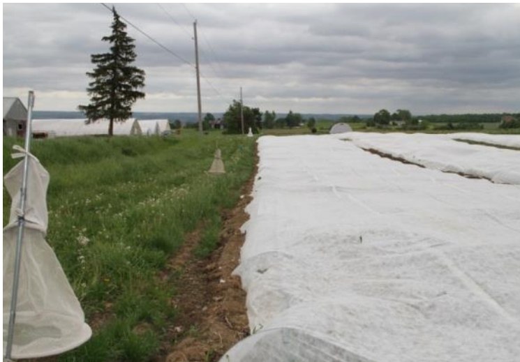
Sweet corn started under row cover with traps set up along the edge.

Knowing when ECB flights begins, reaches, peak and ends in a given field is key to the proper timing of Trichogramma releases. Trichogramma ostrinae are small parasitic wasps that lay their eggs in ECB egg masses and have shown the highest level of ECB control in field trials. Releases should coordinate with the start of ECB moths egg-laying, when the corn is in the four to six leaf stage. You can use regional information about flight activity from your regional county