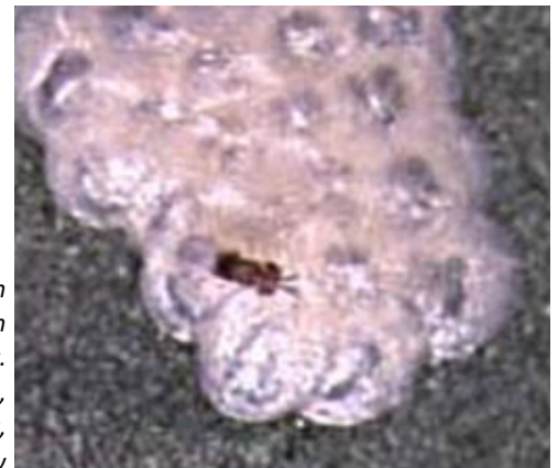
Female T. ostrinae on egg mass of European corn borer.

If you are interested in placing traps on your farm (which is ideal), you can order net and bucket traps as well as pheromone moth lures from Great Lakes IPM, www.greatlakesipm.com or Gemplers, www.gemplers.com . For sweet corn, we put out three heliothis net traps, two for each of the ECB strains and one for Corn Earworm which will be flying up from the south in a few more weeks. You may also want to monitor for Western Bean Cutworm and Fall Armyworm. Green bucket traps work well for these moths. If you need help ordering these items, feel free to email me at tr28@cornell.edu or call 845-691-7117. You can find lots of useful monitoring information for scouting fresh-market sweet corn at the NYS IPM Sweet Corn Pheromone Trap Network webpage: www.sweetcorn.nysipm.cornell.edu . You may be interested in following ECB and CEW moth flights if you grow peppers or tomatoes as these are susceptible crops particularly when local corn is drying down and less attractive to egg laying moths. For best results, the ECB E and ECB Z traps should be set at least 50 feet from each other and do not cross contaminate pheromone lures when servicing traps. ■