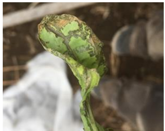
Leaf lesions and discoloration due to Pseudomonas infection in arugula.