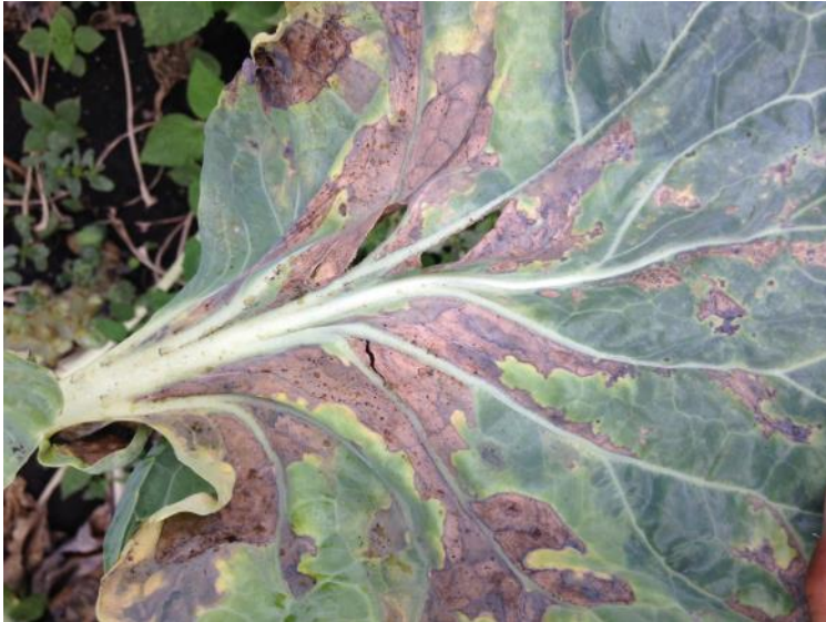
Figure 2: More advanced infections can result in a grayish-blue streaking at the heart of leaf lesions with yellowish discoloration at the margins.

program on all cole crops in proximity to plantings showing symptoms. Dr. Chris Smart at Cornell University has conducted fungicide efficacy trials for downy mildew control on brassicas. Manzate Pro-Stick ( mancozeb , FRAC M3, only labeled for broccoli and cabbage) is effective when used preventively and can be alternated with Champ Formula 2F (copper hydroxide, FRAC M1). Bravo Weather Stik ( chlorothalonil , FRAC M5) and Presidio ( fluopicolide , FRAC 43, Presidio must be tank mixed with another fungicide with a different mode of action for resistance development prevention) are the other two fungicides recommended by Dr. Smart.