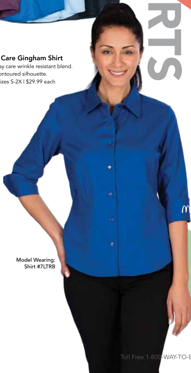
Model Wearing: Shirt #7LTRB

#7LSECG | Teal Green | Ladies' sizes S-3X | $21.99 each