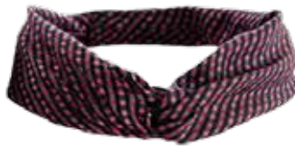
#T133L | Ladies' Luau Pink