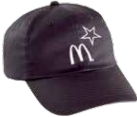
Fun Combo Cap 100% cotton with adjustable strap. #5FC | Black | $4.99 each