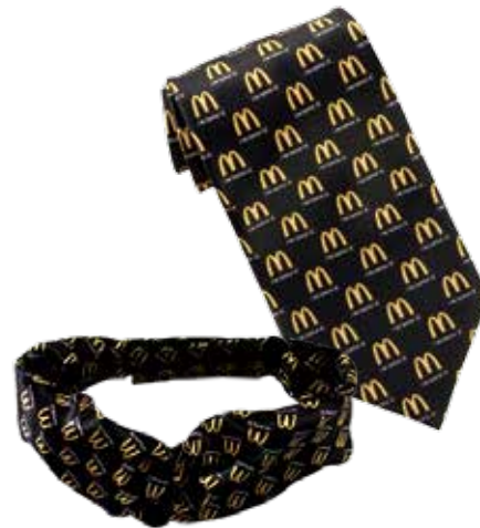
#T106M | Men's "i'm lovin' it" #T106L | Ladies' "i'm lovin' it"