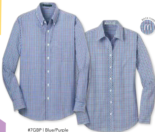
#7GBP | Blue/Purple