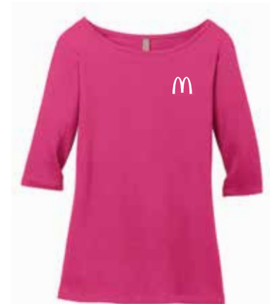
Ladies' ¾ Sleeve Tee 4.3-ounce, 100% cotton. Comfortable and stylish! #2TQP | Fuchsia Pink | Ladies' sizes S-3X | $9.99 each