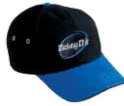
Mickey D's Cap 100% cotton with adjustable strap. #5NMD | Black/Royal Blue bill | $4.99 each