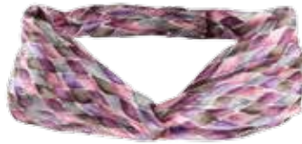
#T139L | Ladies' Raindrop

Slimmer cut for a more retail look! 100% polyester New Lower Price! $9.99 each