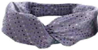
#T129L | Ladies' Purple Dots