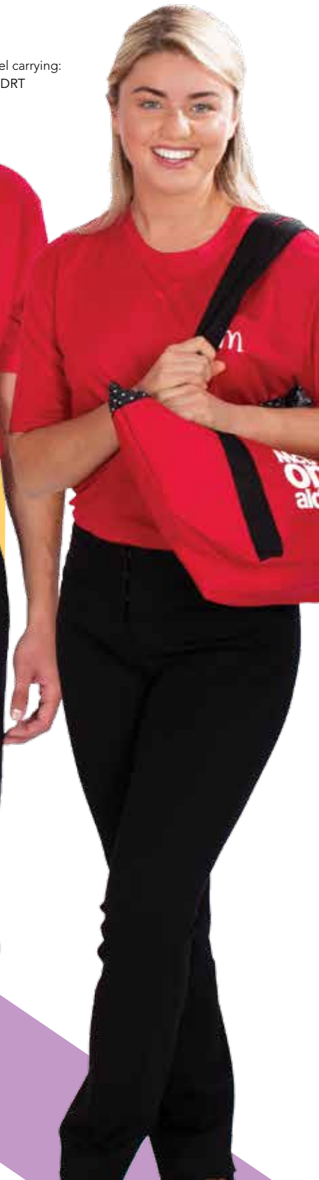
Model wearing: #1ASRR