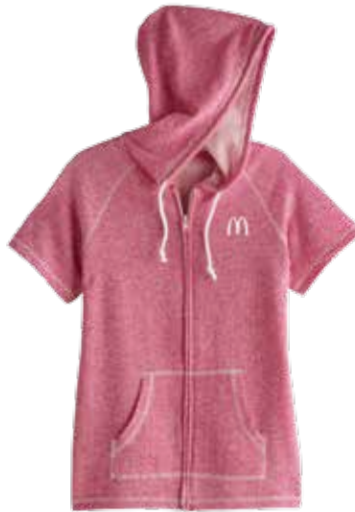
Ladies' Short Sleeve Zip Hoodie 5.3-ounce, 70/30 cotton/poly. #6SSZ | Pink | Ladies' sizes S-2X | $13.99 each