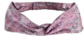
#T138L | Ladies' Lavender