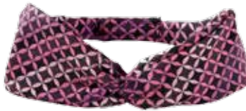
#T141L | Ladies' Pinwheel