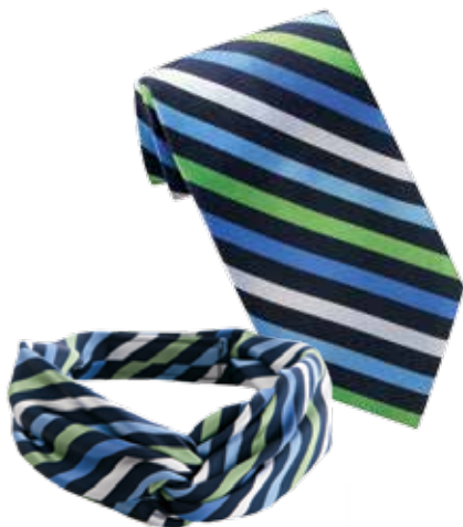
#T132M | Men's Blue/Kiwi #T132L | Ladies' Blue/Kiwi