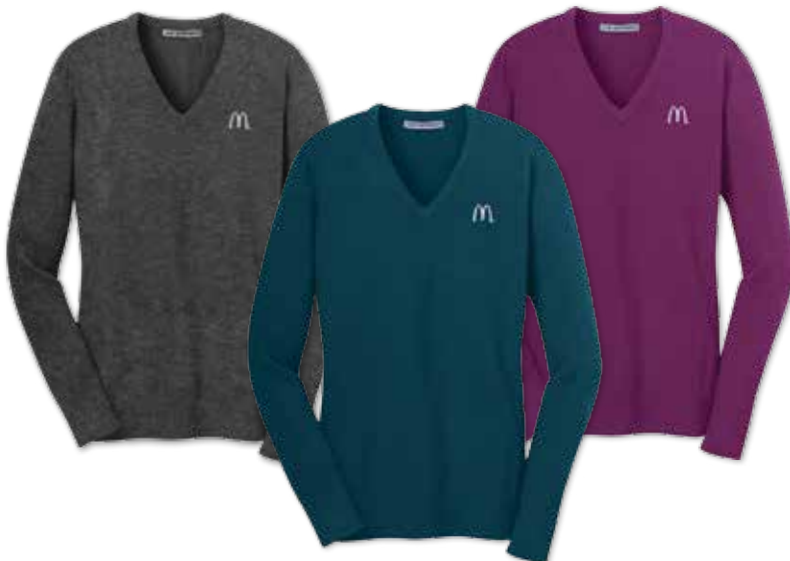
Ladies' V-Neck Sweater 60/40 cotton/nylon. Fine-gauge v-neck sweater with rib knit v-neck, cuffs and hem. Longer rib knit height at cuffs for character. #6LSVG | Charcoal Heather | Ladies' sizes S-3X | $29.99 each #6LSVB | Blue | Ladies' sizes S-3X | $29.99 each #6LSVP | Berry | Ladies' sizes S-3X | $29.99 each