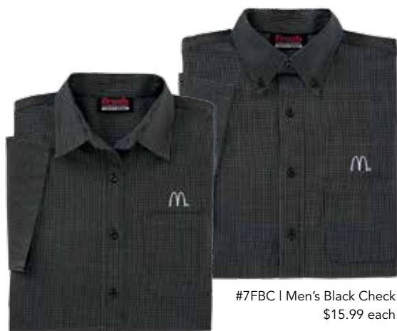
#7FBC | Men's Black Check $15.99 each