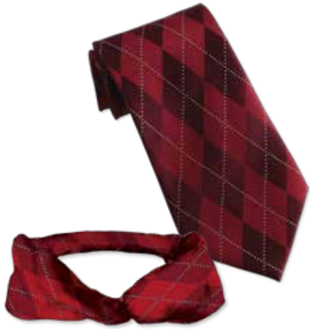
#T161M | Men's Burgundy Argyle #T161L | Ladies' Burgundy Argyle