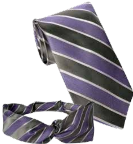
#T166M | Men's Gray & Purple Striped #T166L | Ladies' Gray & Purple Striped