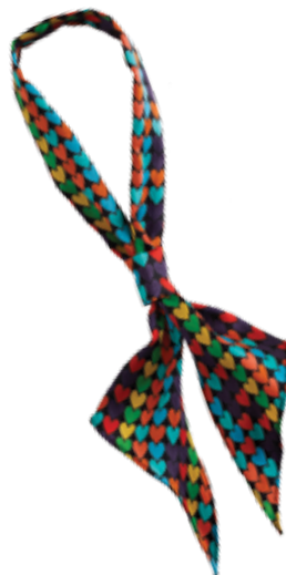
#T159L | Ladies' lovin' Tie