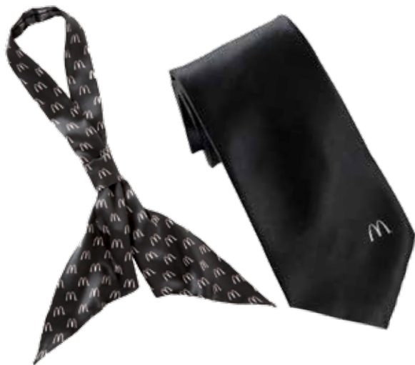
#T156L | Ladies' Solid Black Arch Loop #T156M | Men's Solid Black Arch