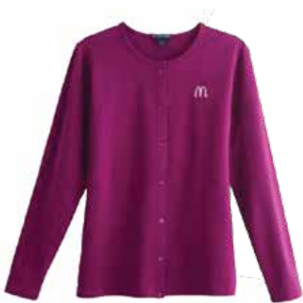
Ladies' Button Front Cardigan 6.5-ounce, 95/5 cotton/spandex. Hemmed sleeves, bottom, and matching pearlized buttons. #8BFCPB | Pink Berry Ladies's sizes S-3X | $20.99 each