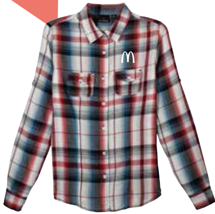
Burnside® Ladies' Plaid Shirt 3-ounce, 55/45 cotton/poly. Stylish two chest pockets with button down flaps and roll up sleeves. #7BPRL | Red/ Navy Plaid Ladies' sizes S-2X | $28.99 each