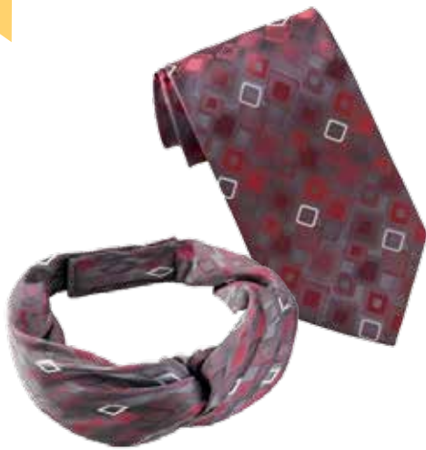
#T125M | Men's Burgundy #T125L | Ladies' Burgundy