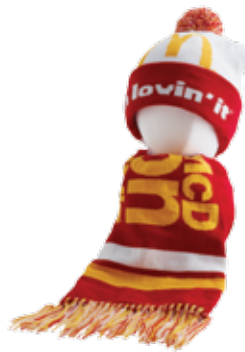
"i'm lovin' it" Pom Beanie & Fry Scarf 100% acrylic. 11" length beanie and scarf 8.5" W x 52" L. #5ILPB | Red/White/Gold | $7.99 each #9ILFS | Red/White/Gold | $10.99 each