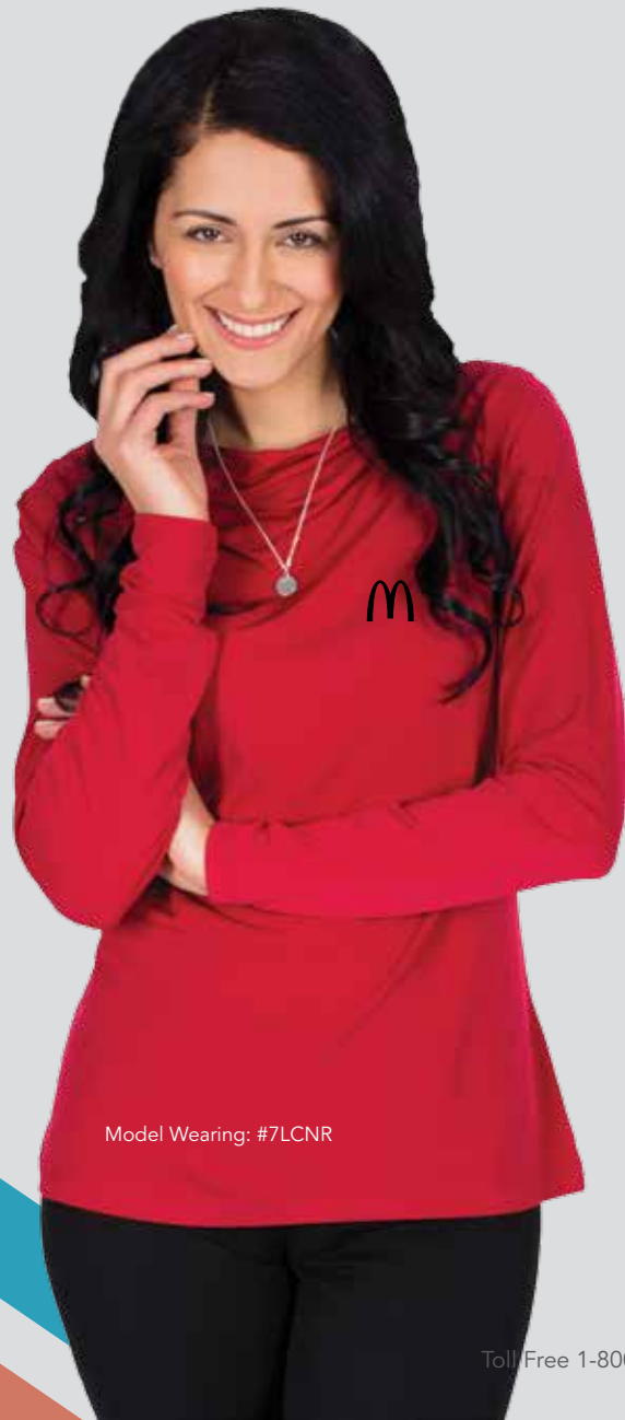
Model Wearing: #7LCNR