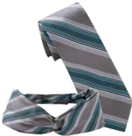
#T143M | Men's Multi Stripe #T143L | Ladies' Multi Stripe