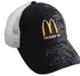
"i'm lovin' it" Graphic Cap 100% cotton front with mesh back. #5LIGC | Black/White | $4.99 each