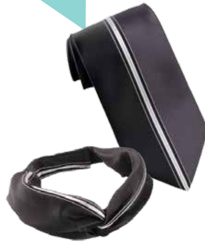
#T126M | Men's Black/Grey #T126L | Ladies' Black/Grey