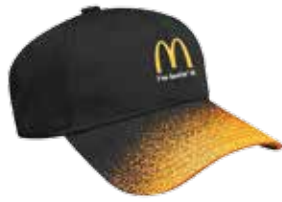
Speckle Bill "i'm lovin' it" it Cap 100% cotton with adjustable strap. #5SBIL | Black/ Gold | $5.99