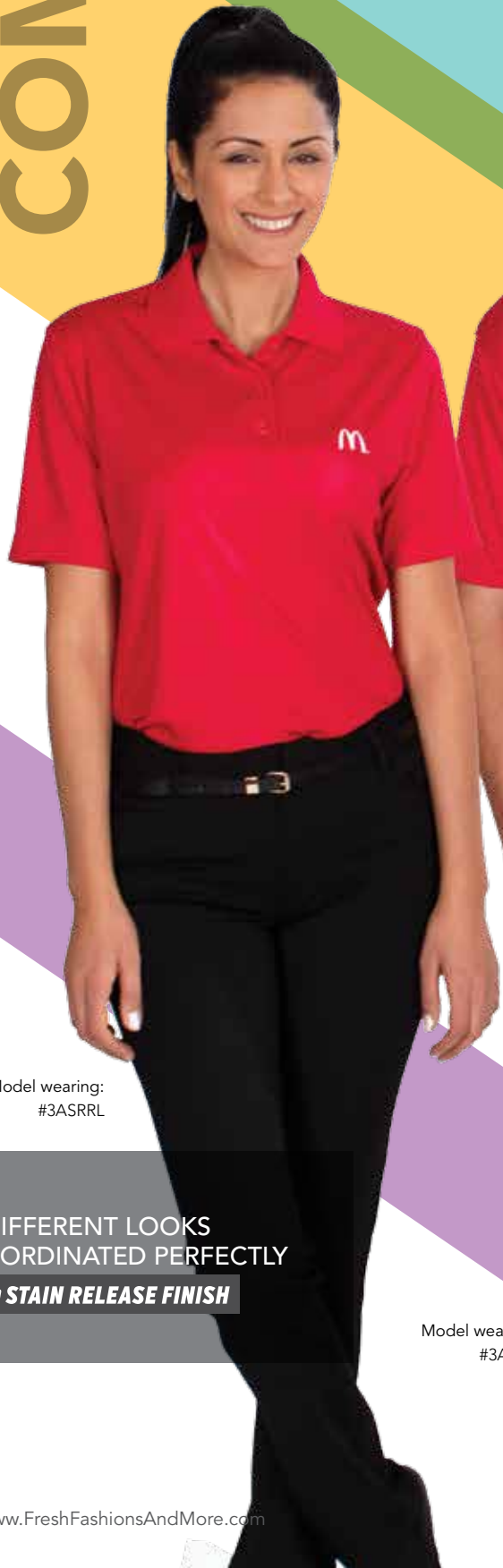
Model wearing: #3ASRRL