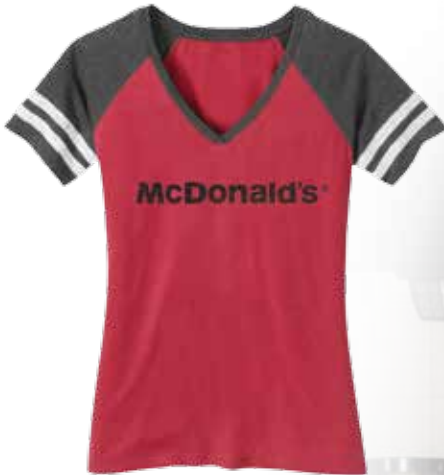
Ladies' Striped Sleeve V-Neck T-Shirt 60/40 cotton/poly. #1VSRL | Red/Charcoal | $10.99 each