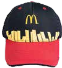
Fun Fry Cap 100% cotton with adjustable strap. #5FRY | Black/Red | $5.99 each