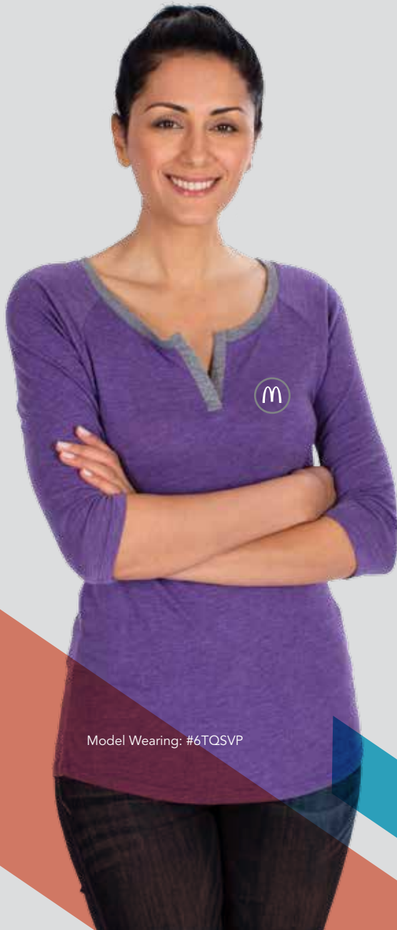
Model Wearing: #6TQSVP

#6TQSVR | Red/Heather Grey Ladies' sizes S-2X | $12.99 each #6TQSVP | Purple/Heather Grey Ladies' sizes S-2X | $12.99 each