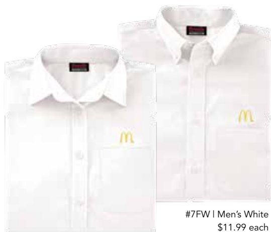
#7FW | Men's White $11.99 each