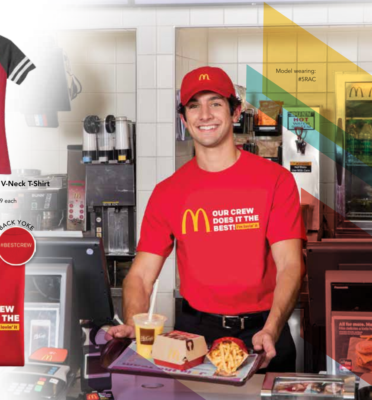
Model wearing: #5RAC