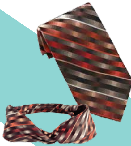
#T136M | Men's Coral Dots #T136L | Ladies' Coral Dots