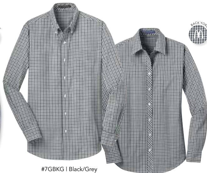
#7GBKG | Black/Grey