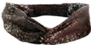
#T131L | Ladies' Paisley