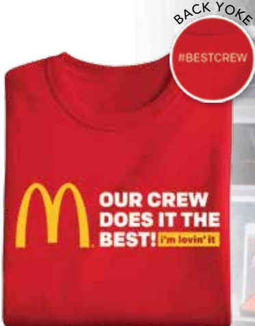
Best Crew T-Shirt #1RCS | Red | $5.99 each