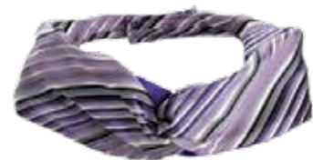
#T118L | Ladies' Purple/Black