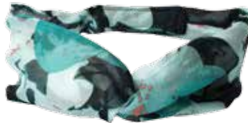
#T168L | Ladies' Turquoise & Teal Flowers