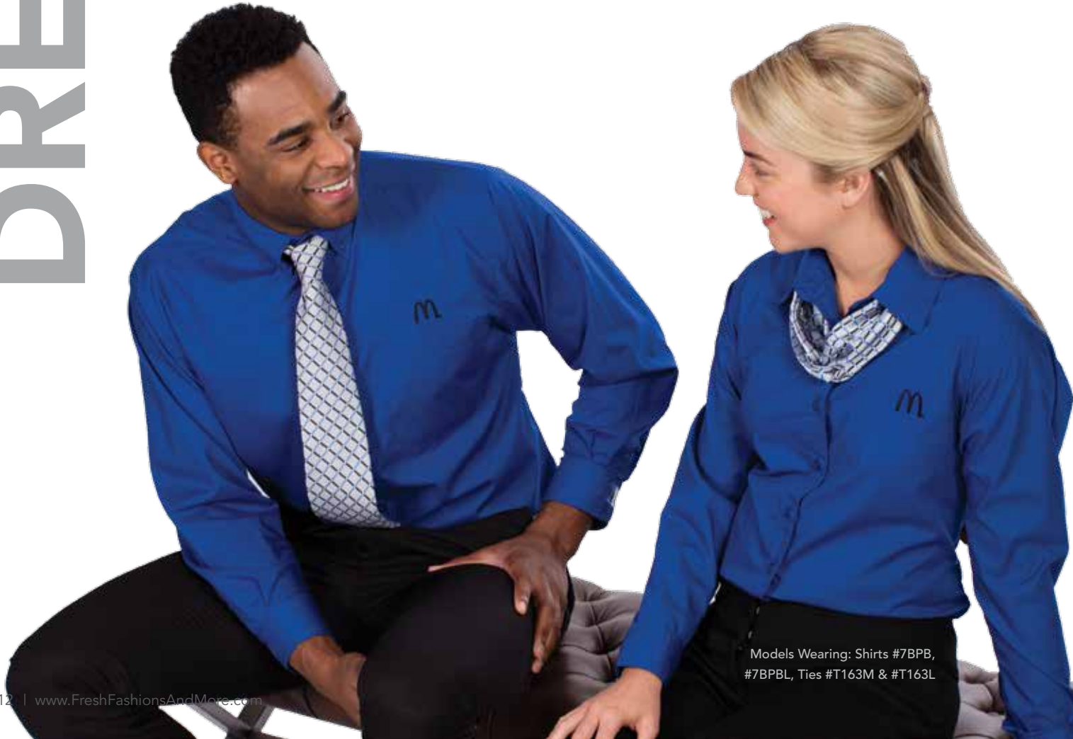
Models Wearing: Shirts #7BPB, #7BPBL, Ties #T163M & #T163L

3-ounce, 65/35 poly/cotton. Lightweight, soft and very durable. Wrinkle resistant and open collar. #7BPBL | Blue | Ladies' sizes S-3X | $16.99 each #7BPBKL | Black | Ladies' sizes S-3X | $16.99 each #7BPWL | White | Ladies' sizes S-3X | $16.99 each #7BPBGL | Burgundy | Ladies' sizes S-3X | $16.99 each