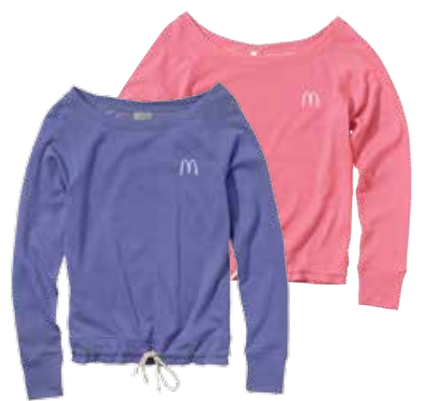
Ladies' MV Sport® Drawcord Crewneck 5.6-ounce, 55/45 cotton/poly. French terry, shoulder to shoulder scoop neck, raglan sleeves, and ivory drawstring waistband. #6DCB | Periwinkle Blue Ladies' sizes S-2X | $13.99 each #6DCC | Coral | Ladies' sizes S-2X | $13.99 each *while supplies last