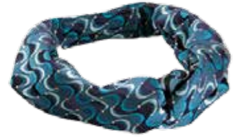
#T124L | Ladies' Turquoise

Slimmer cut for a more retail look! 100% polyester New Lower Price! $9.99 each