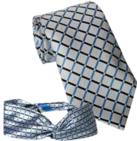
#T163M | Men's Blue & Gray Squares #T163L | Ladies' Blue & Gray Squares