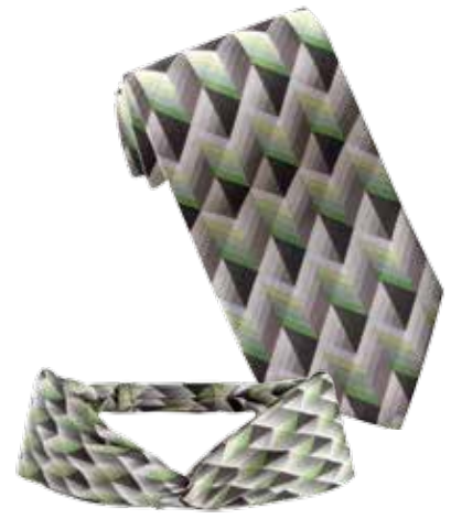
#T135M | Men's Diamond #T135L | Ladies' Diamond