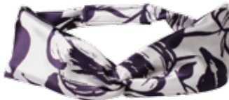
#T167L | Ladies' Purple Flower Bud