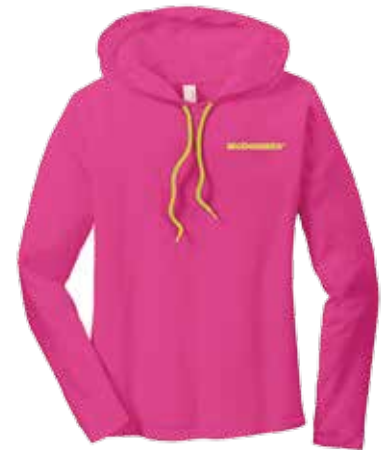
Ladies' Long Sleeve Hooded Tee 4.5-ounce, 100% ring spun cotton. Relaxed, unlined hood with contrast drawcord and semi-fitted silhouette with side seam. #6HTPL | Hot Pink/Neon Yellow Ladies' sizes S-2X | $13.99 each