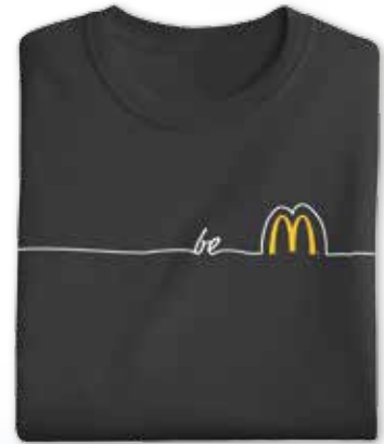
Be McDonald's T-Shirt #1BE | Charcoal Grey | $4.99 each