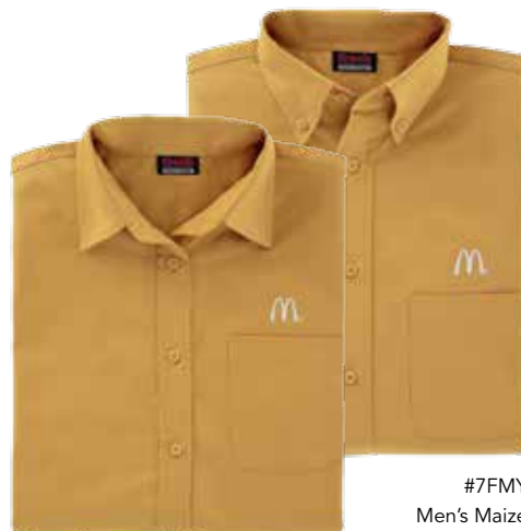
#7FMYL | Ladies' Maize $8.99 each