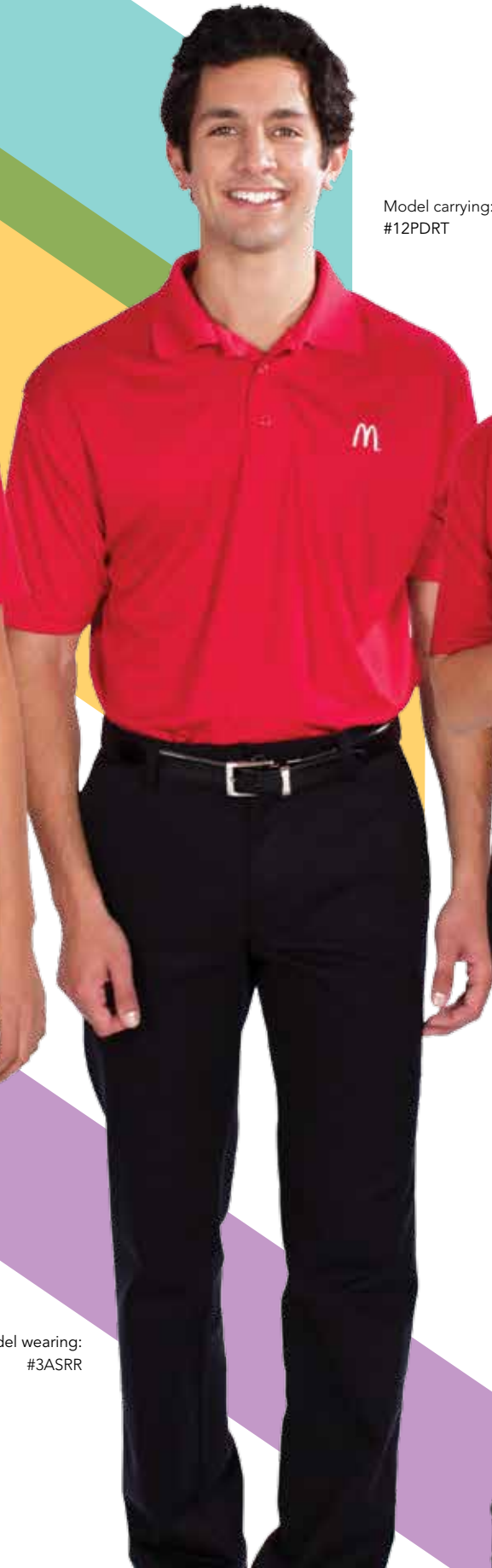
Model wearing: #3ASRR