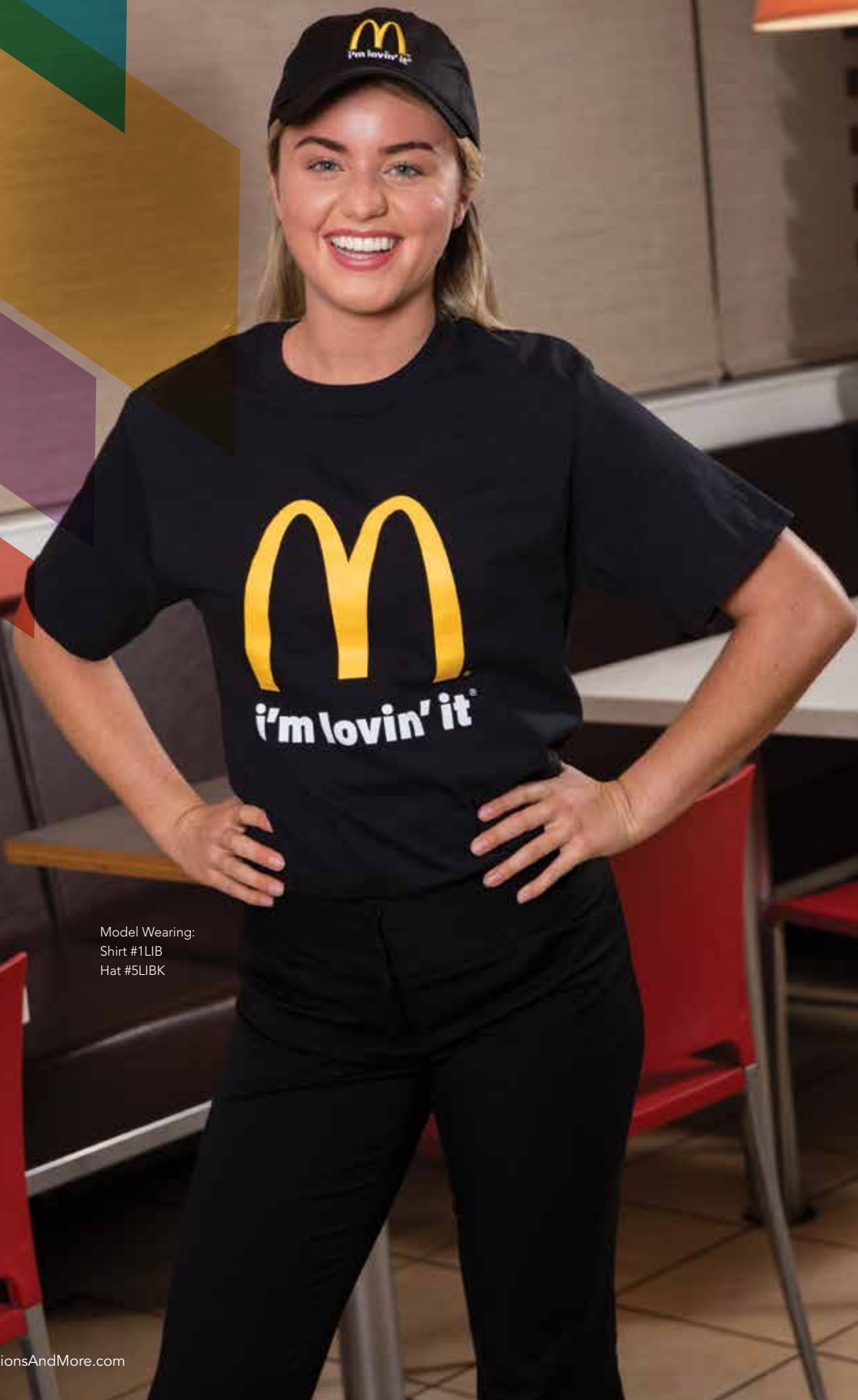
Model Wearing: Shirt #1LIB Hat #5LIBK