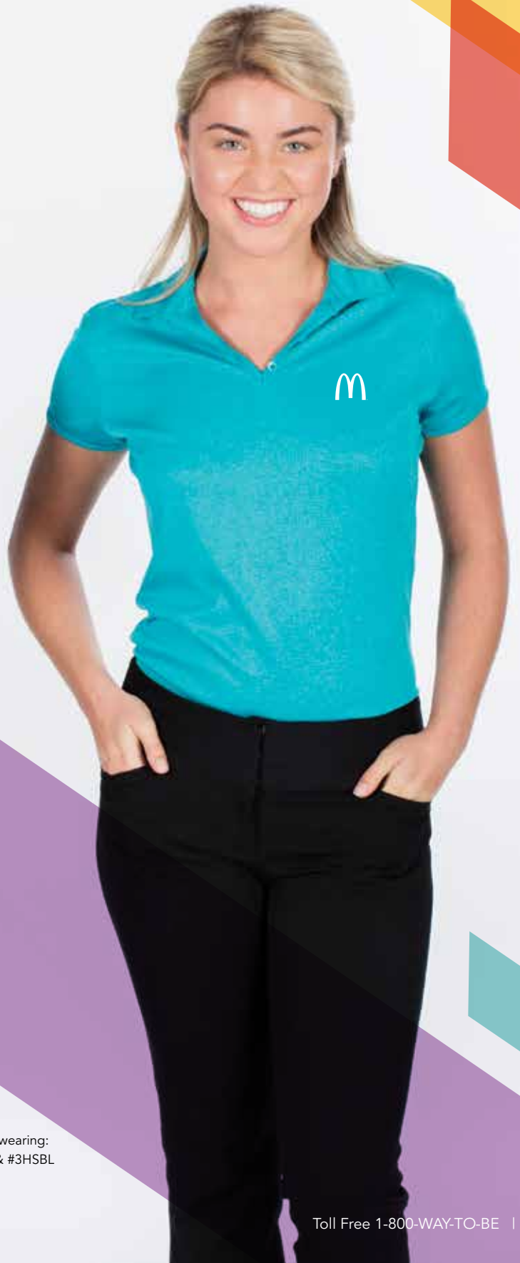
Models wearing: #3HSB & #3HSBL