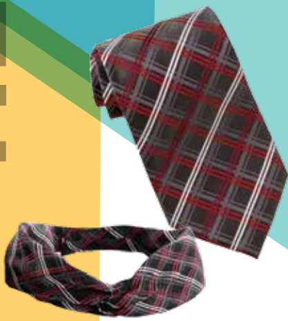
#T130M | Men's Plaid #T130L | Ladies' Plaid