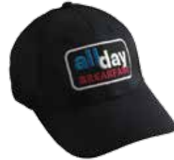
All Day Breakfast Cap 100% cotton with adjustable strap. #5ADBC | Black | $5.99 each