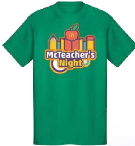
McTeacher's Night T-Shirt #1GTMCT | Kelly Green | $5.99 each