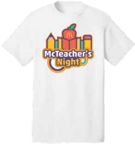
McTeacher's Night T-Shirt #1WMCT | White | $4.99 each