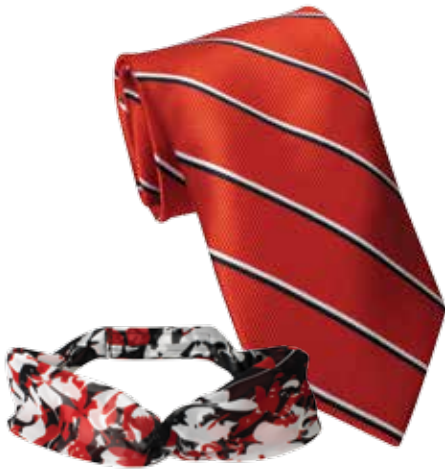
#T165M | Men's Red, Black & White Striped #T165L | Ladies' Red, Black & White Flowered