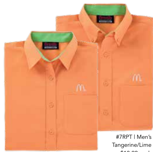
#7RPTL | Ladies' Tangerine/Lime $10.99 each