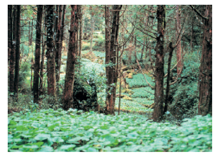
Figure 7. Wasabi grown in soil under an evergreen tree canopy in Taiwan.

Use irrigation in field production systems to 1) maintain soil moisture levels, 2) provide humidity, and 3) cool the plants. Micro-irrigation systems are suited to wasabi production because they maintain good soil moisture and high humidity in the canopy. Keep wasabi roots moist but not saturated. Base irrigation schedule on plant observations (e.g., wilted plants trigger more irrigation; root rot is a sign of over-irrigation).