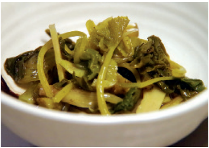
Figure 2. Wasabi stems being grated to paste (a) and pickled wasabi petioles (b).

Though wasabi is a staple condiment in Japanese cuisine, it is used sparingly to enhance the flavor of European and North American foods such as specialty dips, salad dressings, nuts, and cheese.