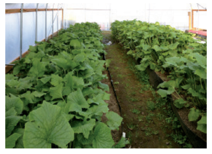
Figure 9. Wasabi grown in raised soil beds in a high tunnel in northwest Washington.