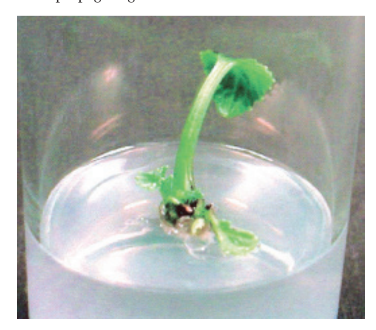
Figure 3. Wasabi plantlet grown from tissue culture.

Suppliers use tissue culture to quickly produce many plantlets that should become high-yielding disease-free plants. The major challenge with tissue culture is the heavy bacterial contamination rate in explants and the high cost of generating clean plants. Losses of up to 60% in tissue culture propagation are not uncommon. In 1994, experimental micropropagation of peduncle (inflorescence stem) explant material (Potts 1994) at Washington State University successfully produced 100% disease-free plantlets. Shoot apices, embryo, pollen, callus, and protoplast culture are all possible sources for micropropagating wasabi.