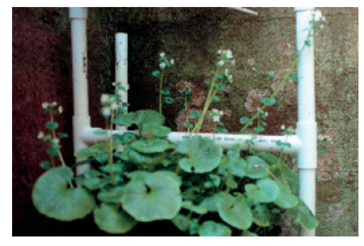
Figure 4. Potted wasabi in flower in a western Washington greenhouse.

Wasabi begins to flower in January, peaks in April, and ends in May (Figure 4). Seed pods are mature