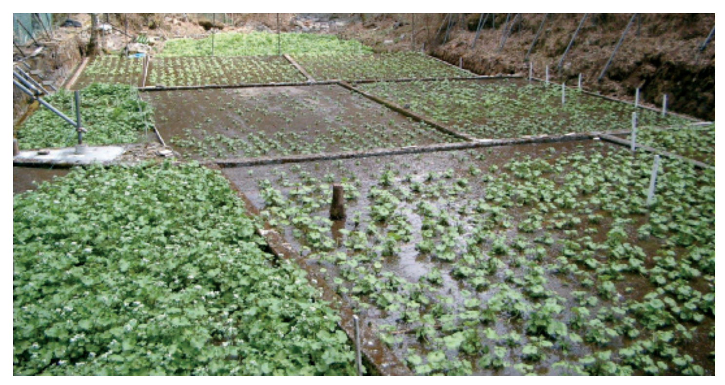
Figure 5. Wasabi grown with the semiaquatic Tatamiishi system in the Shizuoka area near Mt. Fuji, Japan.

To mimic the Tatamiishi system (Chadwick 1990), construct gentle slopes of 1–4% and ensure a water flow rate of 5–6 in. per second (Adachi 1987, Toda 1987). In this system, 2 wasabi stems can be produced per square foot and be ready for harvest in 16–20 months. Hillside terracing provides the best flow and most efficient use of water. Arrange water flow through each terrace so it filters down through the sand, gravel, and rocks that make up the bed,