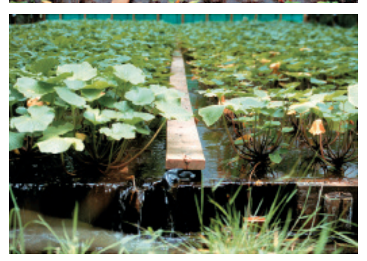
Figure 6. A wasabi-appropriate shade greenhouse in western Washington built on a slight slope with water entering from one end (a), water flowing through a gravel bed full of wasabi (b), and water exiting the other end of the greenhouse (c).