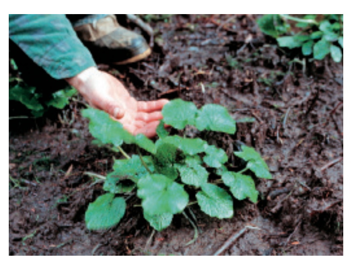
Figure 8. Wasabi grown in soil under an evergreen canopy in coastal, western Washington.