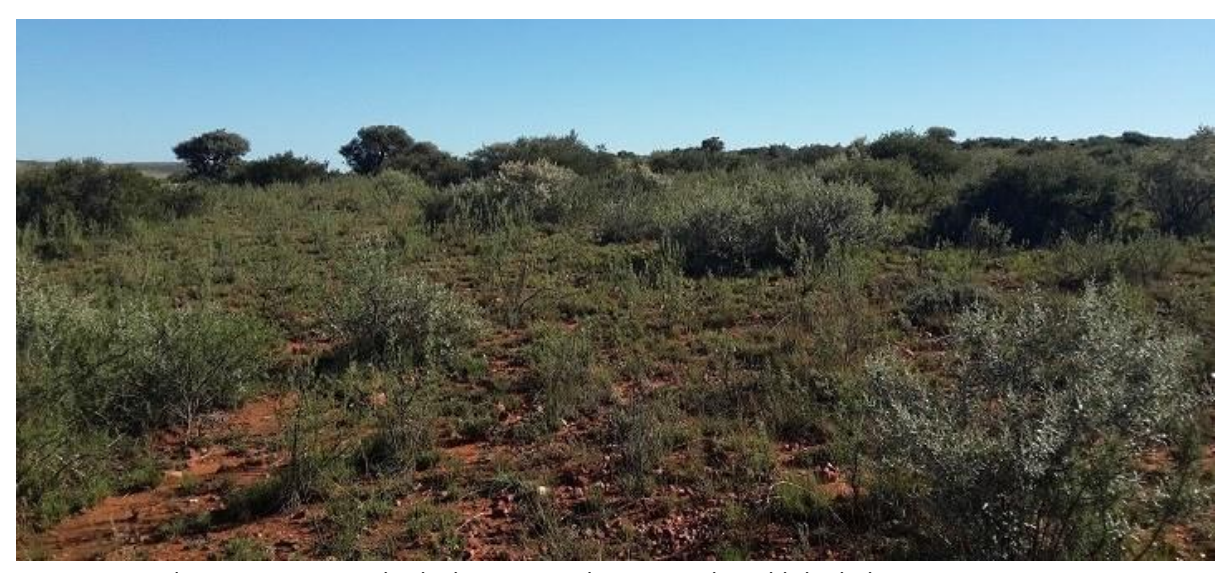
Figure 3: Development Area G with a higher species diversity and established, slow-growing trees.