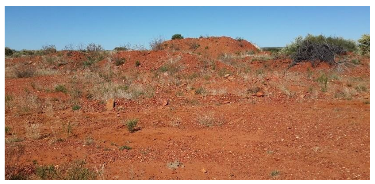
Figure 2: Past prosecting on sections of Development Area B.

Development Area G contained a higher protected species diversity, and also a much higher number of the Wild Olive trees (Figure 3). If possible, this area should be spared from development.