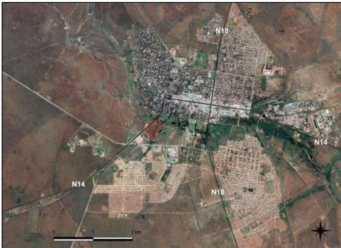
Figure 2: Aerial image of the site and immediate surroundings. *Please note the incorrect cadastral information was used and resulted in survey outside of the property boundary.

The site is open land on the side of the road, between a development to the south, the golf course to the east, and the road to the west. The lowland part of the site contains tall shrubs / low trees, whereas the remainder of the site is a combination of grassland and disturbed areas, all with scattered shrubs. There is an old borrow pit (or similar) in the centre of the site, and recent imagery (July 2021) shows surface disturbance across much of the north-eastern quadrant of the site. In addition, there is a band of variable width adjacent to the N14 road that is historically disturbed.