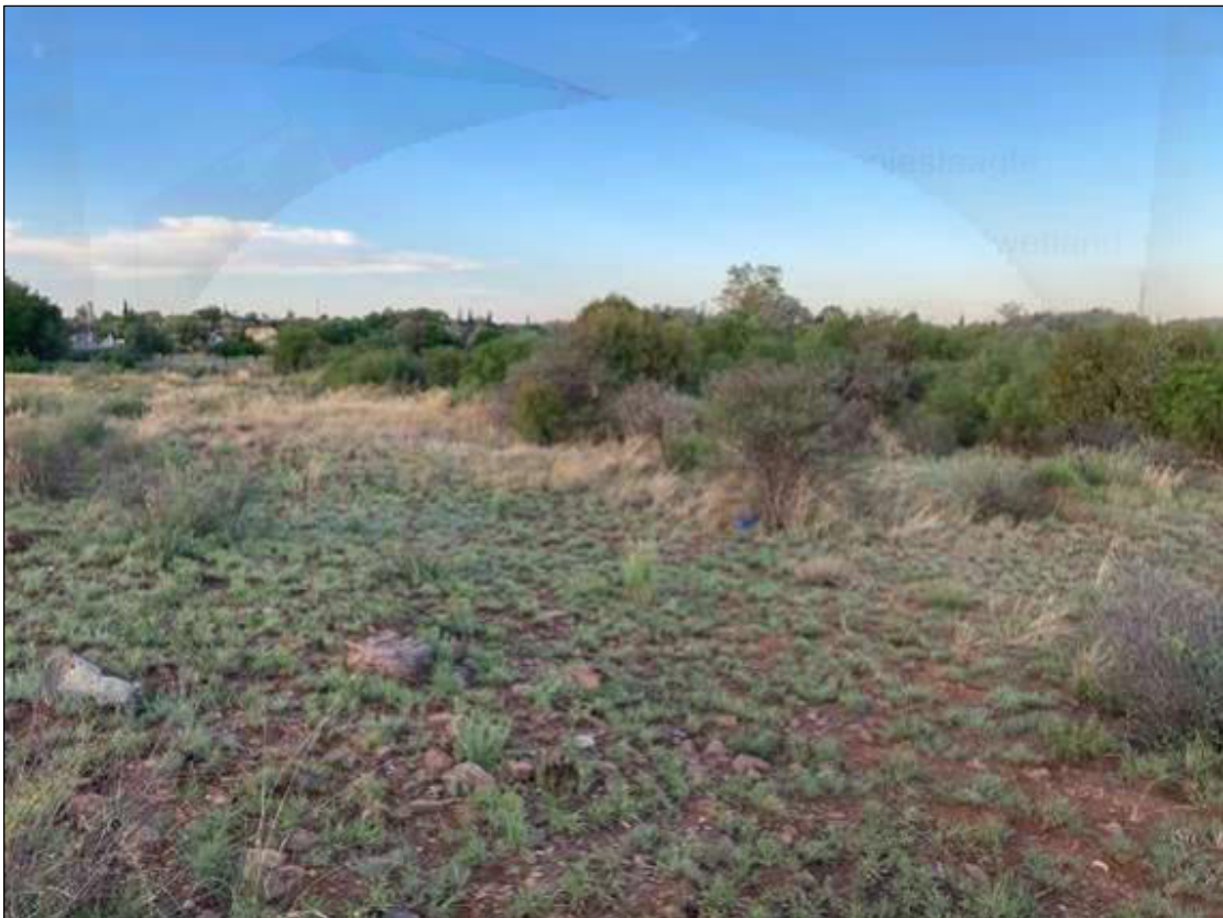
Figure 6: Dense woodland in the valley bottom on site.

There is a small area of grassland remaining on site that is in a natural state (Figure 7). Dominant grasses in this area included Themeda triandra , Setaria sphacelata , Heteropogon contortus , Fingerhuthia africana , Eragrostis superba , and Schmidtia pappophoroides , along with a variety of herbaceous species, including Indigofera daleoides , Rhynchosia sp. , Hibiscus trionum , Sida rhombifolia , Moraea sp. , Albucca sp. , Aptosimum procumbens , Melolobium sp. , Blepharis sp. , Heliotropium steudneri , Macledium zeyheri , Helichrysum argyrosphaerum , Bulbine abyssinica , Aloe grandidentata , Felicia muricata , Trachyandra saltii , Asclepias melliodora , Chascanum hederaceum , Jamesbrittenia tysonii , Lippia scaberrima , Polygala hottentotta , and Thesium magalismontanum .