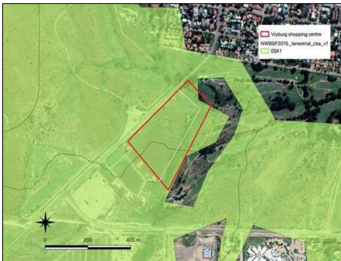
Figure 3: North West Biodiversity Spatial Plan of the site and surrounding areas. Please note the incorrect cadastral information was used and resulted in survey outside of the property boundary. The grey line indicated the approximate location of the correct eastern cadastral boundary.

The NWBSP map for the province shows that the entire site is within an area mapped as Ecological Support Area 1 (ESA1) (Figure 3). This ESA1 area extends for some distance beyond the boundaries of the site in all directions. In fact, it encompasses all non-developed areas in proximity to Vryburg. This indicates that, according to the conservation plan, the natural habitat on site and in surrounding areas is considered to be important for maintaining ecological processes.