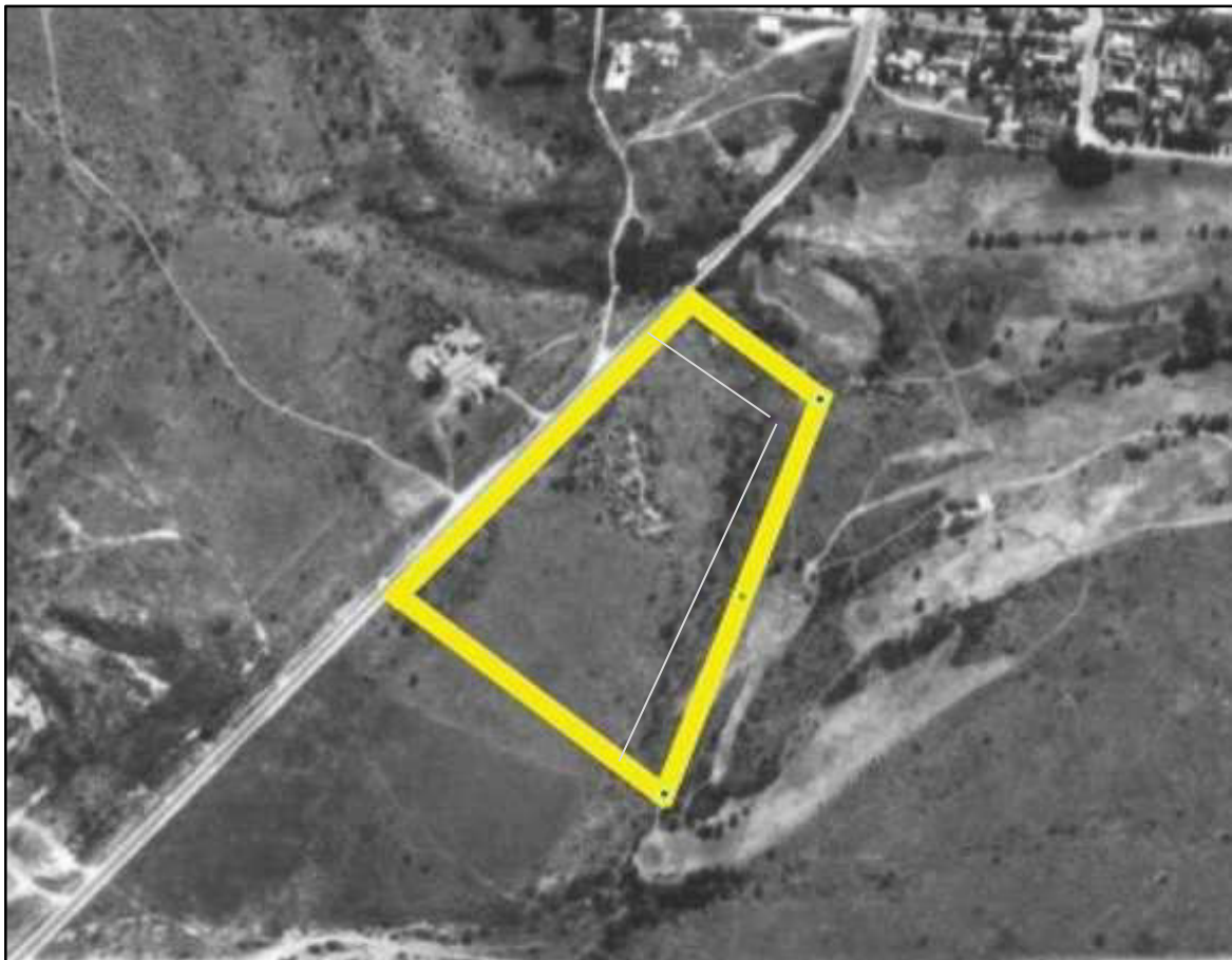
Figure 4: Historical aerial image dated 4 May 1977 showing borrow pits. *Please note the incorrect cadastral information was used and resulted in survey outside of the property boundary. The grey line indicated the approximate location of the correct eastern cadastral boundary.

Historical aerial photographs from 4 May 1977 (Figure 4, site boundaries in yellow) show that the borrow pits on site were already in existence at that time. An aerial photograph from 1959 also shows similar patterns of disturbance. No aerial imagery from earlier dates are digitally available.