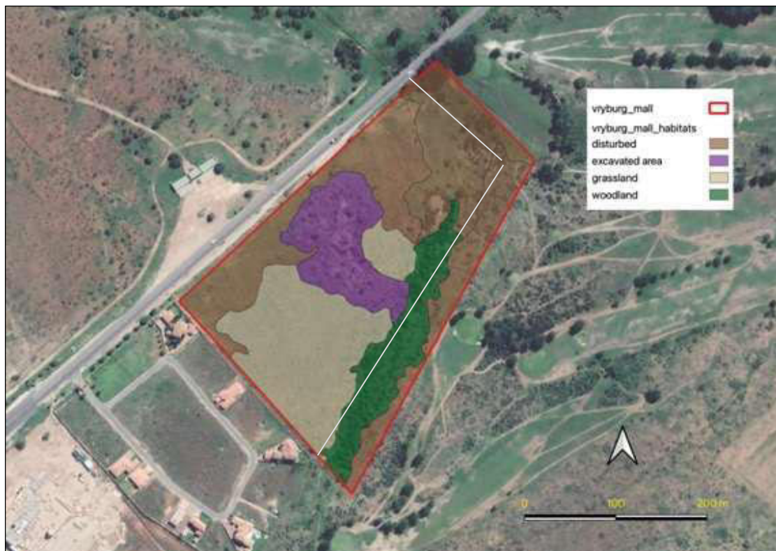
Figure 8: Habitats on site. Please note the incorrect cadastral information was used and resulted in survey outside of the property boundary. The grey line indicated the approximate location of the correct eastern

The site is therefore considered to potentially have ecological value. However, the only remaining habitat on site in a completely natural state, and with potential biodiversity value, is the grassland, which is fragmented by surrounding land-use, and isolated from similar grassland in nearby areas. There is little intact grassland to the east of the site, and this area terminates within existing urban development. There are extensive areas of grassland to the north-west, which are also within a protected area. The relatively small fragment of grassland on site therefore has very limited ecological support value in a regional context.