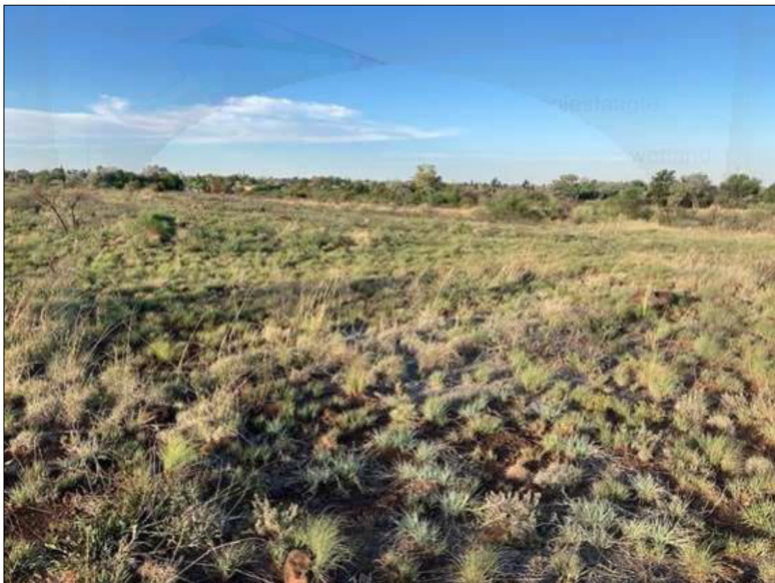
Figure 7: Grassland on site.

No protected tree species were found on site.