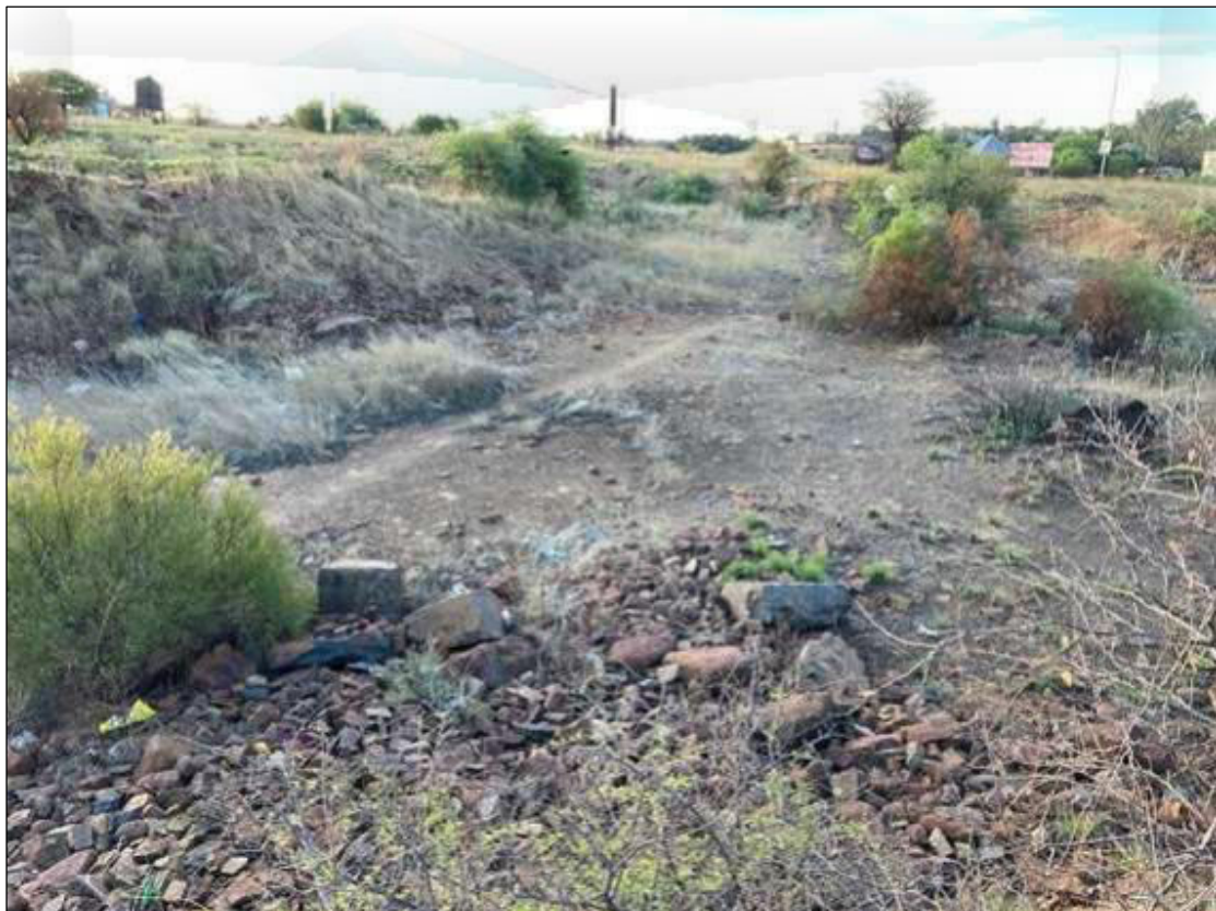
Figure 5: Excavated area in the centre of the site.

There are areas in a band adjacent to the road that were probably disturbed during the process of constructing the road. They are now covered by a secondary vegetation cover that includes grass and weeds.