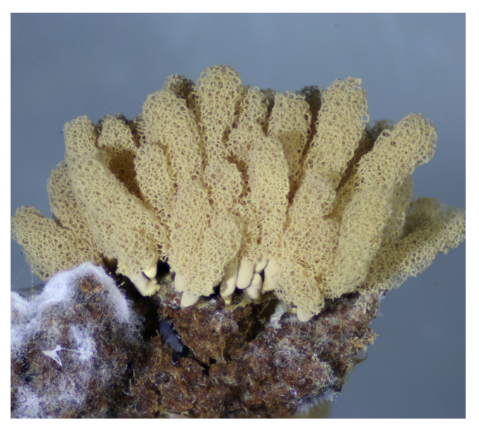
1 Jan. 2017 Arcyria obvelata # 0810 with capillitium expanding soon after being collected.