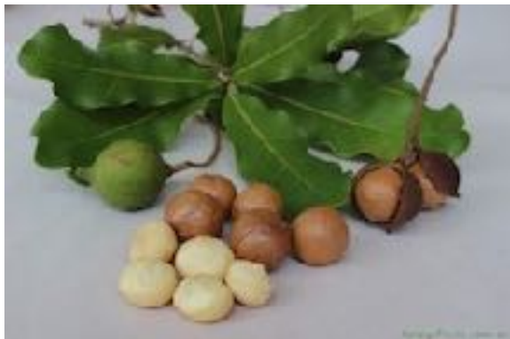
Macadamia integrifolia (Dwarf Macadamia)

http://www.echo.net.au/2013/10/endangered-macadamias-find-a-permanent-home/