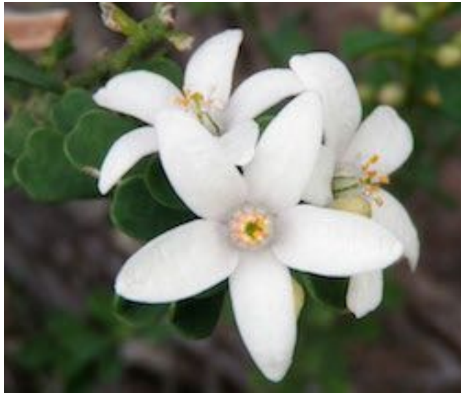
Philotheca freyciana Tas.

Your privacy is respected and assured with this group. You may unsubscribe at any time.