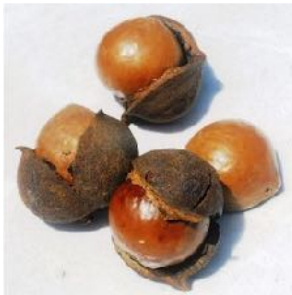
Macadamia tetraphylla (Rough Shelled Macadamia)

The trees, taken from local rainforests, will have signage placed next to their new home to illustrate and educate the community about the Australian macadamia story. It will take approximately four to five years for the species to flower and about 10 years to become fully mature. They grow best in subtropical conditions of good soil, warmth and rain.