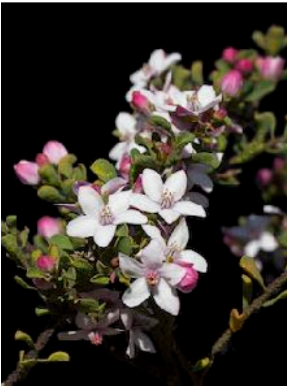
Philotheca freyciana

It occurs on Devonian granite, growing either in rock crevices or shallow sandy soils between massive granite boulders. Associated vegetation includes Eucalyptus amygdalina , E. tenuiramis , Leptospermum grandiflorum , Kunzea ambigua , Calytrix tetragona , Epacris barbata , Allocasuarina monilifera , Dillwynia glaberrima , Monotoca submutica and Hakea megadenia .