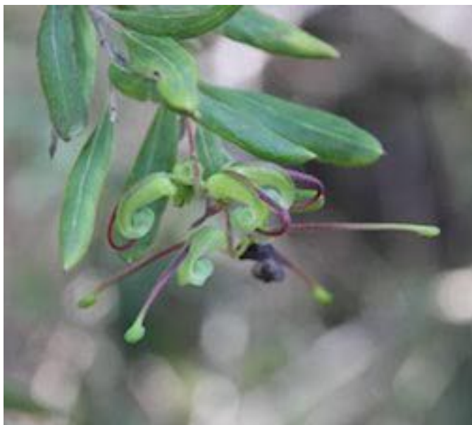
Grevillea guthrieana at Booral