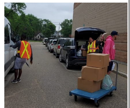
Staff loading food hampers for delivery.