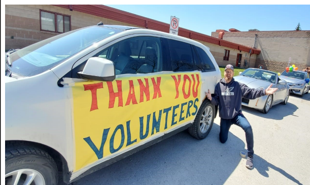
One of the vehicles taking part in our parade honoured our volunteers.