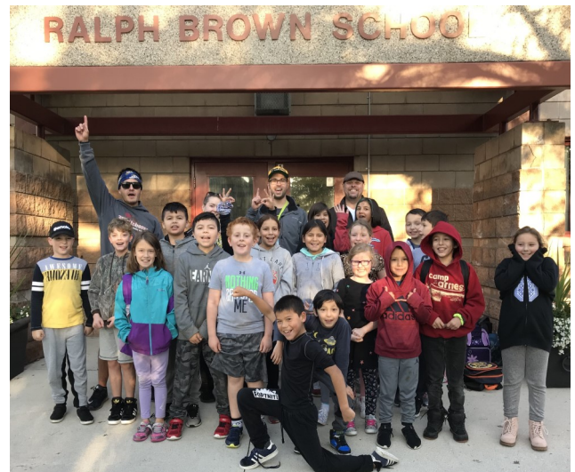
Participants met at the school at 8:00 am on Run Club days