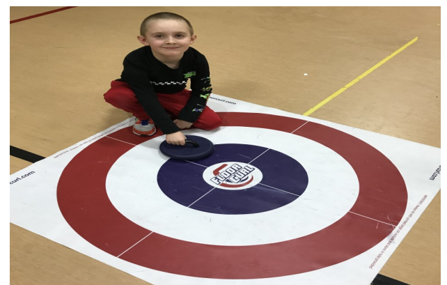
All students were exposed to the sport of curling through the Rocks & Rings Program.