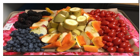
Breakfast Club of Canada, Child Nutrition Council and Breakfast for Learning support our healthy snack and breakfast programs.