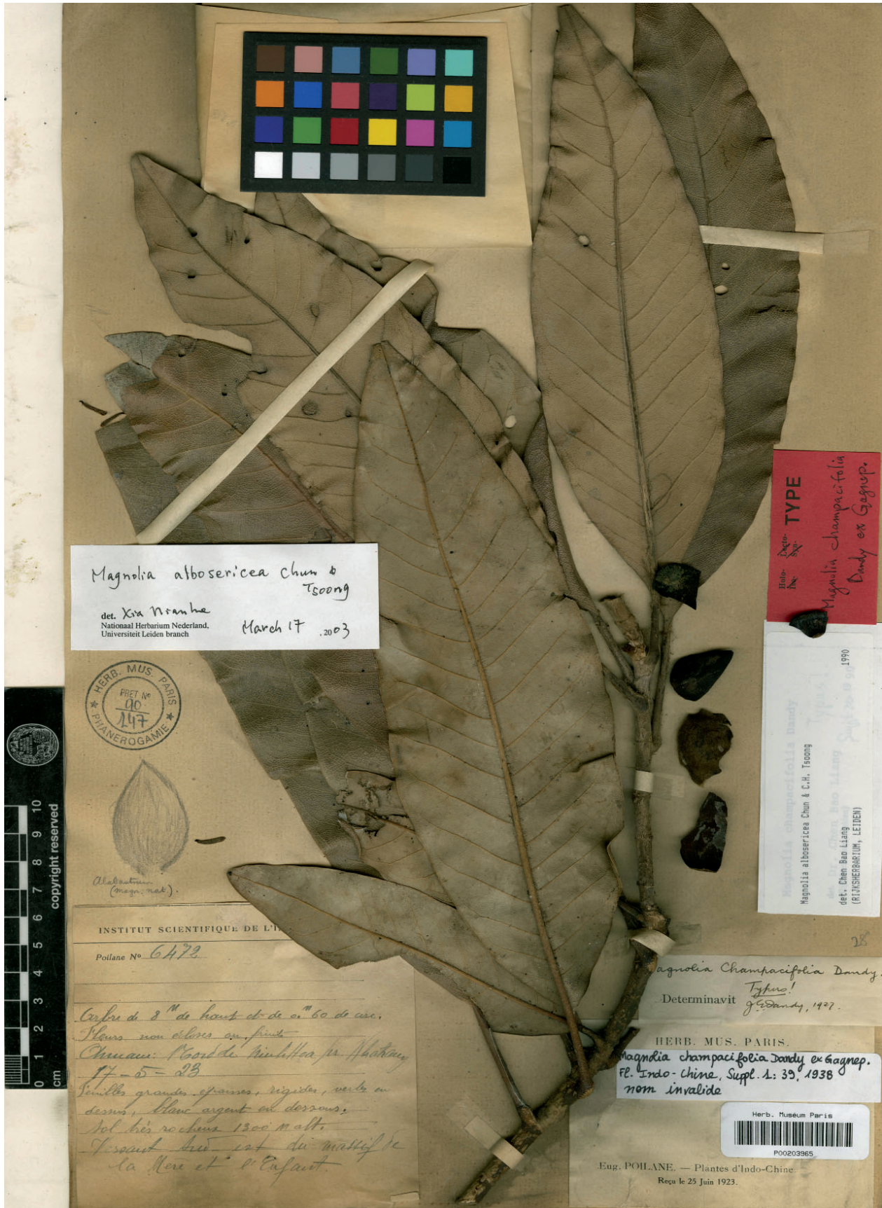
FIG. 1. — Lectotype of Magnolia champacifolia J. E. Dandy ex F. Gagnepain, sp. nov. (P00203965).