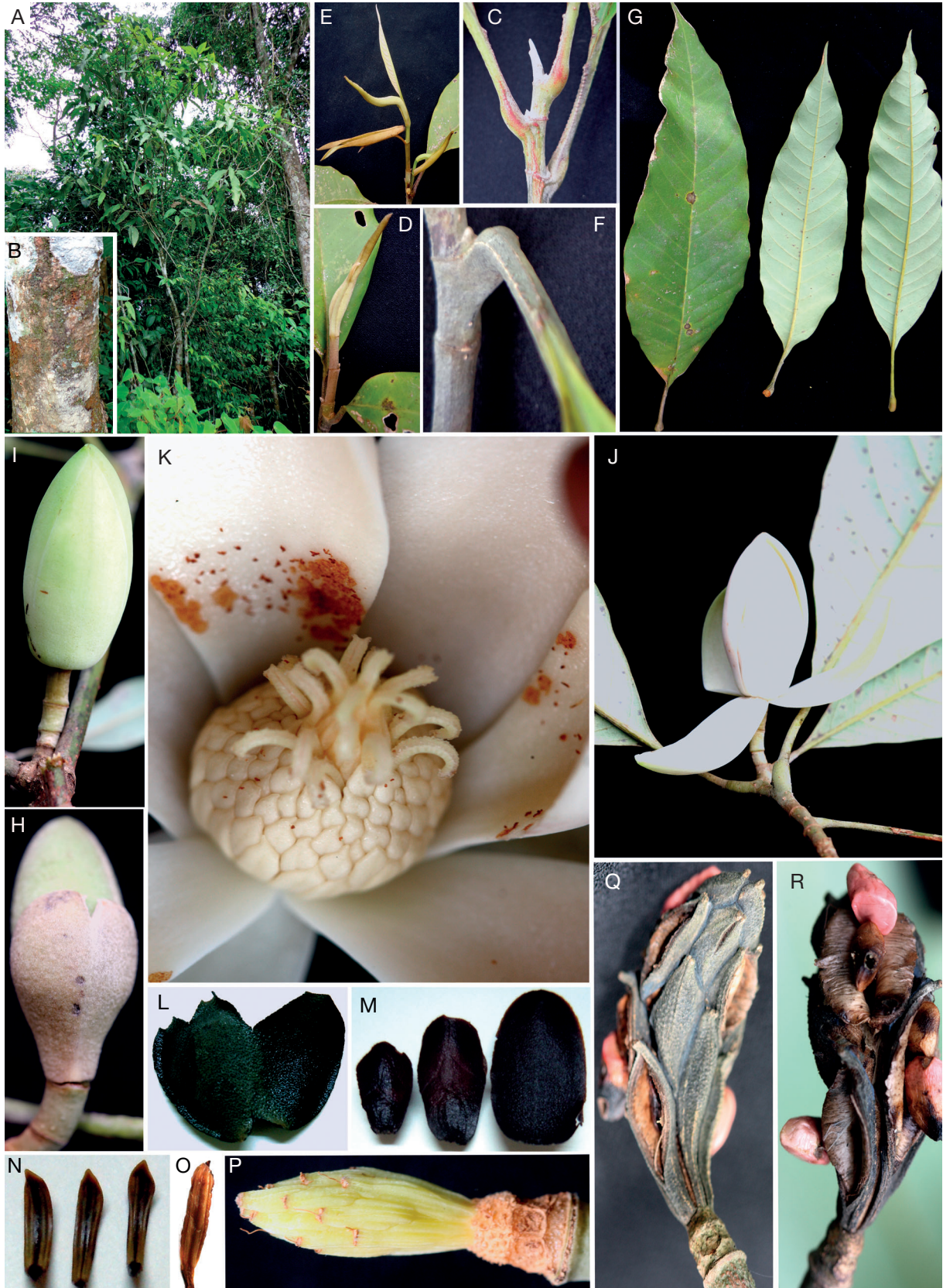
FIG. 3. — Magnolia lamdongensis V.T. Tran, N.V. Duy & N.H. Xia, sp. nov.: A , habit; B , bark; C , old twigs; D , E , young twigs with terminal bud; F , petiole with stipular scar; G , leaf blades (adaxial and abaxial sides); H , terminal flower with bracts; I , terminal flower without bract; J , flowering twig; K , androecium and gynoecium at the anthesis (top view); L , spathe; M , tepals (right: outer tepal, middle: middle tepal and left: inner tepal); N , stamens (ventral side); O , stamen (dorsal side); P , receptacle and gynoecium; Q , fruit aggregate; R , fruit with seeds. Photos by Nong Van Duy & Tran Van Tien from the type locality.