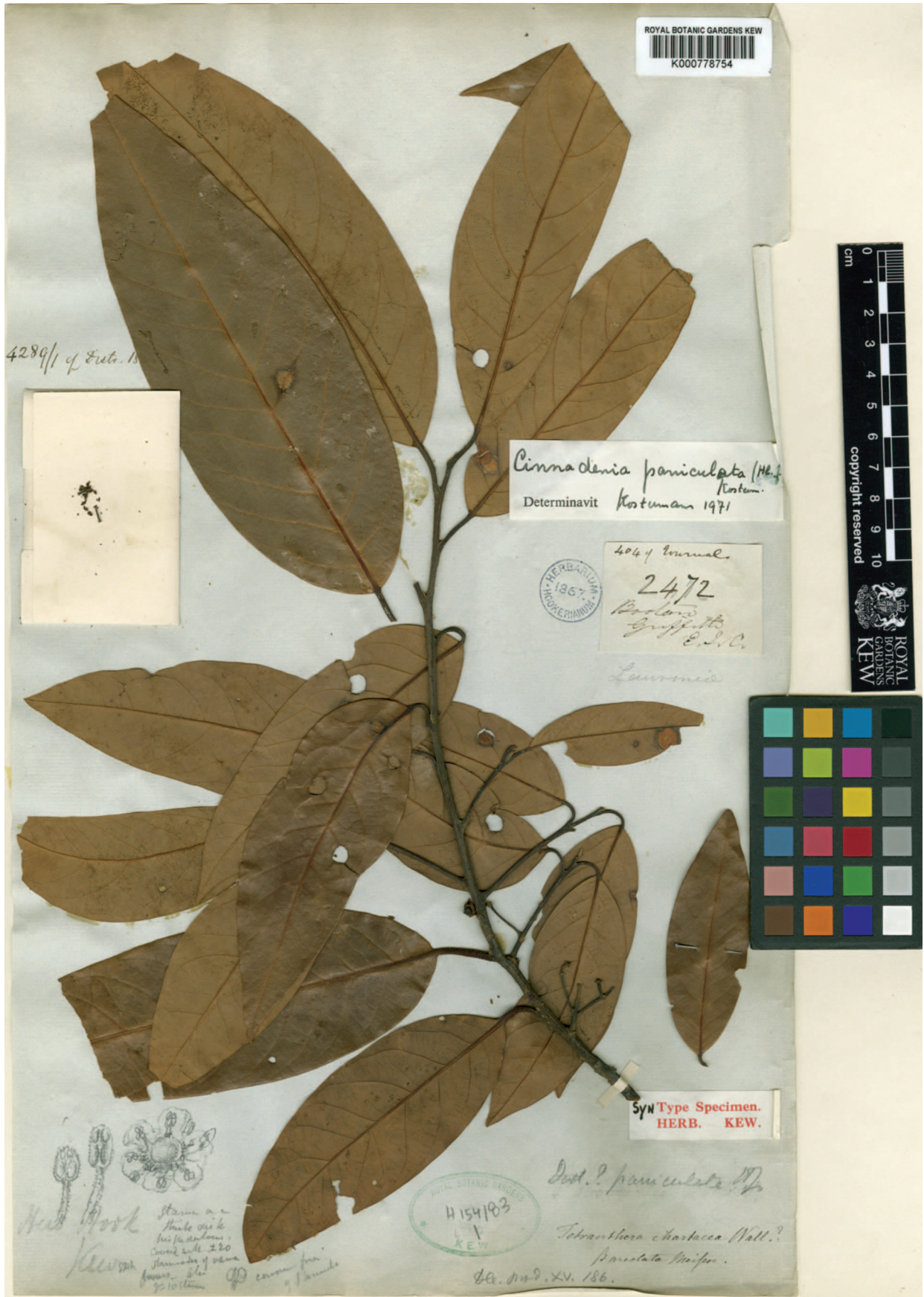
FIG. 4. — Lectotype of Cinnadenia paniculata (Hook. f.) Kosterm. (K000778754)