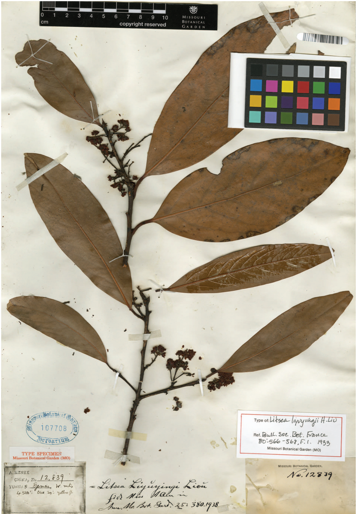
FIG. 2. — Isotype of Cinnadenia liuyingii (H.Liu) de Kok & Sengun, comb. nov. (MO-1889408).