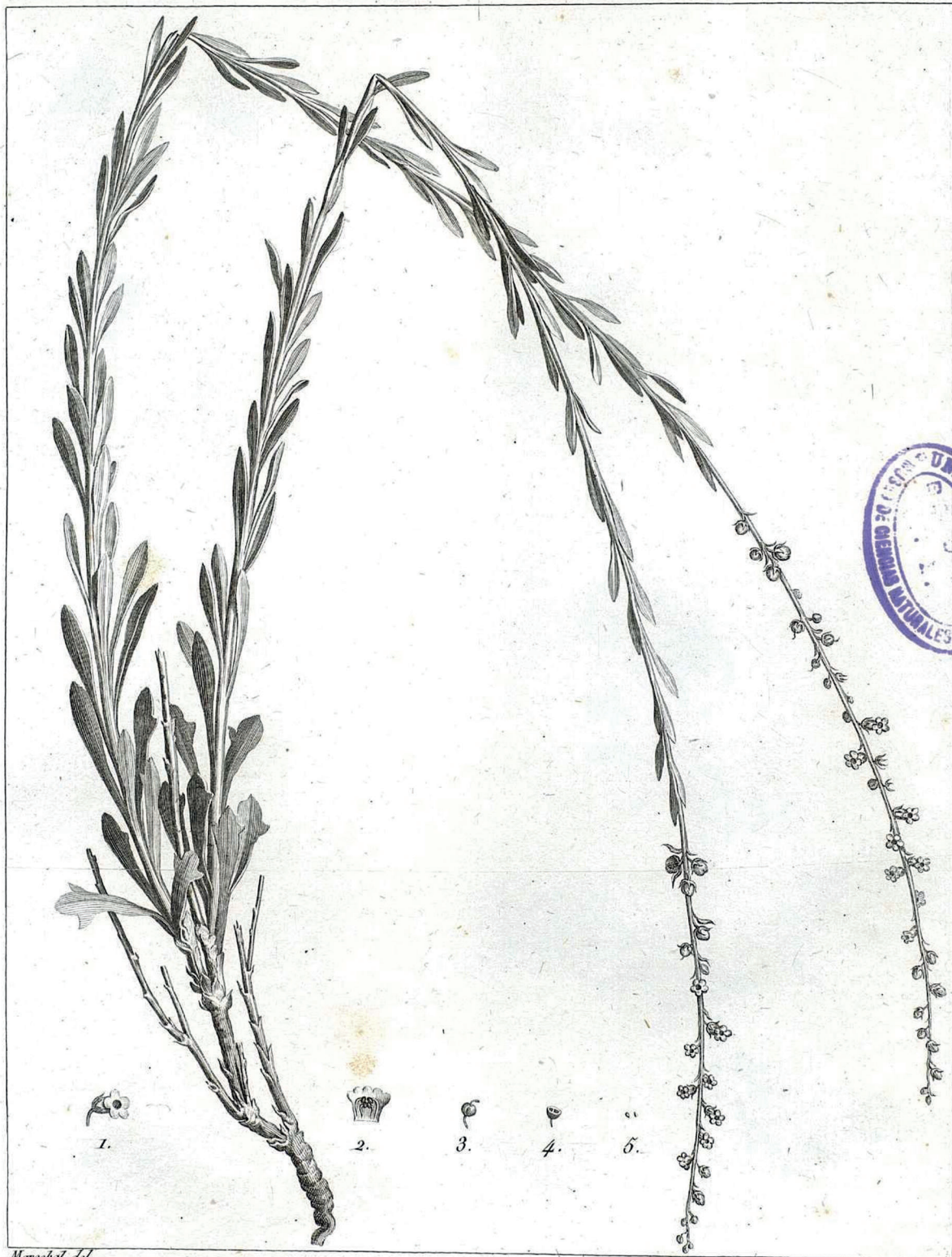
FIG. 1. — Lectotype of Anarrhinum fruticosum Desf., illustration in Desfontaines (1798: pl. 142).