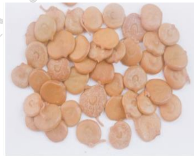
Pic 2. Seed of Acacia