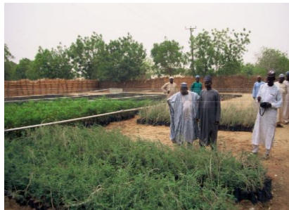
Pic 1. Supervision of planted seedlings in a nursery senegal

Comment [DRA6]: List all authors for the first time