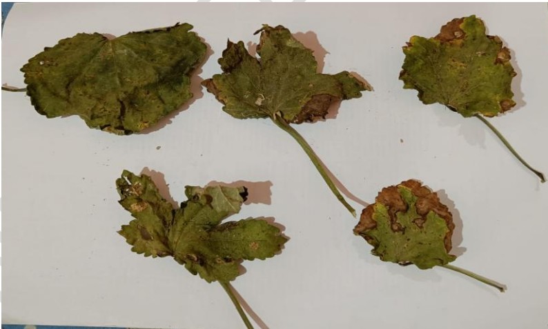
Fig 1. Overview of Disease Infested Leaves

Comment [Id15]: Caption should be fully justified and self understandable e.g., Cercospora disease infected leaves (at what growth stage?)