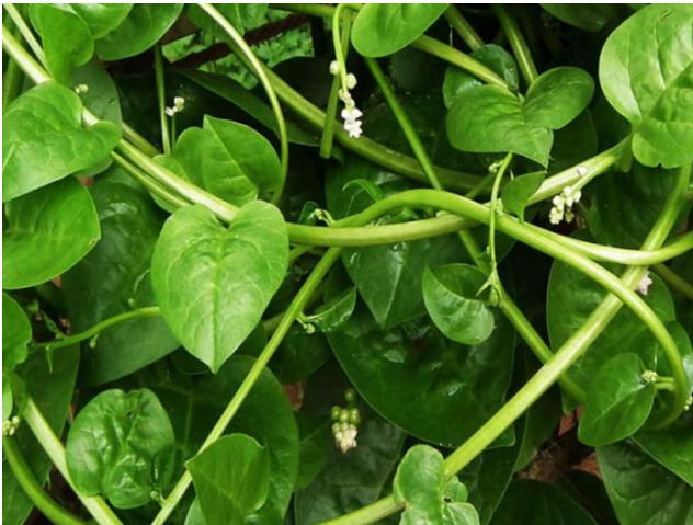
Plate 1: Basella alba . A dominant climber found at brackenhurst. Botanic Garden

The table also shows their habit in which several species of climbers fall.