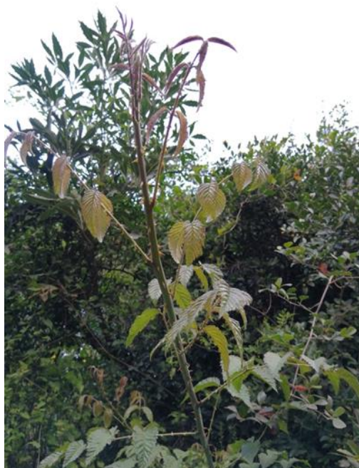
Plate 2: Rubus pinnatus willd. A support plant that also doubles up as a climber